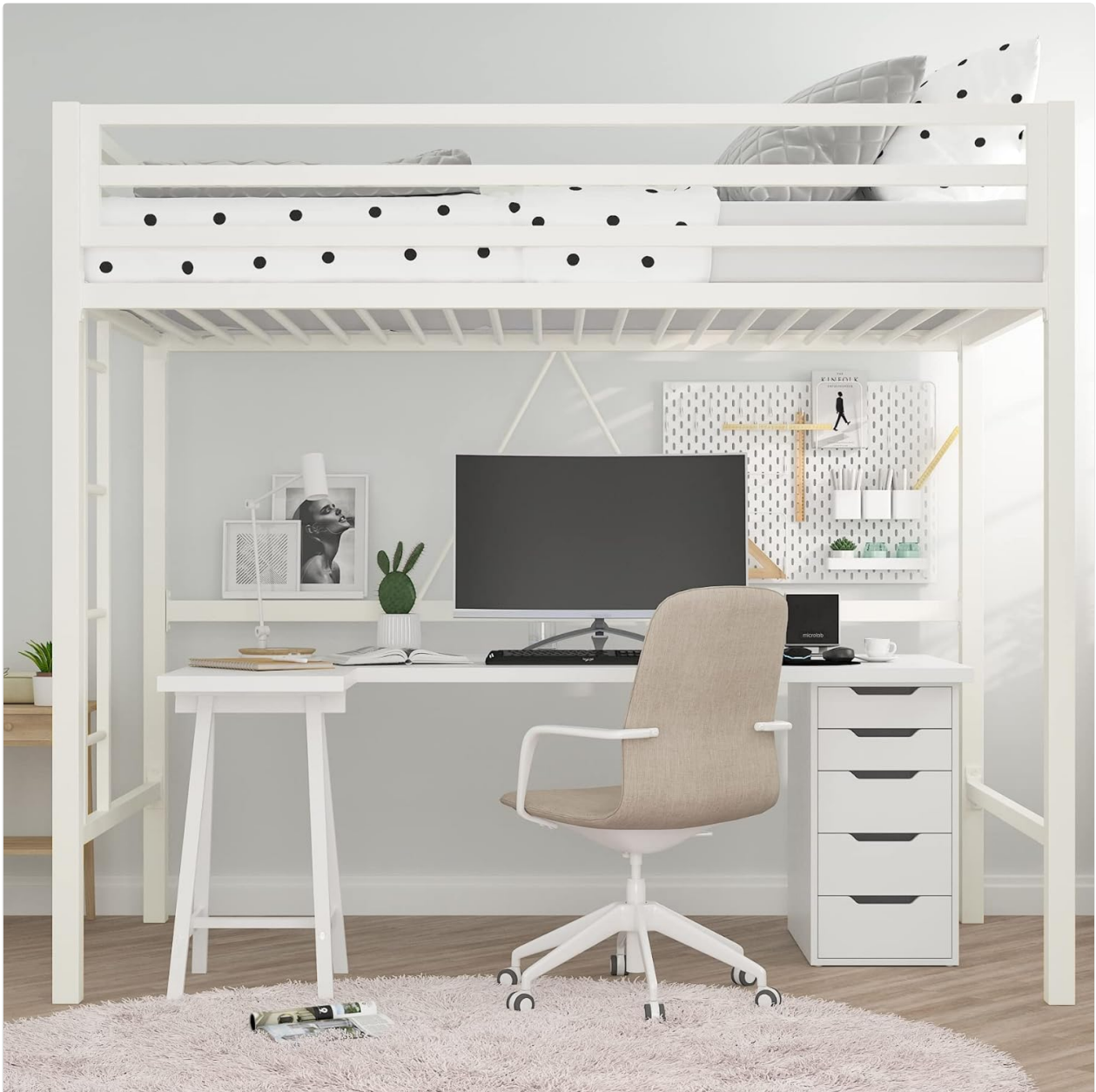
Image: Example setup showing a desk and chair placed under the loft bed, illustrating its space-saving design.