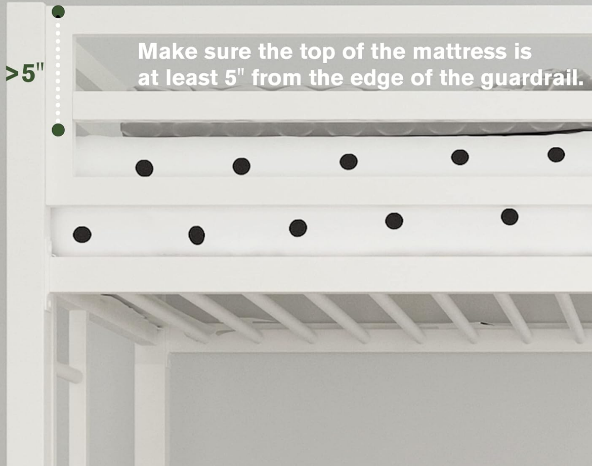
Image: Recommended mattress height. The top of the mattress must be at least 5 inches below the guardrail.