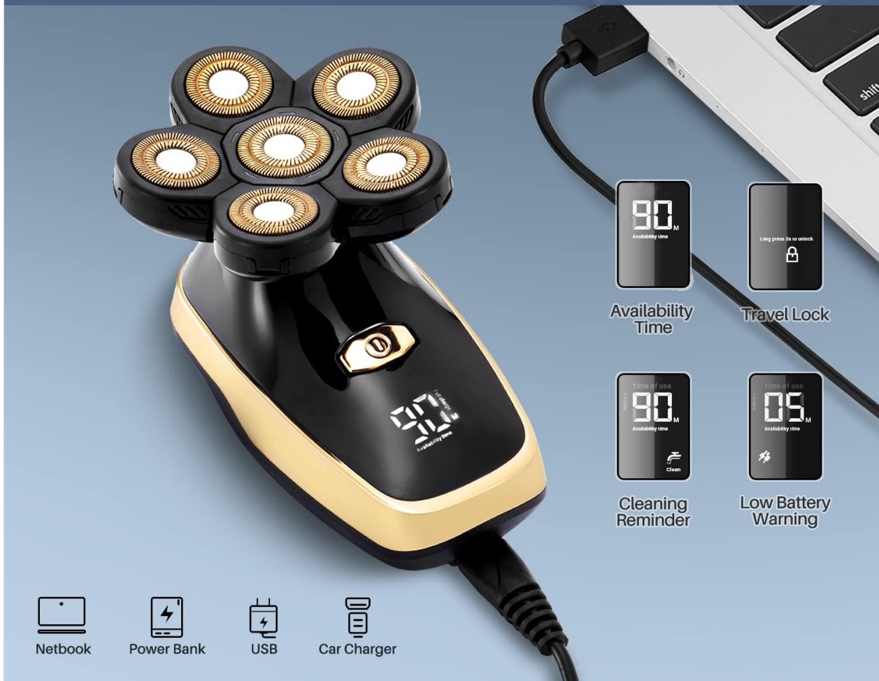
Figure 3: Intelligent LED Display and USB charging capability.