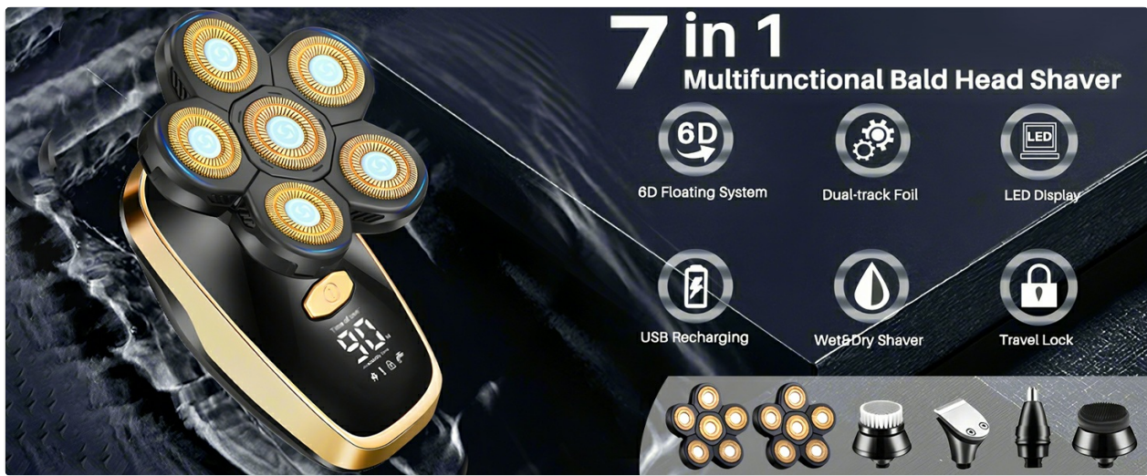
Figure 6: The shaver supports both wet and dry shaving.