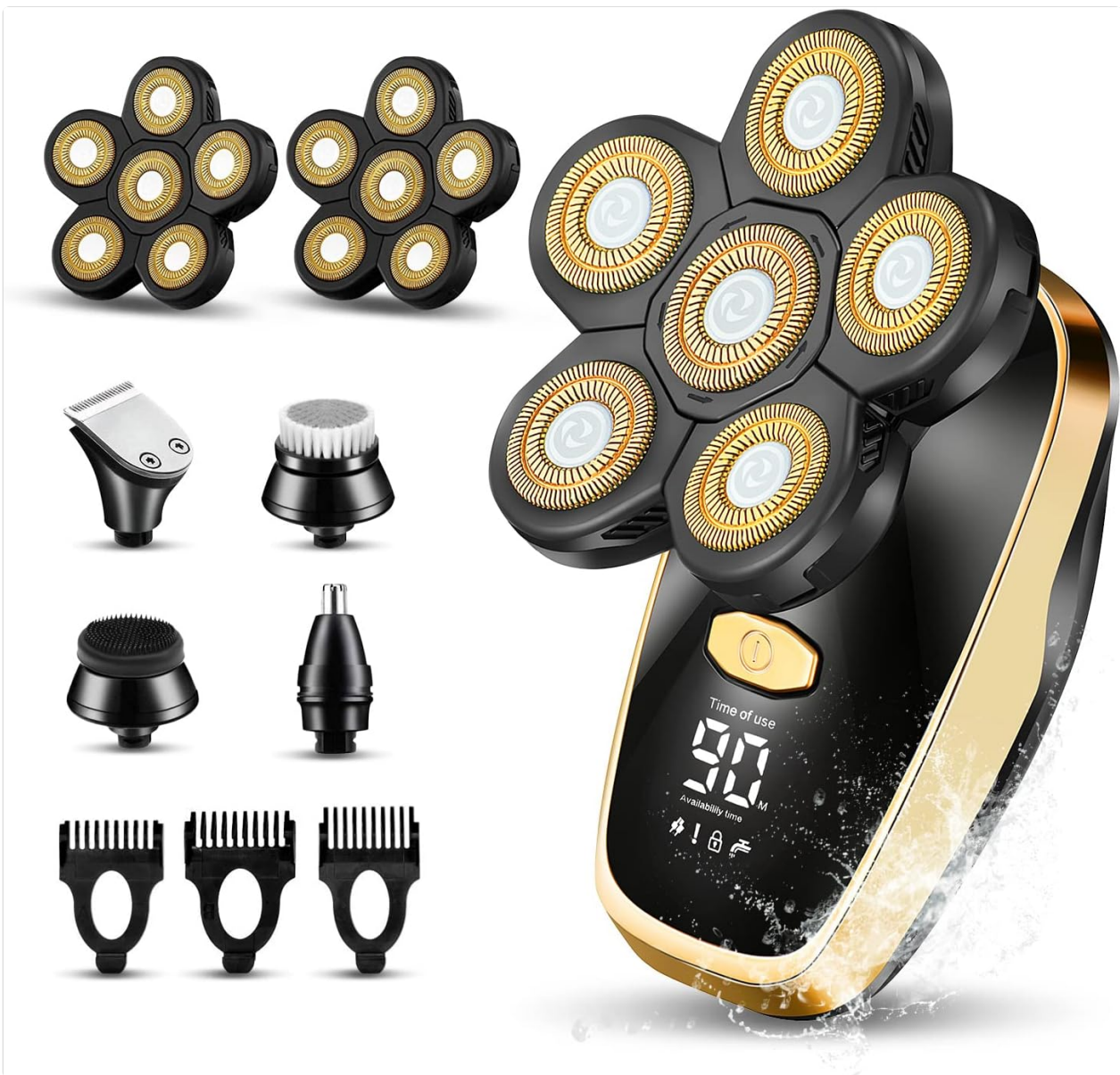
Figure 1: YHAYHO HT-990T2 Rotary Electric Head Shaver and included accessories.