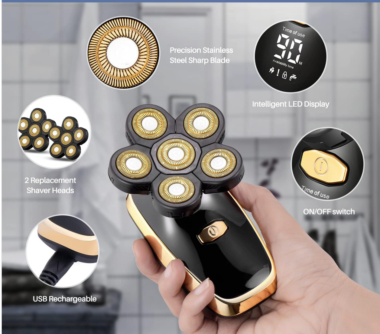
Figure 5: Attaching and detaching shaver heads and accessories.