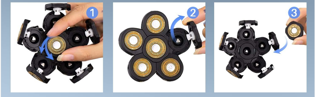
Figure 8: Steps for cleaning the waterproof shaver head.