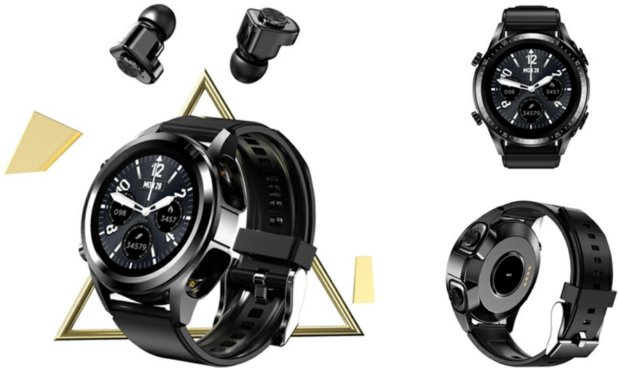
Image 4.1: Overview of Tuanzi JM03 Smart Watch functions. This image illustrates the various features of the smartwatch, including earphone headphones, blood pressure monitoring, 24h heart rate monitoring, blood oxygen monitoring, exercise data, sleep monitoring, find phone, alarm clock, stopwatch, message notification, call rejection, and music control.