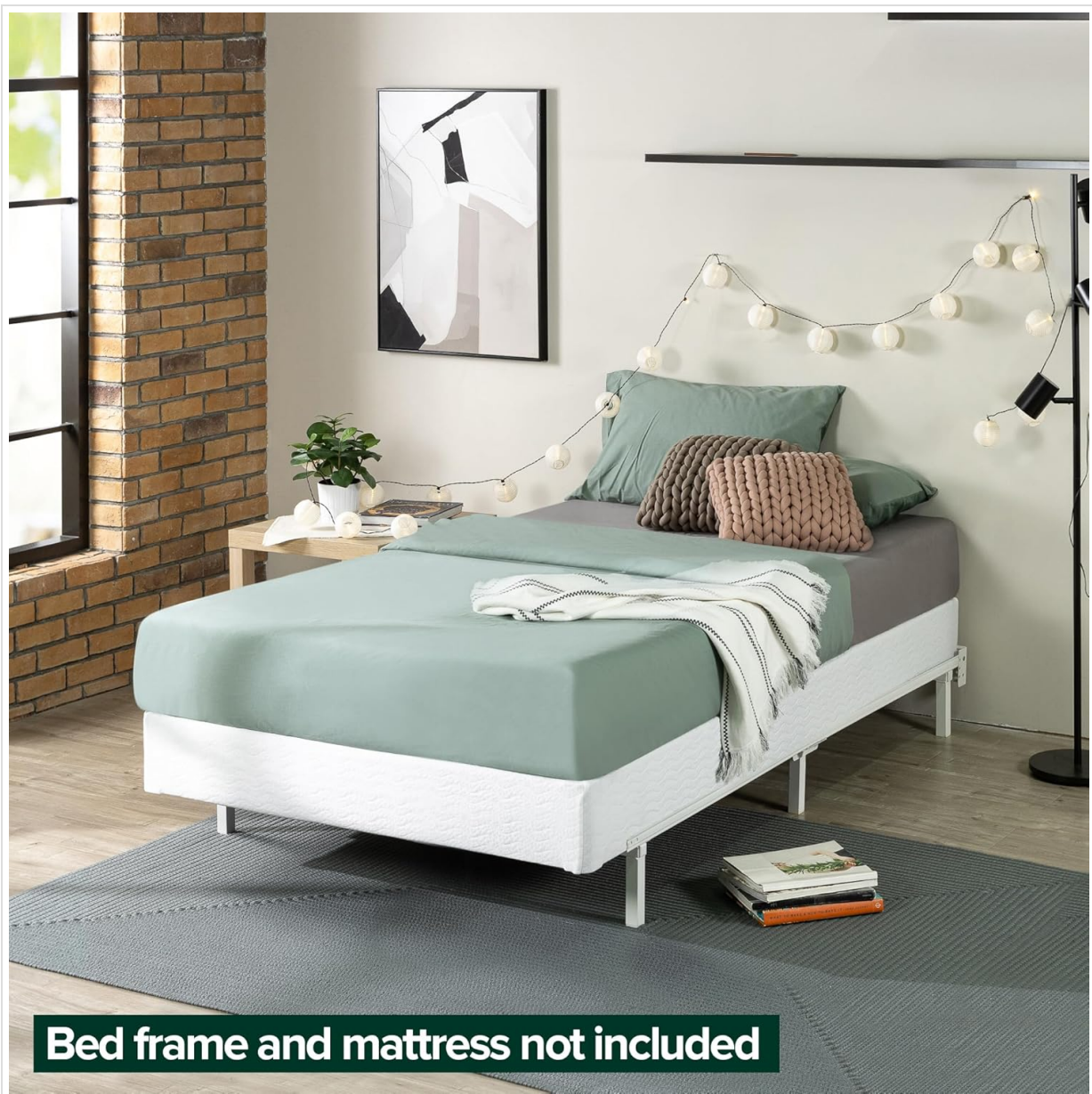
Image: The Zinus Smart Box Spring with a mattress, ready for use.