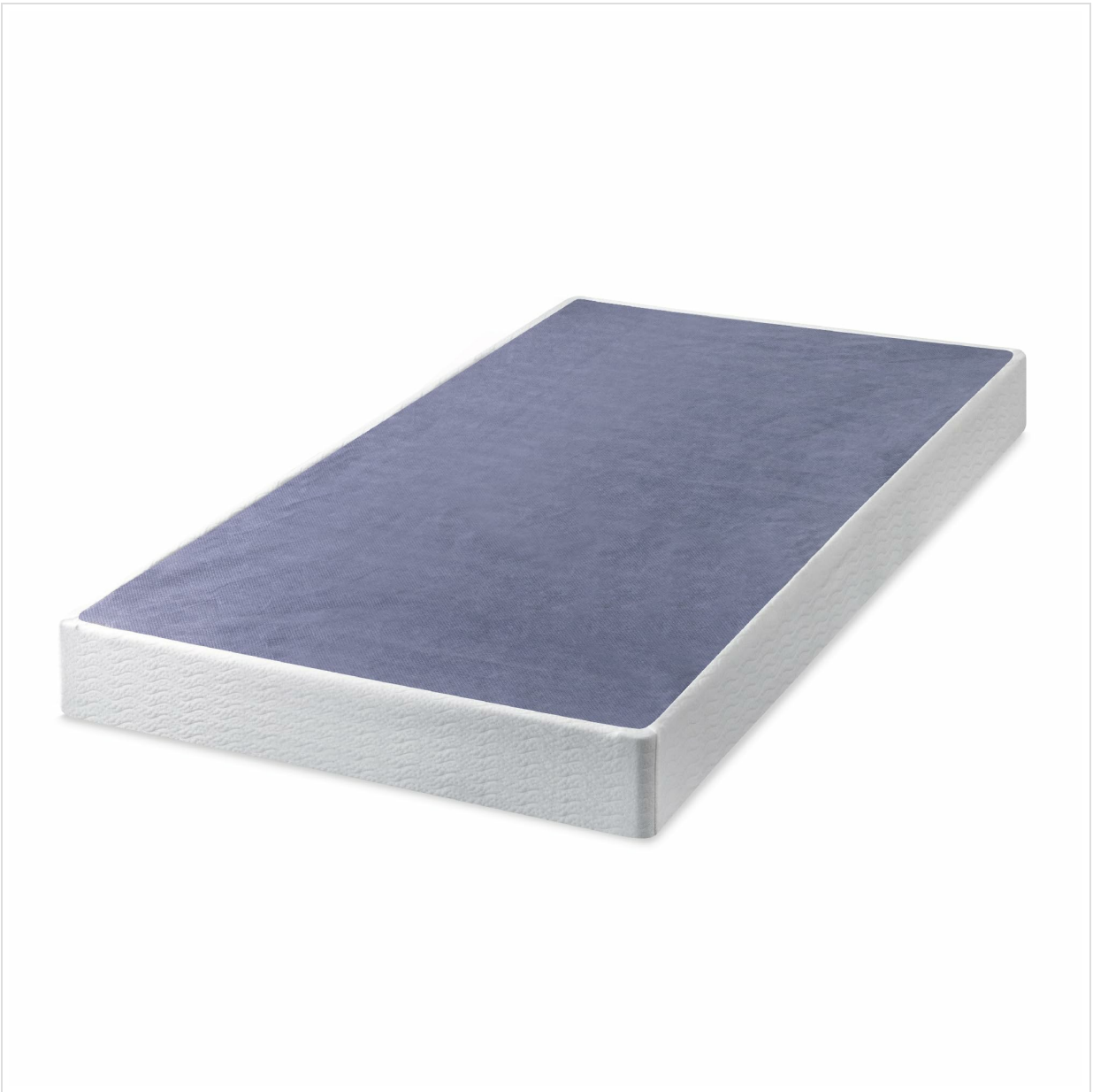
Image: Comparison of Twin vs. Twin XL box spring dimensions.