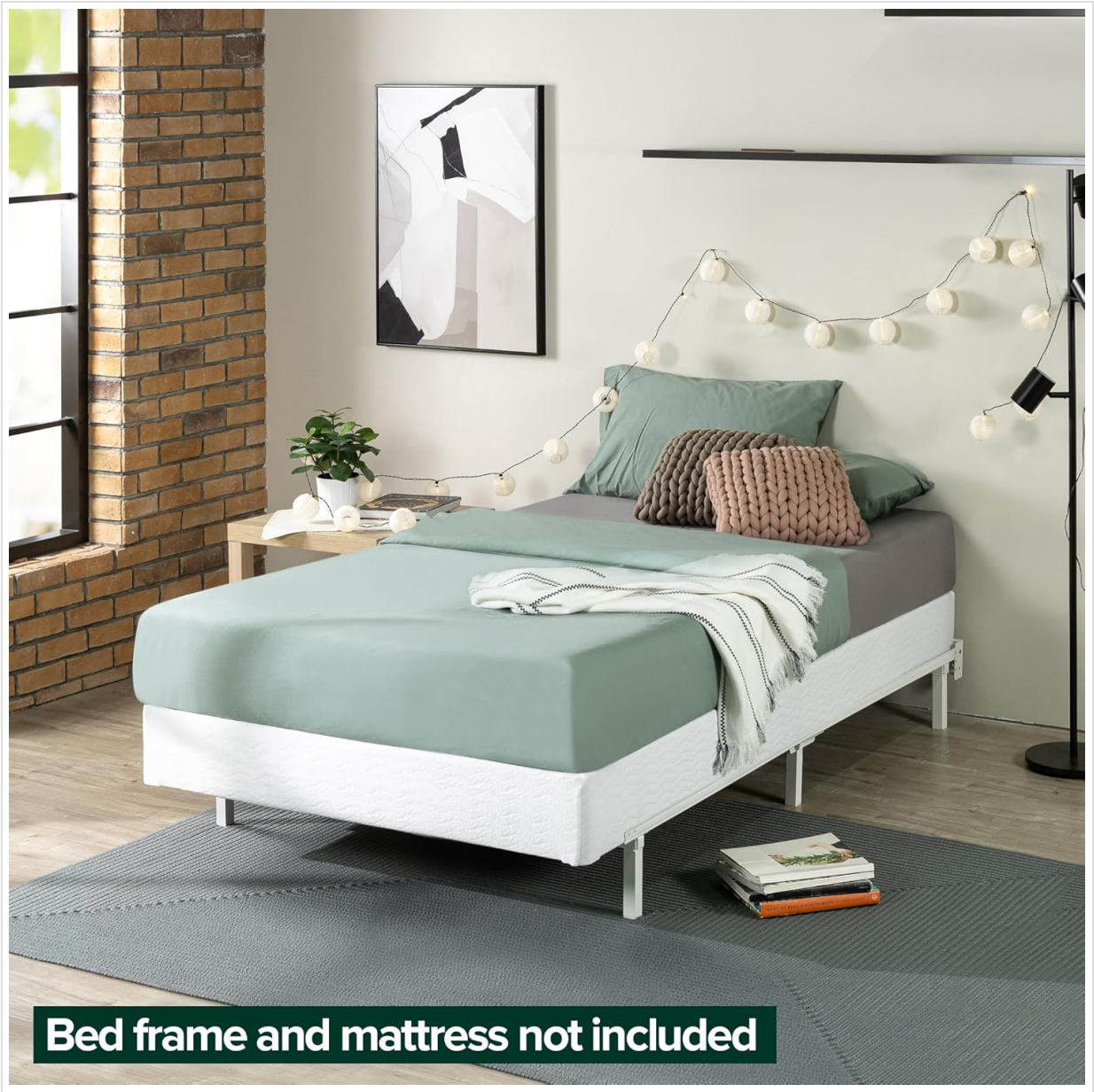
Image: Zinus 7 Inch Twin Metal Smart Box Spring in a bedroom setting.