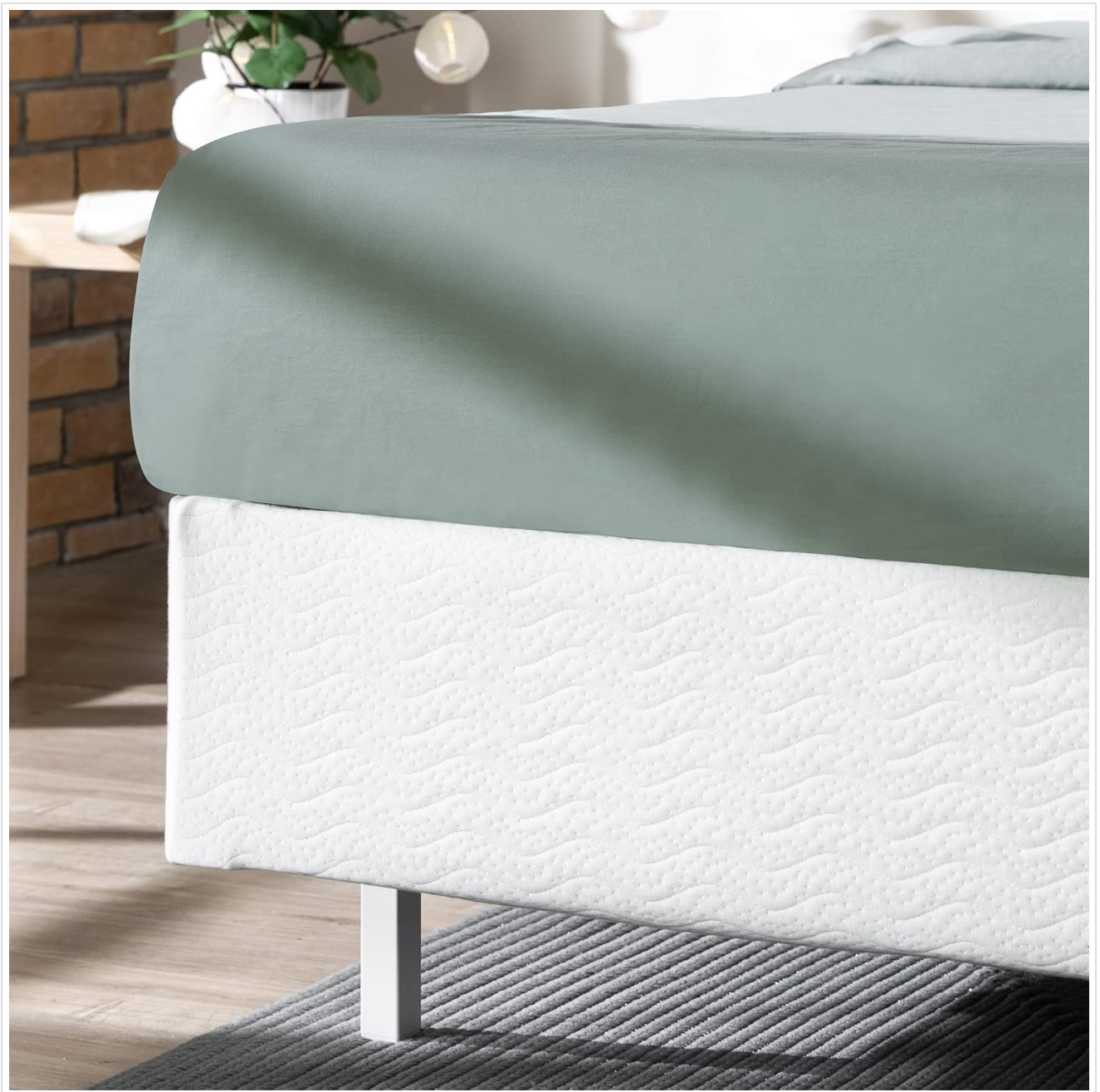
Image: A close-up showing the elastic band cover being easily applied to the box spring frame.