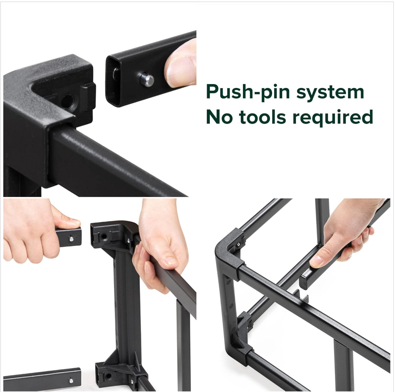
Image: Detail of the tool-free locking brackets, showing how they connect the frame pieces for intuitive setup.