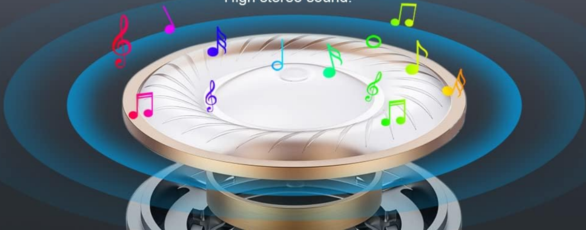
Image: Jesebang by-02 Wireless Earbuds in their charging case.

Featured with advanced technology & powerful bass sound performance each earbud enables you to enjoy crystal clear High stereo sound.