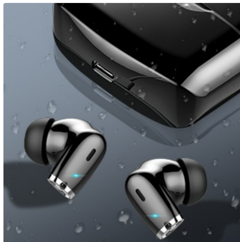
Image: Different sizes of ear tips (Small, Medium, Large) for a customizable fit.