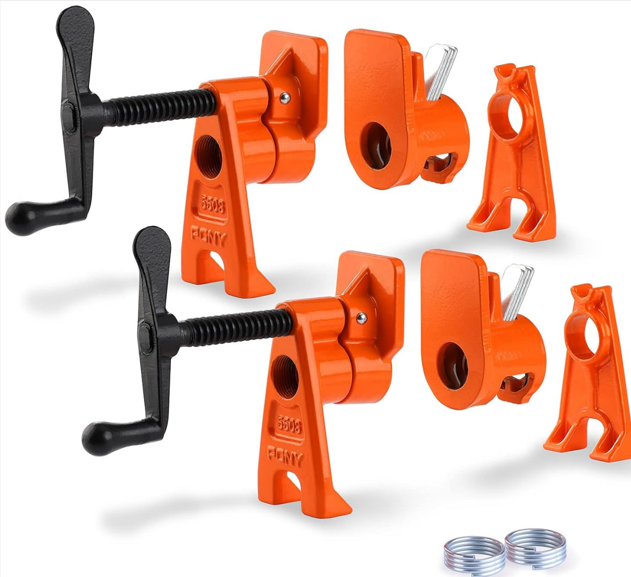
Image: Two sets of PONY PRO Pipe Clamp Fixtures, showing the fixed jaw, movable jaw, and included coil springs. These fixtures are designed to be used with 3/4-inch black pipes, which are not included.