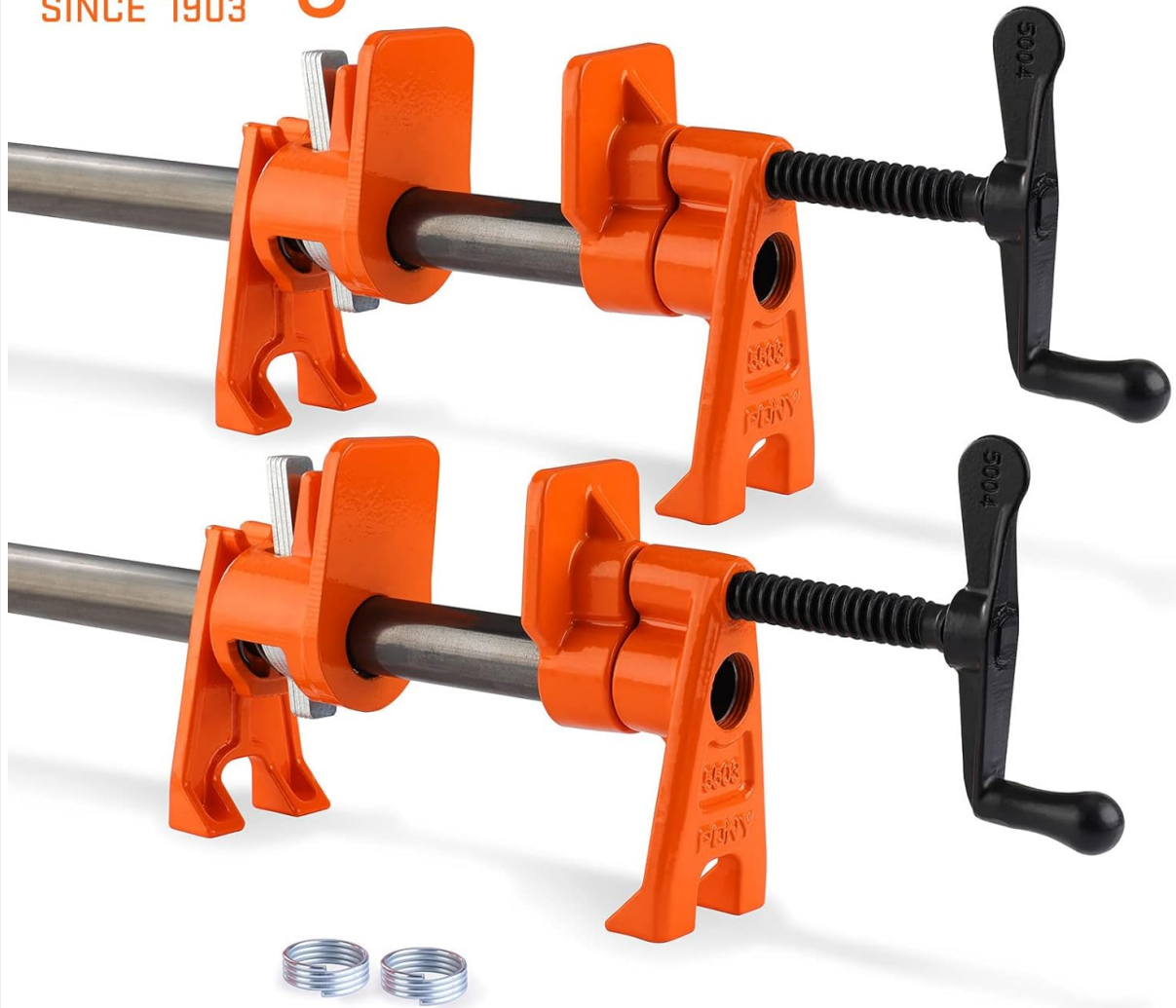
Image: The two main components of the pipe clamp fixture (fixed jaw with screw and movable jaw with clutch) laid out next to a black pipe, ready for assembly.