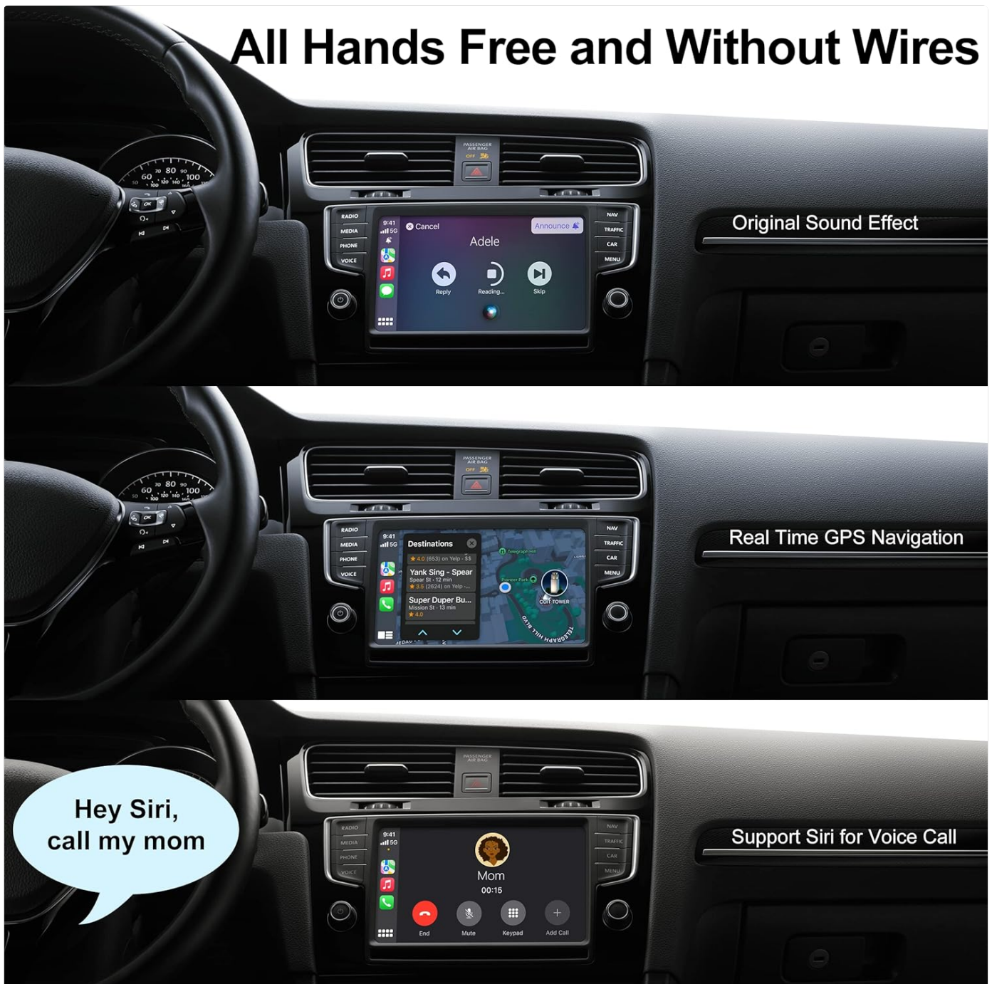
Image: Screenshots of a car's infotainment system displaying CarPlay interfaces for music playback, real-time GPS navigation, and a voice call using Siri.

The adapter supports hands-free operation, allowing you to use CarPlay features like music, navigation, and voice calls (e.g., Siri) without physically interacting with your phone.