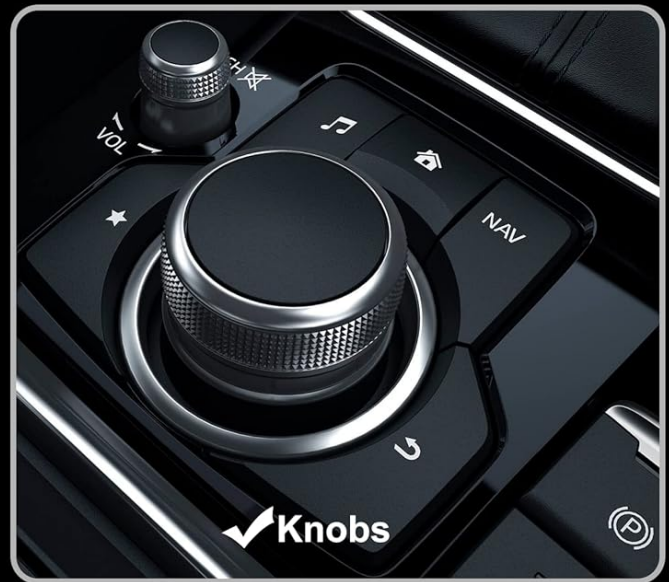
Image: Close-up views of a car's steering wheel buttons, infotainment touchscreen, and control knobs, indicating that the CarPlay adapter is compatible with these existing car controls.

The SuperiorTek CarPlay Adapter is designed to work seamlessly with your car's existing controls, including steering wheel buttons, touchscreen, and physical knobs, ensuring a familiar and intuitive user experience.