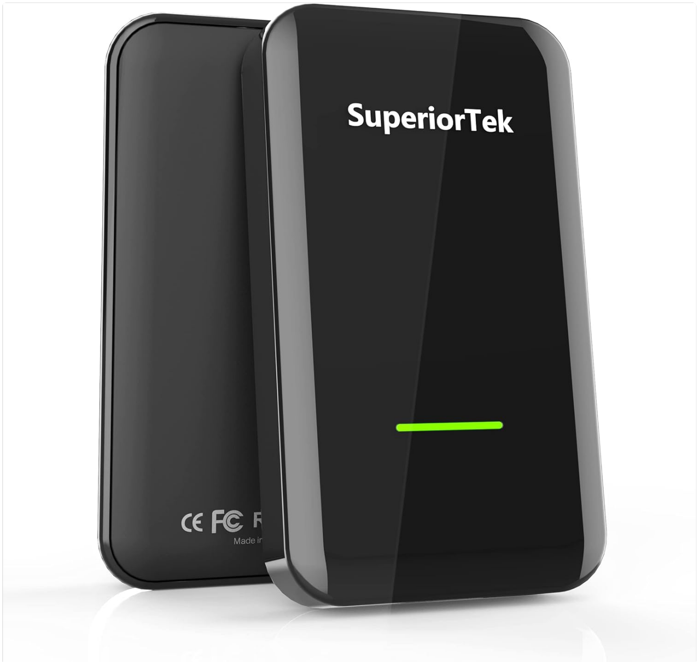
Image: The SuperiorTek 3.0 Wireless CarPlay Adapter, a compact black device with a green indicator light.

The SuperiorTek 3.0 Wireless CarPlay Adapter is a compact and user-friendly device designed to provide a reliable wireless CarPlay experience. Its slim design allows for discreet placement within your vehicle.