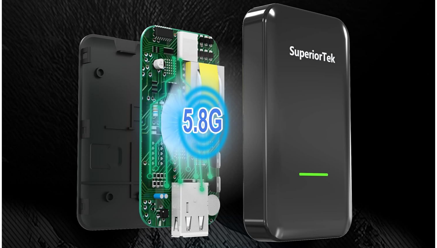
Image: An exploded view of the adapter showing its internal components, emphasizing the 5.8GHz certification module and power management chip.

Equipped with an advanced Smart IC Chip and Next Generation Signal Filter Technology, the adapter ensures a stable and continuous connection. This technology enhances Wi-Fi signals, leading to clear audio and video, minimal lag, and responsive GPS navigation, comparable to a wired connection.