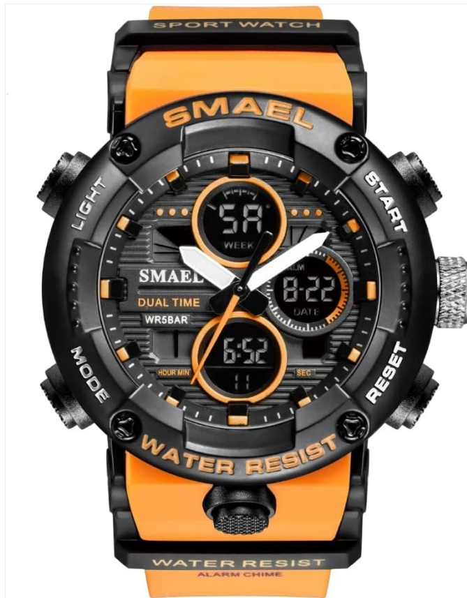
Image: SMAEL Model 8038 Sport Watch with orange strap, showcasing its dual analog and digital display. The watch face is black with orange accents, and the buttons are visible on the sides.