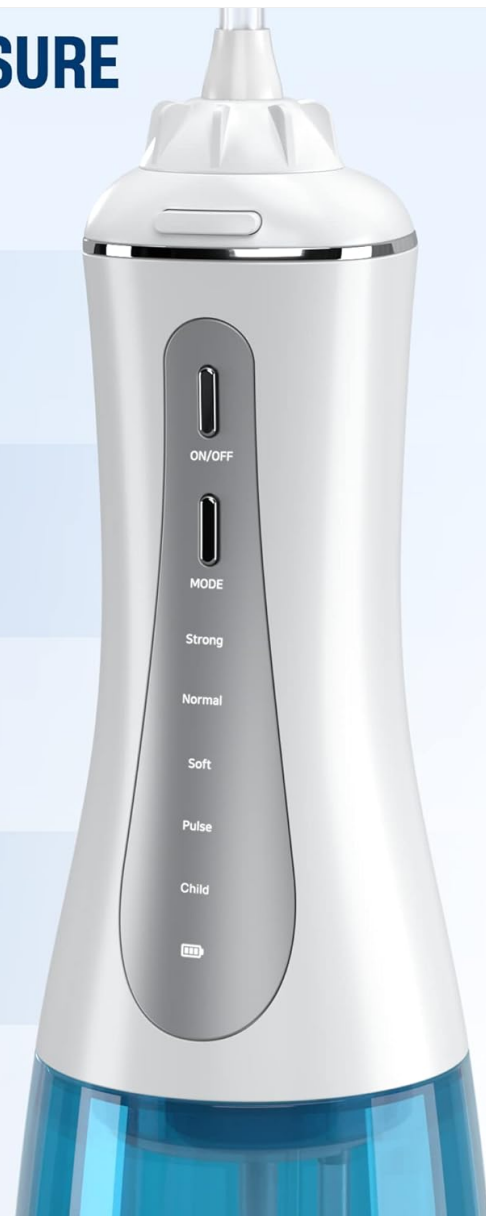
Image: The water flosser control panel displaying the five distinct pressure settings and their recommended uses.