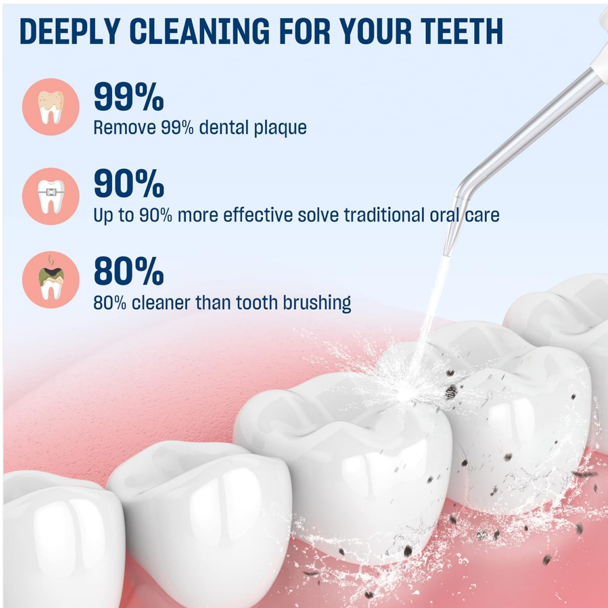
Image: A visual representation of the water flosser's effectiveness in deeply cleaning teeth and removing dental plaque.