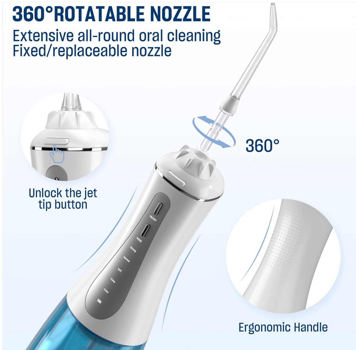
Image: The water flosser illustrating its 360-degree rotatable nozzle, which allows for easy adjustment to reach all areas of the mouth.

Extensive all-round oral cleaning Fixed/replaceable nozzle