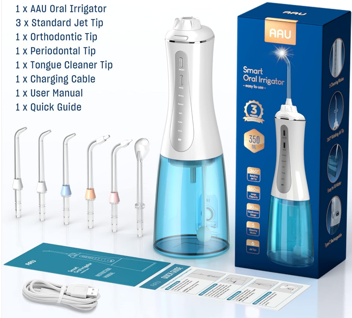
Image: All components included in the AAU AOW03 Cordless Water Dental Flosser package, including the main unit, various tips, charging cable, and documentation.