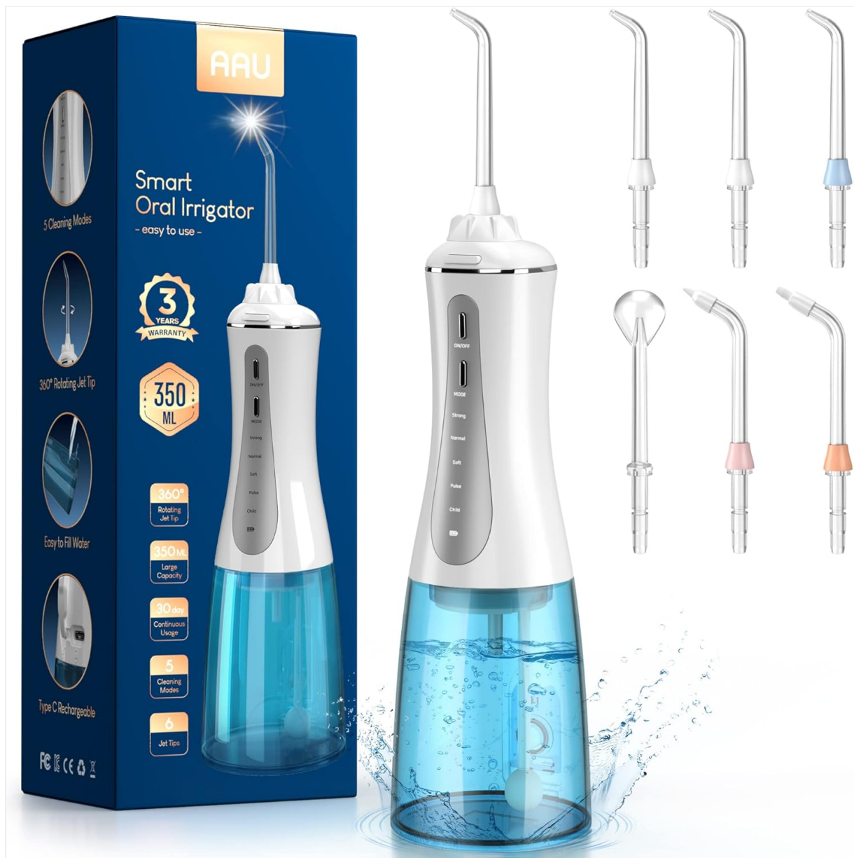
Image: The AAU AOW03 Cordless Water Dental Flosser, its packaging, and the included assortment of jet tips.