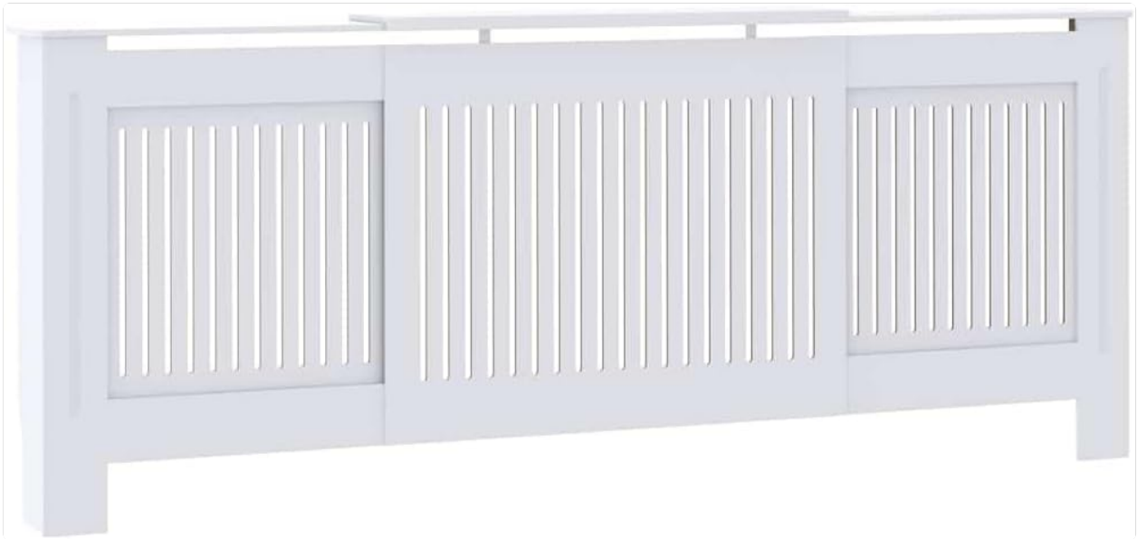
Figure 3.1: Front view of the vidaXL Adjustable Radiator Cover in white, showcasing its slatted design.