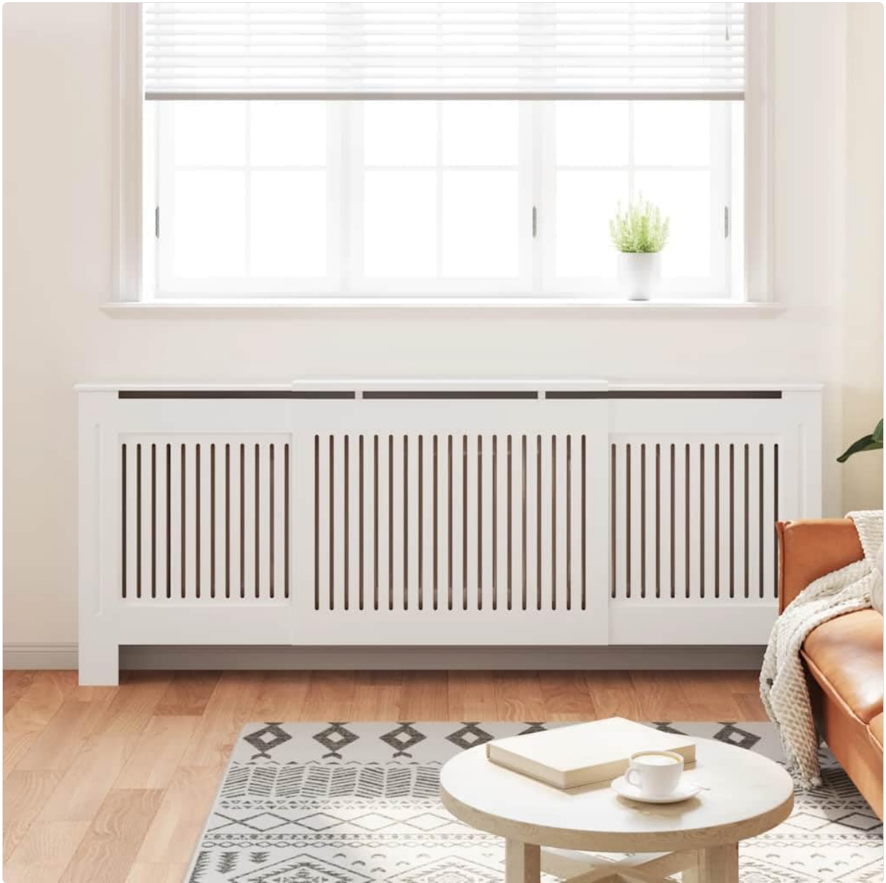
Figure 3.3: A different perspective of the radiator cover in a living room, highlighting its use as a display surface.