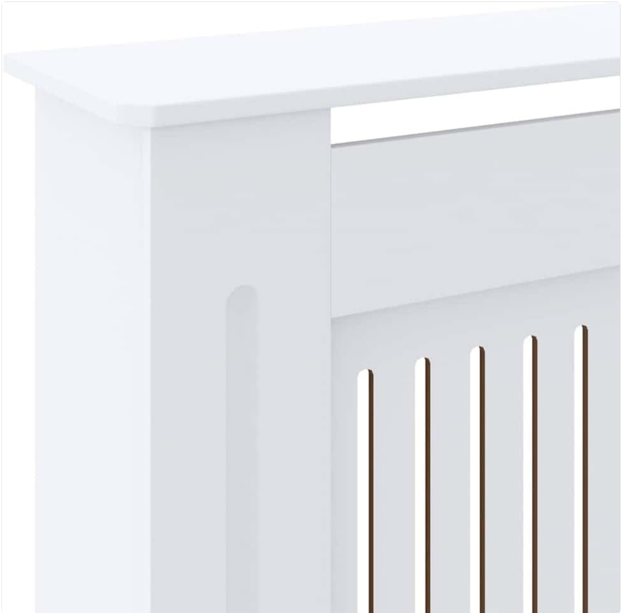
Figure 3.4: Visual representation of how the radiator cover's length can be adjusted to fit various radiator sizes.