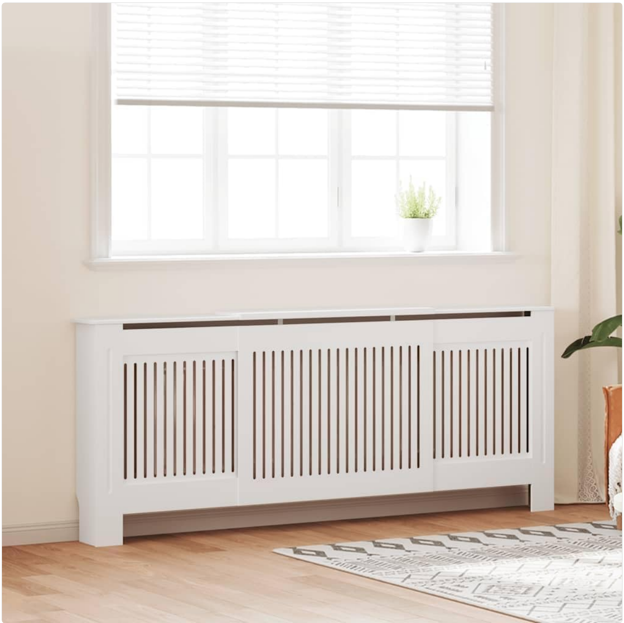
Figure 3.2: The radiator cover integrated into a living room, positioned beneath a window, demonstrating its aesthetic appeal.