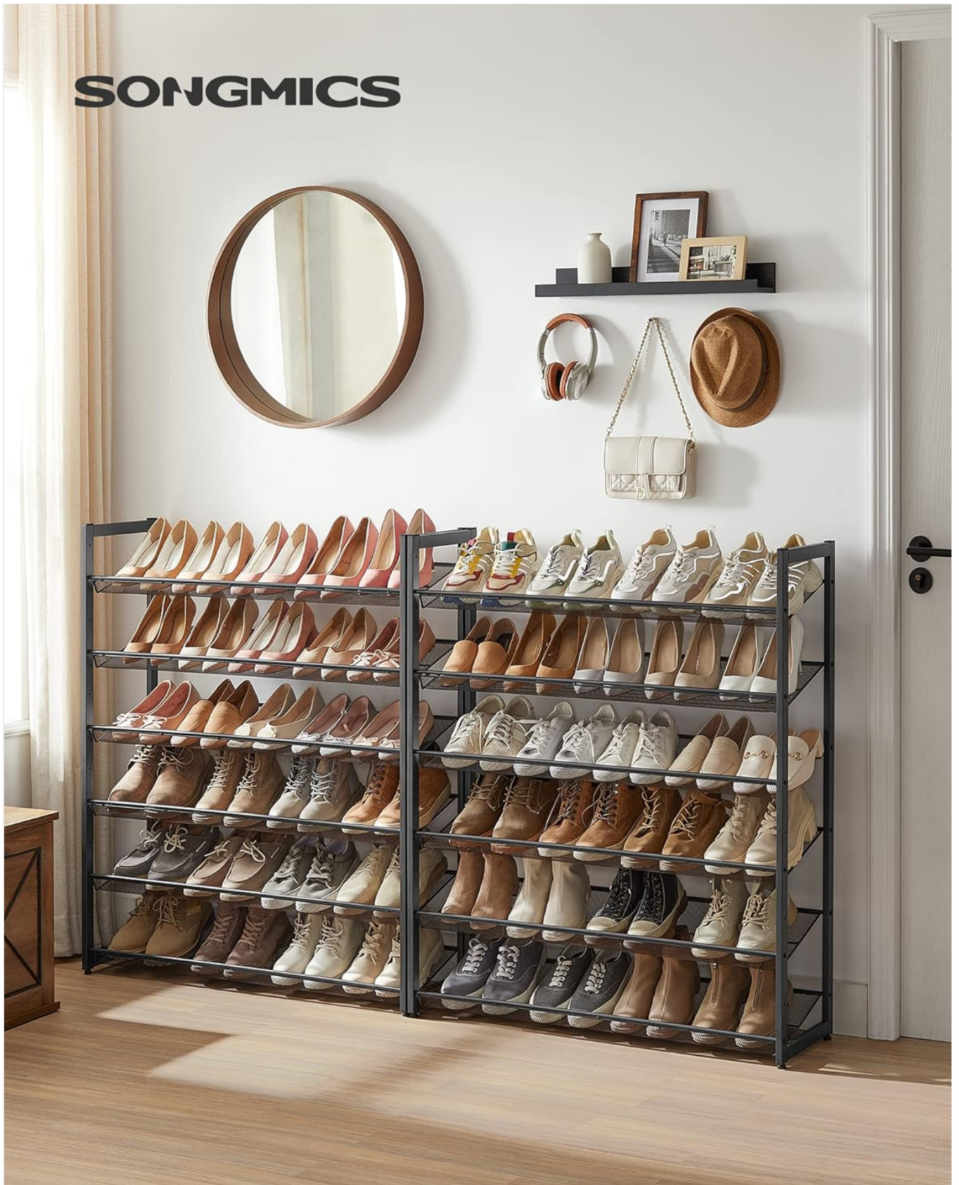
Image: The shoe rack can be configured as a single 12-tier unit or two separate 6-tier units, offering versatile placement options.