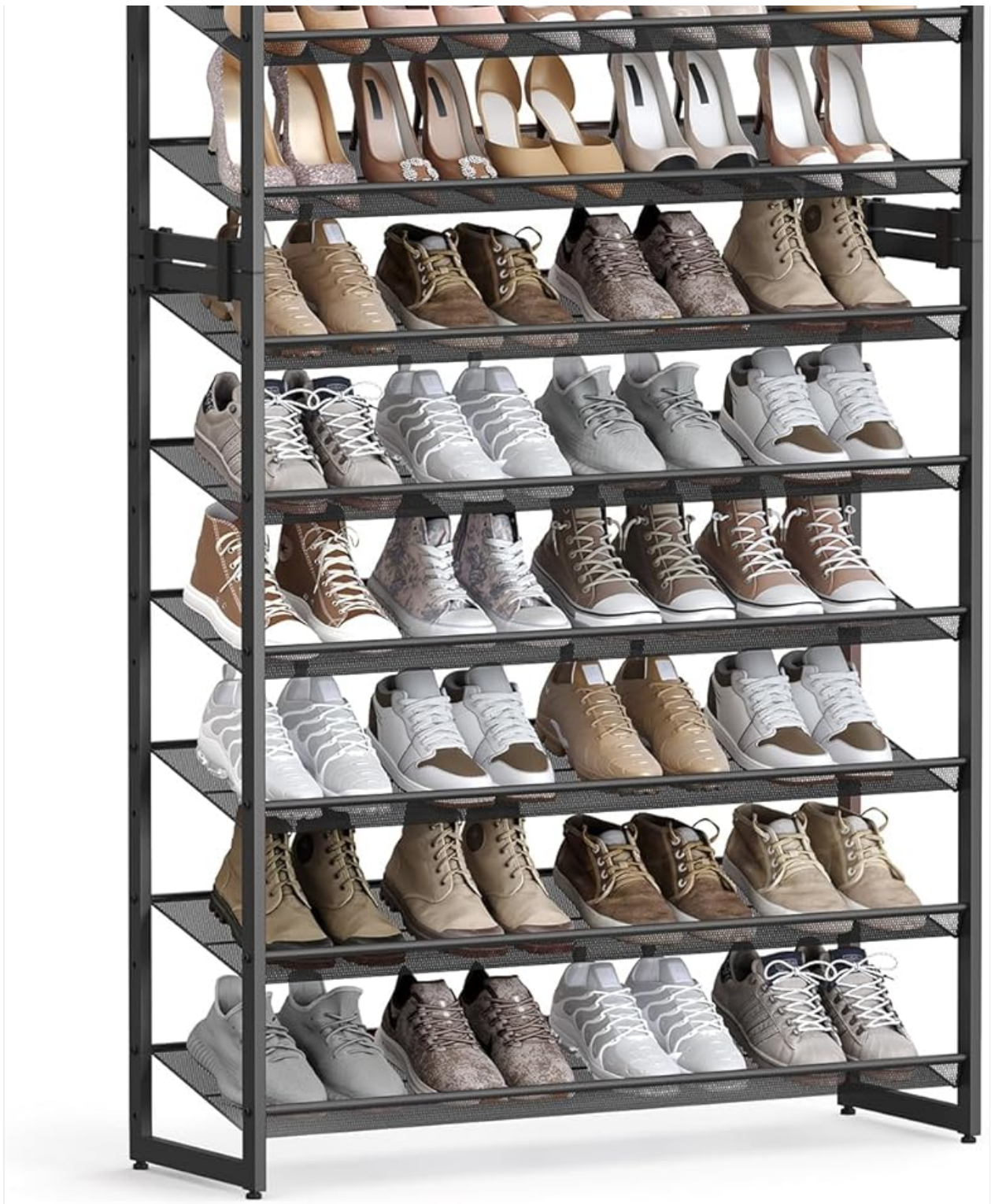
Image: The SONGMICS 12-Tier Shoe Rack, fully assembled and organized with a wide array of shoes, showcasing its large capacity and sleek black metal design.