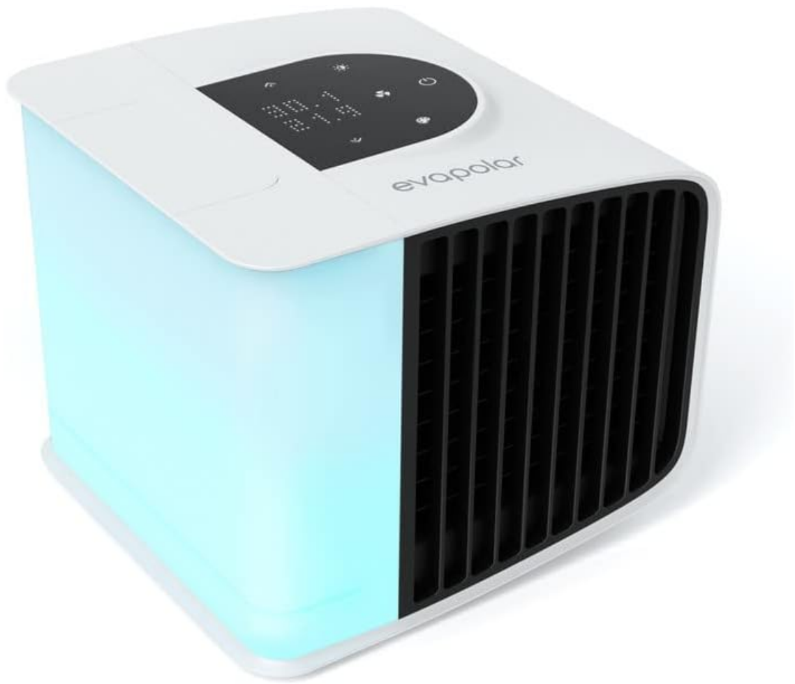
Figure 1: Evapolar evaSMART Personal Air Cooler (White)

This image shows the compact white Evapolar evaSMART unit with its distinctive black grille and a soft blue light emanating from its side, indicating its operational status and aesthetic features.