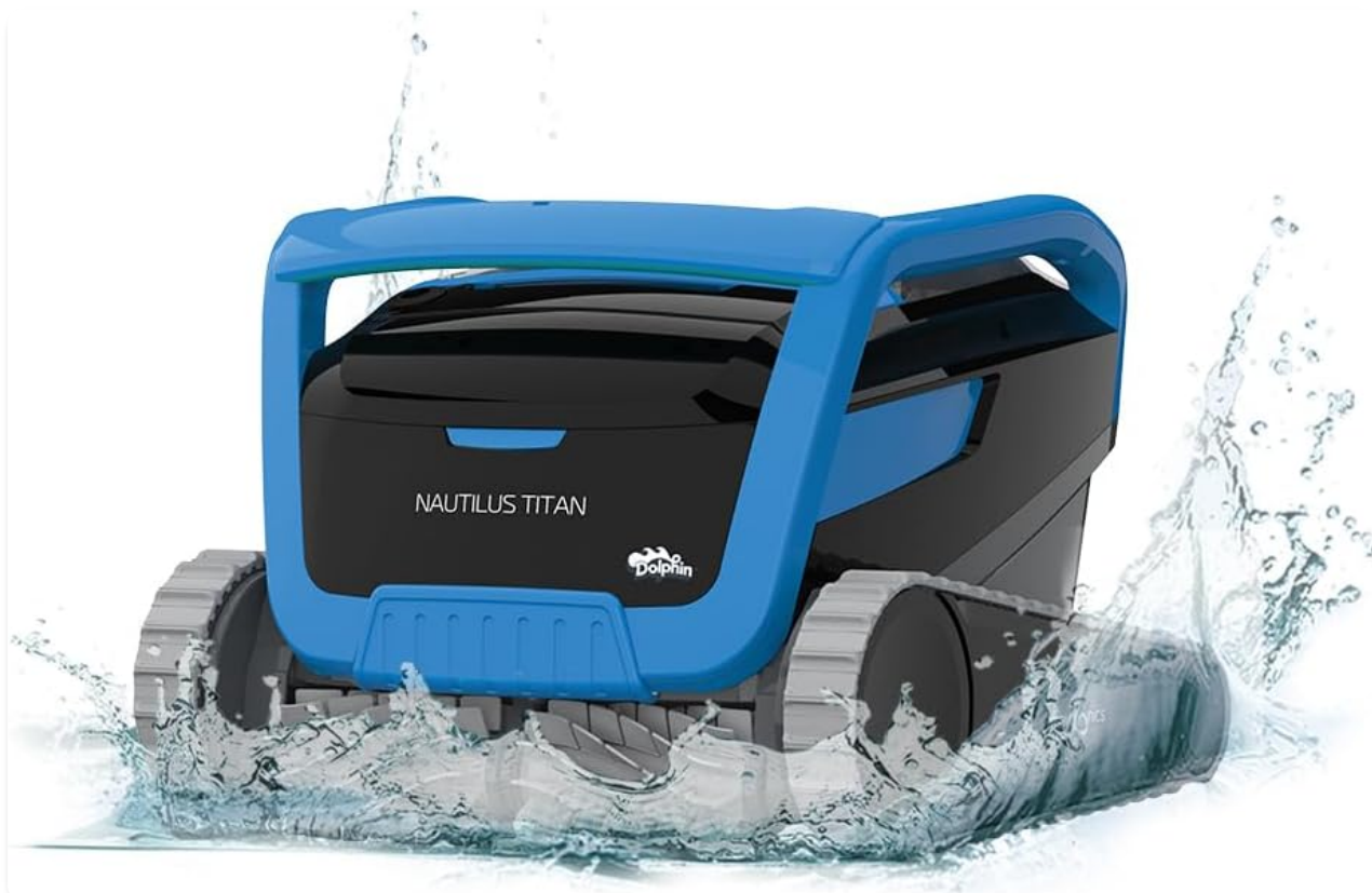
Figure 1: Dolphin Nautilus Titan Robotic Pool Cleaner

The Dolphin Nautilus Titan is an advanced Wi-Fi automatic robotic pool vacuum cleaner designed for inground pools up to 50 feet in length. It features waterline scrubbing, multi-layer filtration, and app-controlled convenience to ensure a pristine pool with minimal effort. This manual provides essential information for the setup, operation, and maintenance of your robotic pool cleaner.