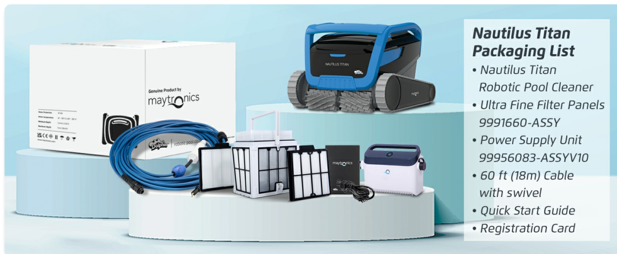
Figure 2: Contents of the Nautilus Titan package