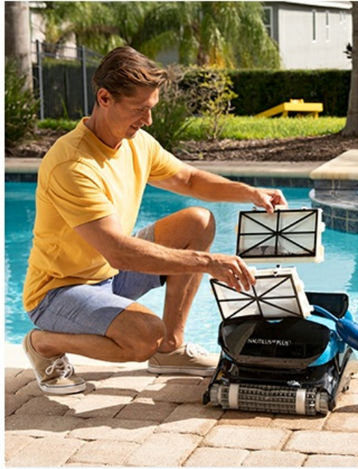
Figure 7: Easy-access top-load filter for simple cleaning