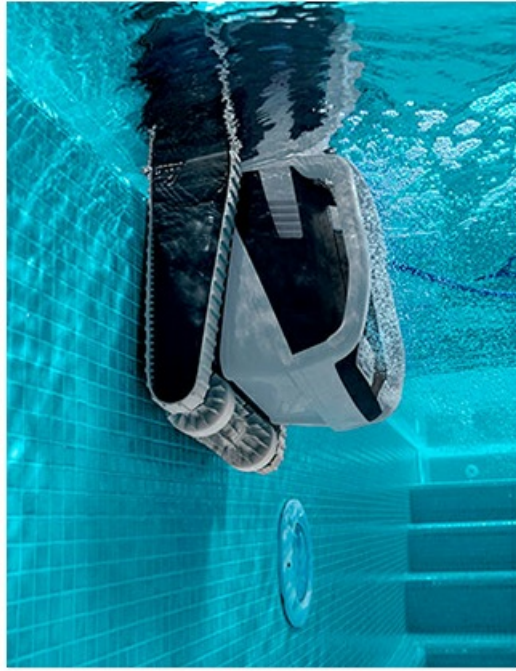
Figure 4: Nautilus Titan demonstrating wall climbing capability