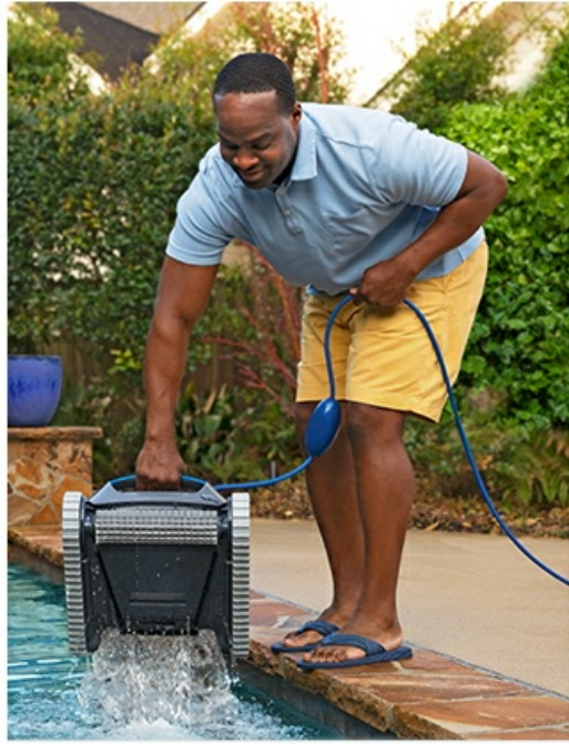
Figure 6: Easy removal with Pick-Up Mode