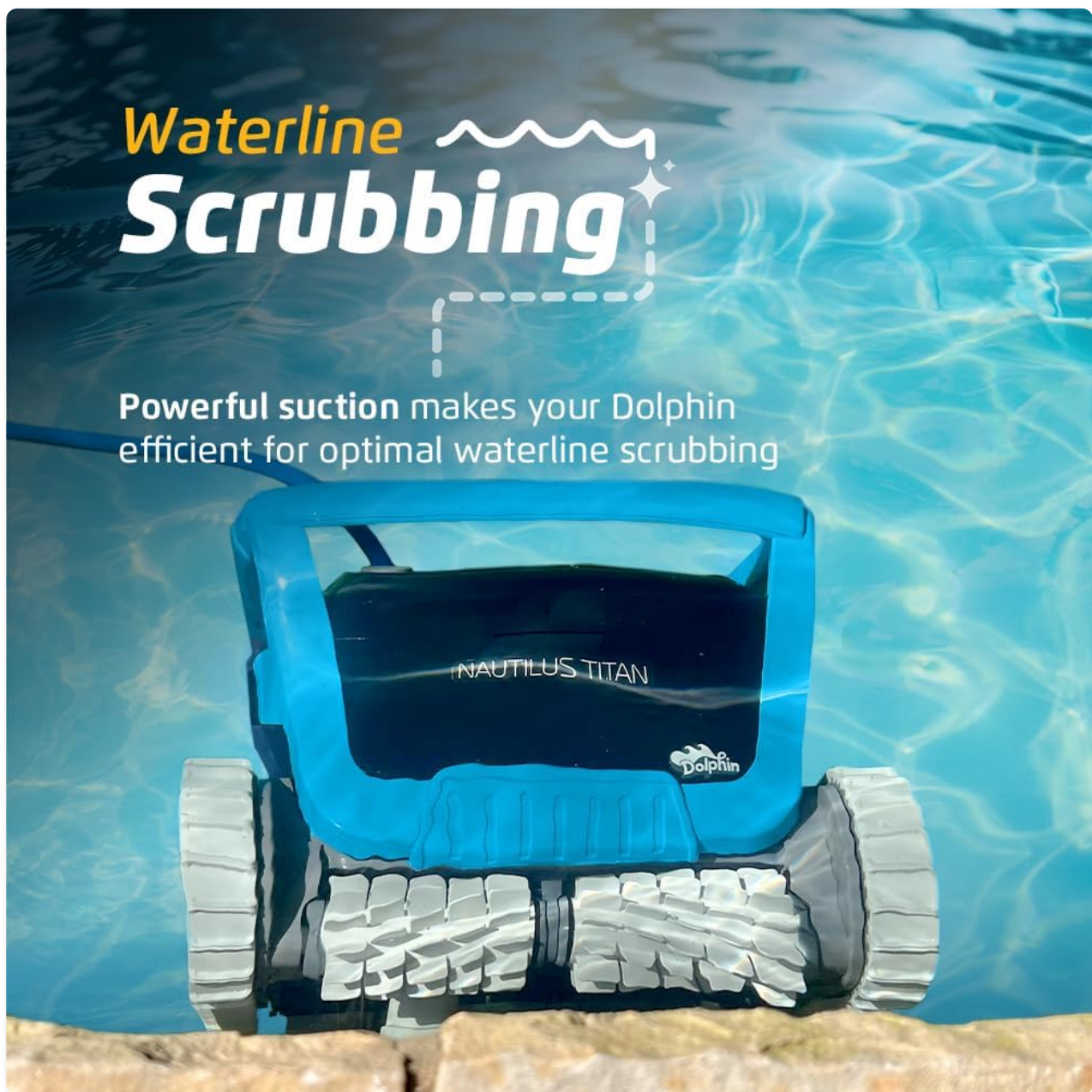
Figure 5: Nautilus Titan performing waterline scrubbing