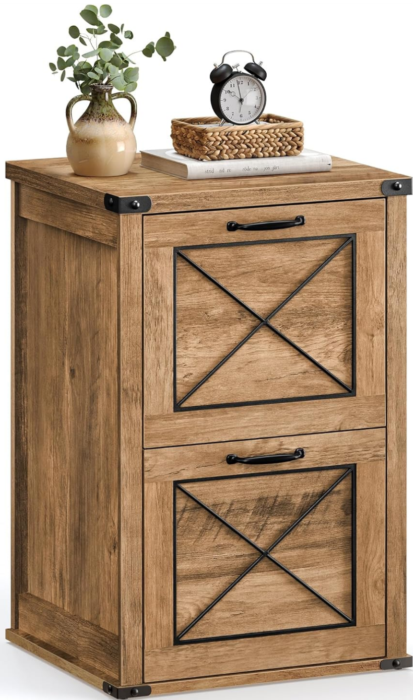
Image: VASAGLE File Cabinet UOFC048T41, a honey brown 2-drawer file cabinet with barn door style fronts and black metal accents, suitable for home office environments.