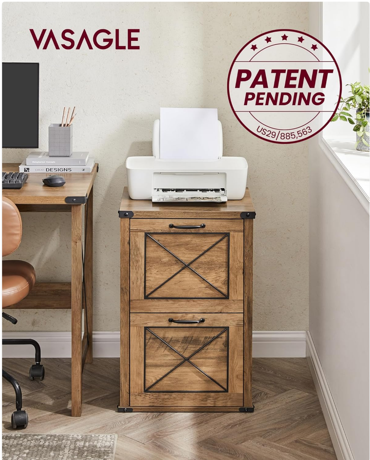
Image: The file cabinet functioning as a printer stand in an office environment.

The sturdy top surface of the cabinet can support a printer or other office equipment, provided the total weight does not exceed the specified load capacity.