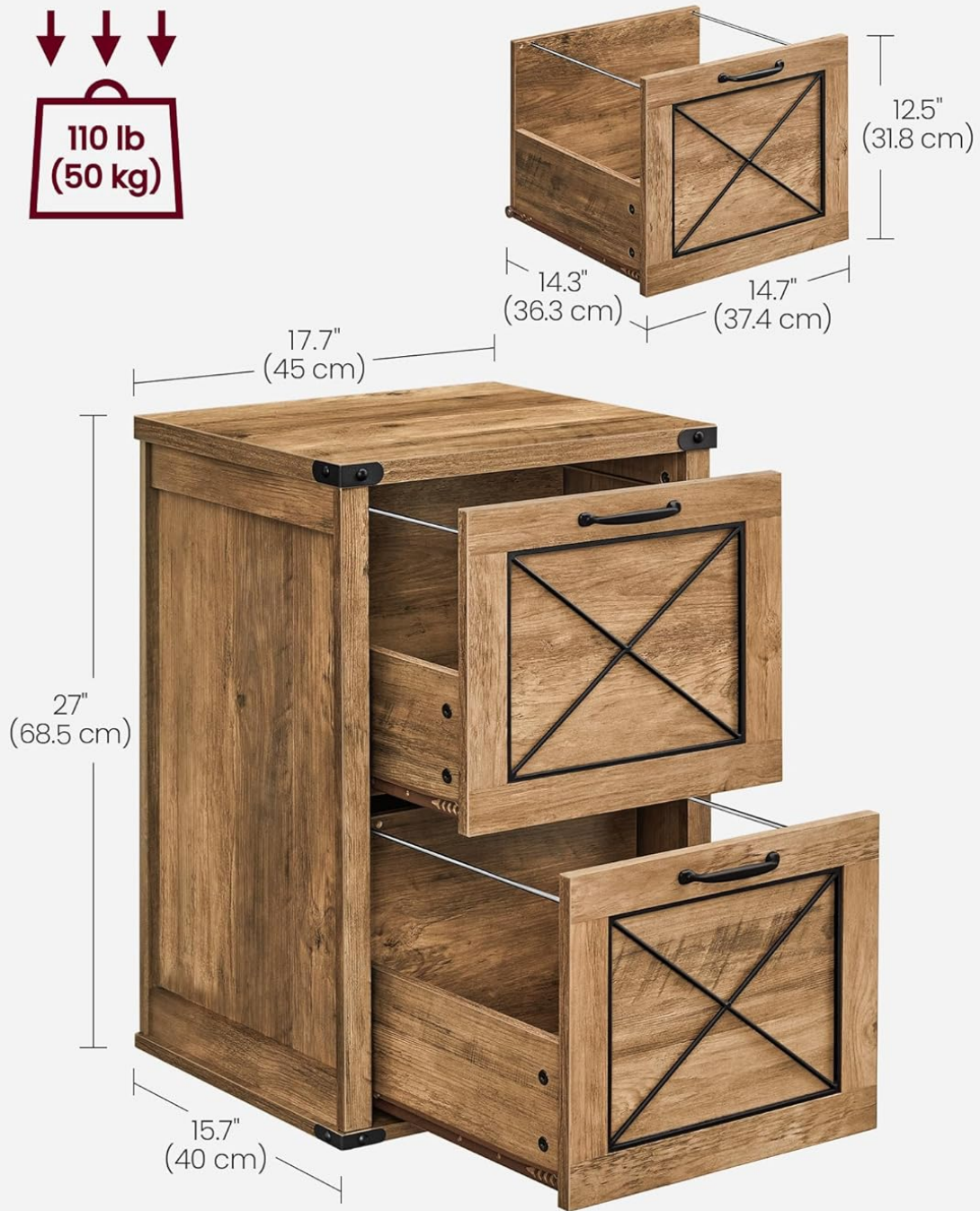
Image: Dimensional diagram of the file cabinet, illustrating its overall size and the internal dimensions of the drawers, along with the maximum weight capacity.