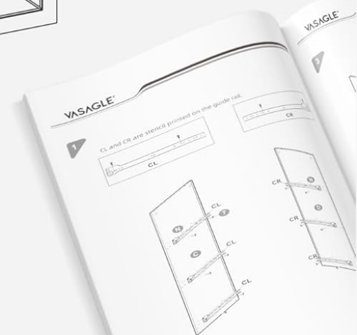
Image: Exploded diagram of the cabinet components with labels, alongside a depiction of the instruction manual, highlighting the ease of assembly with labeled parts and clear instructions.