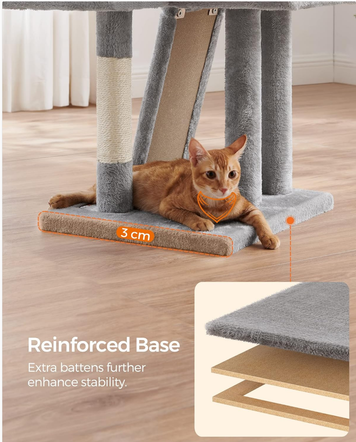
Figure 7: Product Dimensions. Detailed measurements of the cat tree, including height, width, and depth of various platforms and components.