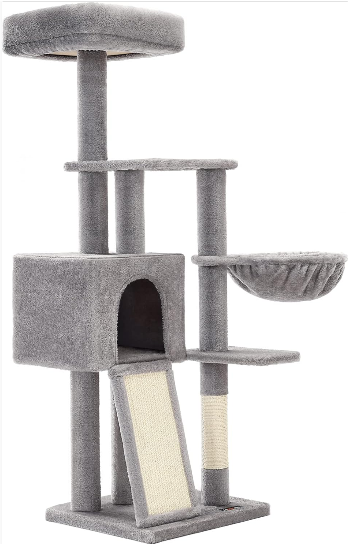
Figure 0: FEANDREA Cat Tree Model PCT132W01. This image provides an overall view of the cat tree, highlighting its multi-level design and various features.

This manual provides detailed instructions for the assembly, operation, and maintenance of your