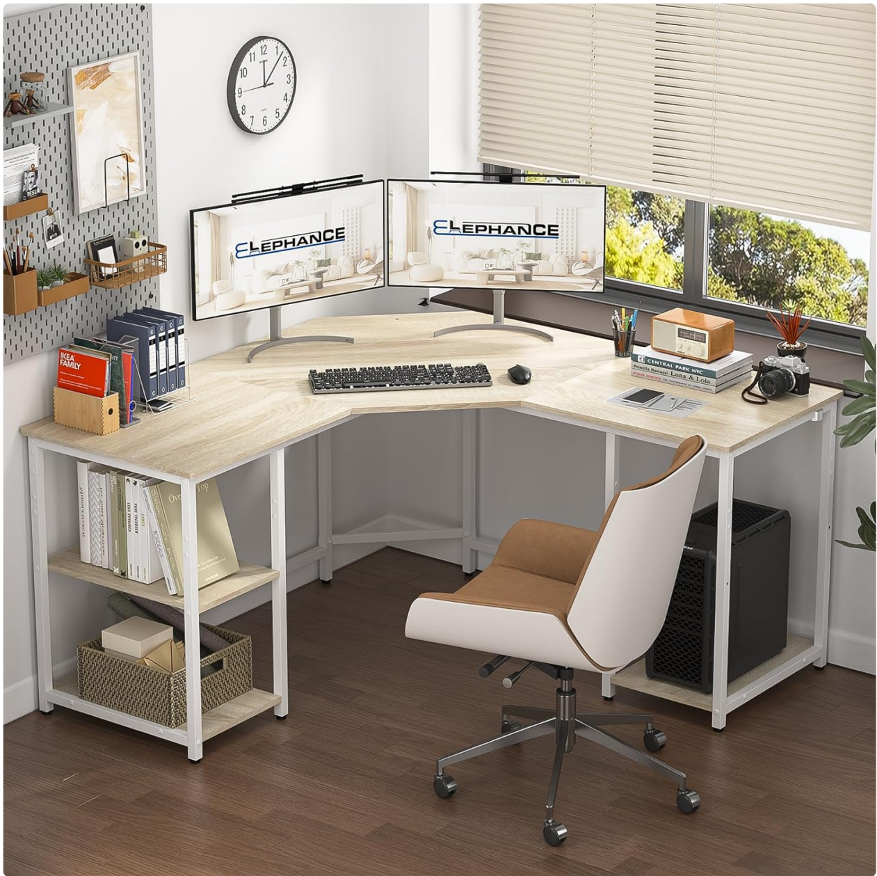
Image: The L-shaped desk configured in an office environment, demonstrating its capacity for a computer setup and various work materials.