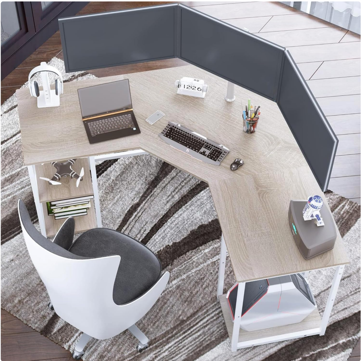
Image: The L-shaped desk featuring a monitor mount, illustrating how the pre-drilled hole facilitates a clean and organized setup.