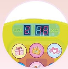
Score & level display