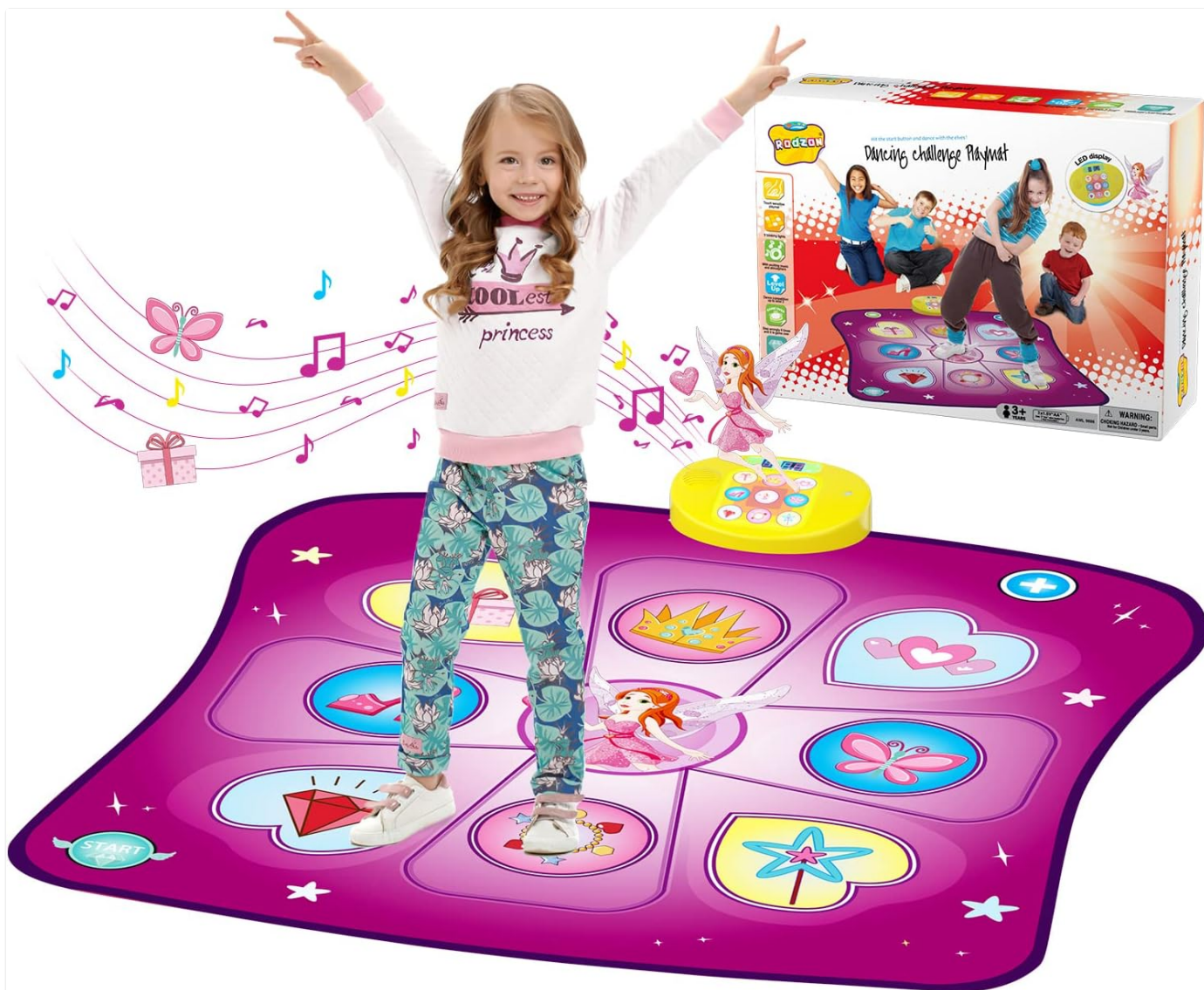
Image: The Rodzon Interactive Dance Mat in use, showing a child dancing on the purple mat with musical notes and fairy motifs. The product box is visible in the background.