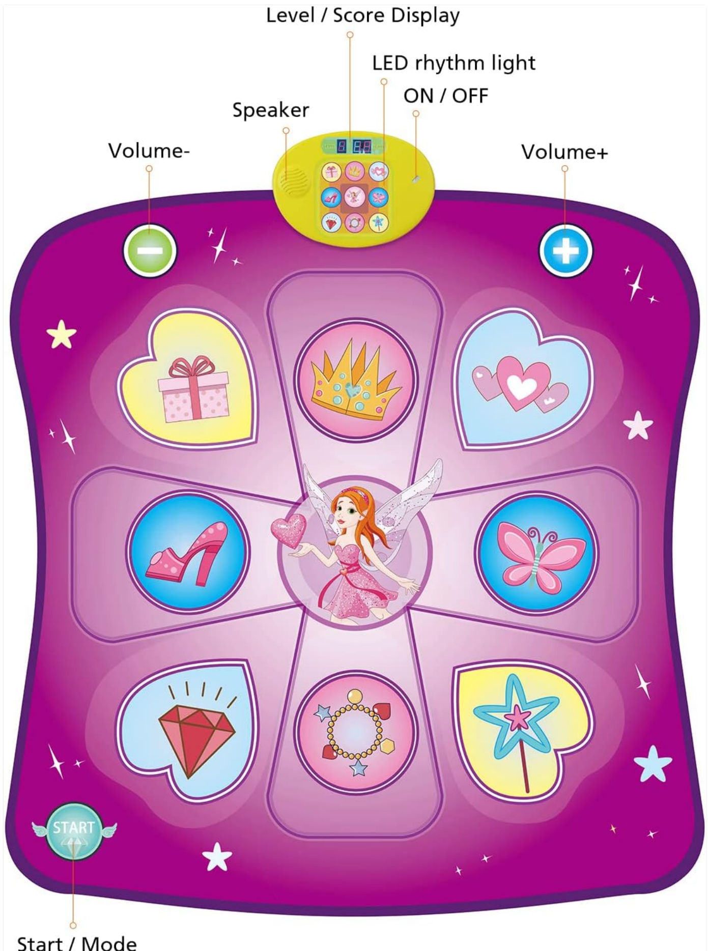
Image: Detailed diagram of the dance mat's control panel, indicating the location of the speaker, LED rhythm light, ON/OFF switch, volume controls, level/score display, and the Start/Mode button.