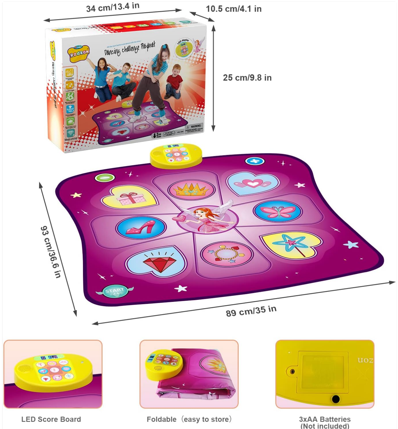
Image: Diagram showing the physical dimensions of the Rodzon Dance Mat and its packaging.