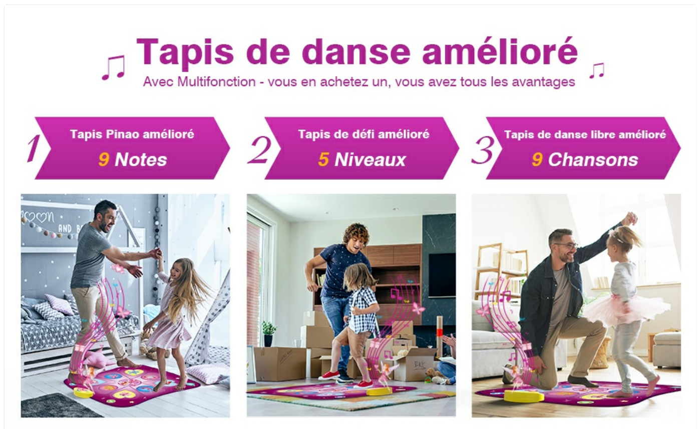
Image: Visual representation of the three interactive game modes available on the Rodzon Dance Mat, detailing how each mode functions.

Press the START button to access this mode. It features nine built-in songs. Children can dance freely to the rhythm of the music.