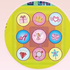
9 Demos & 9 Built-in Music