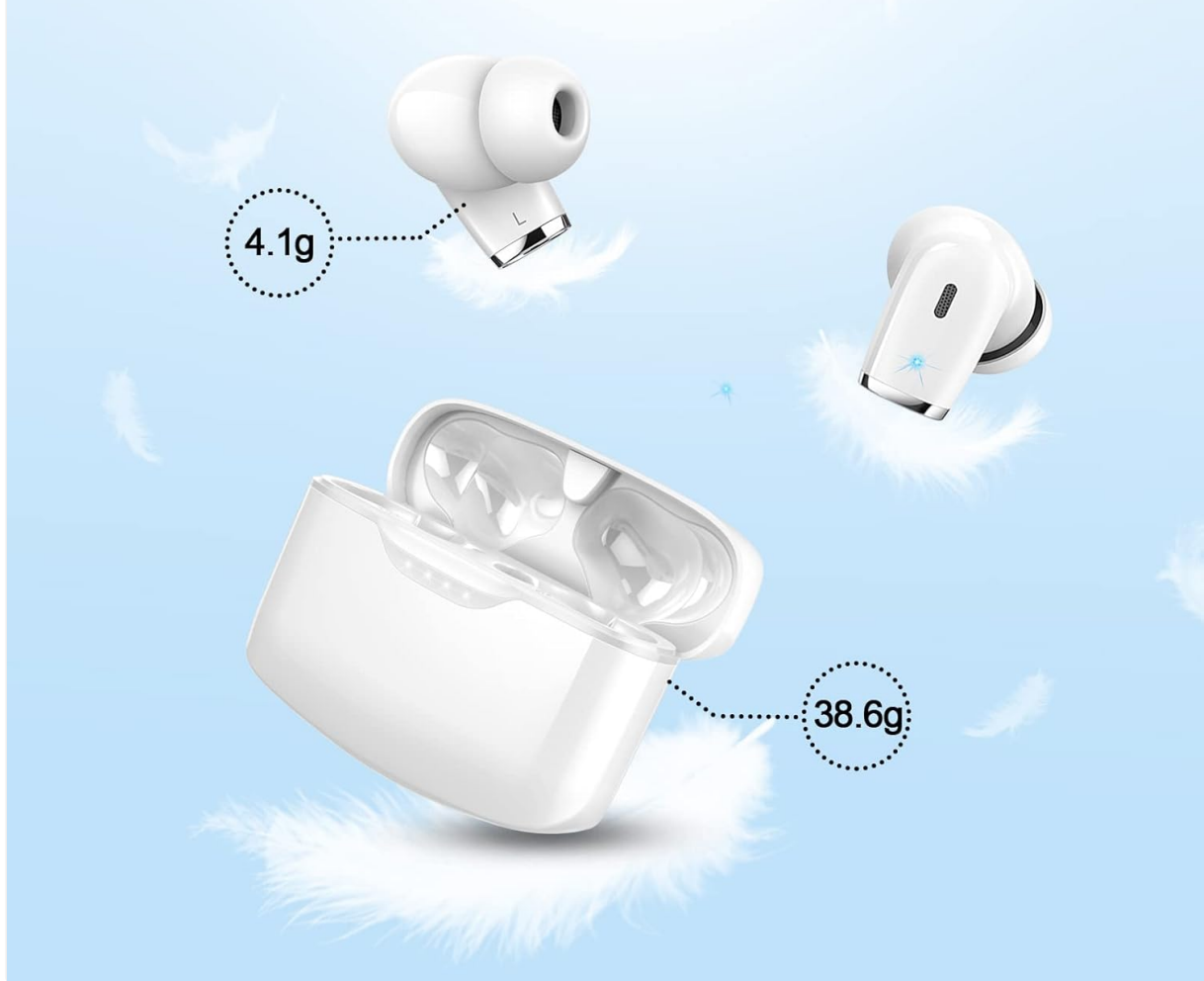
Figure 3.2: Super Lightweight Design. This image illustrates the individual earbud weighing 4.1g and the charging case weighing 38.6g, emphasizing their minimal weight for comfortable wear and portability.