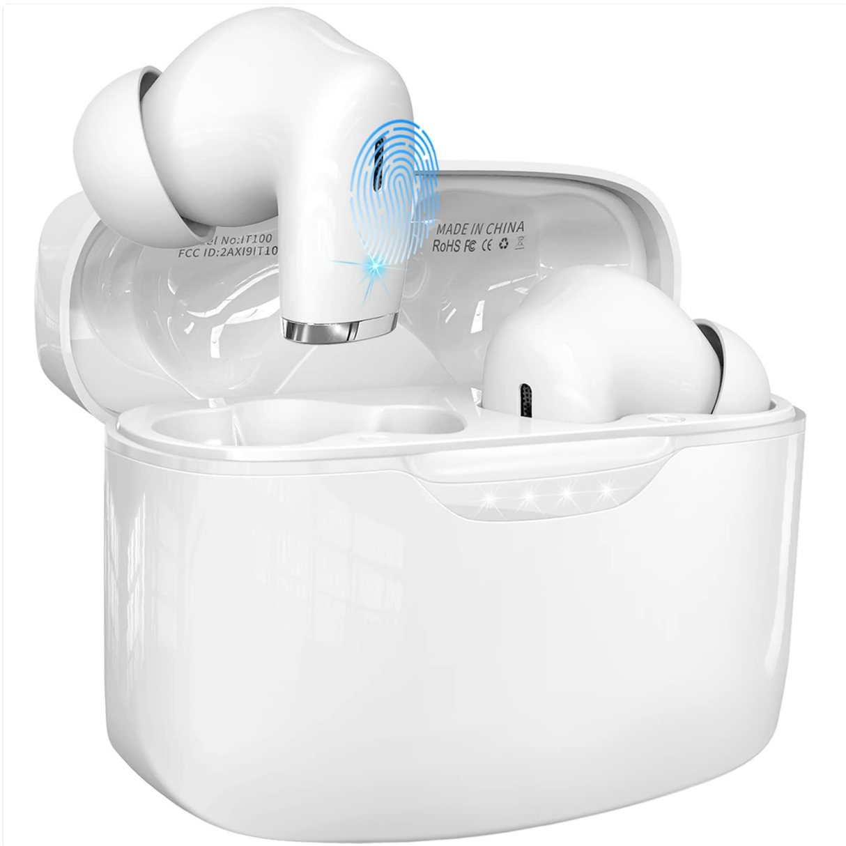
Figure 4.2: Bluetooth 5.2 Technology. This diagram illustrates the advanced Bluetooth 5.2 chip within the earbud, highlighting its stable connection, low latency, and efficient power consumption.