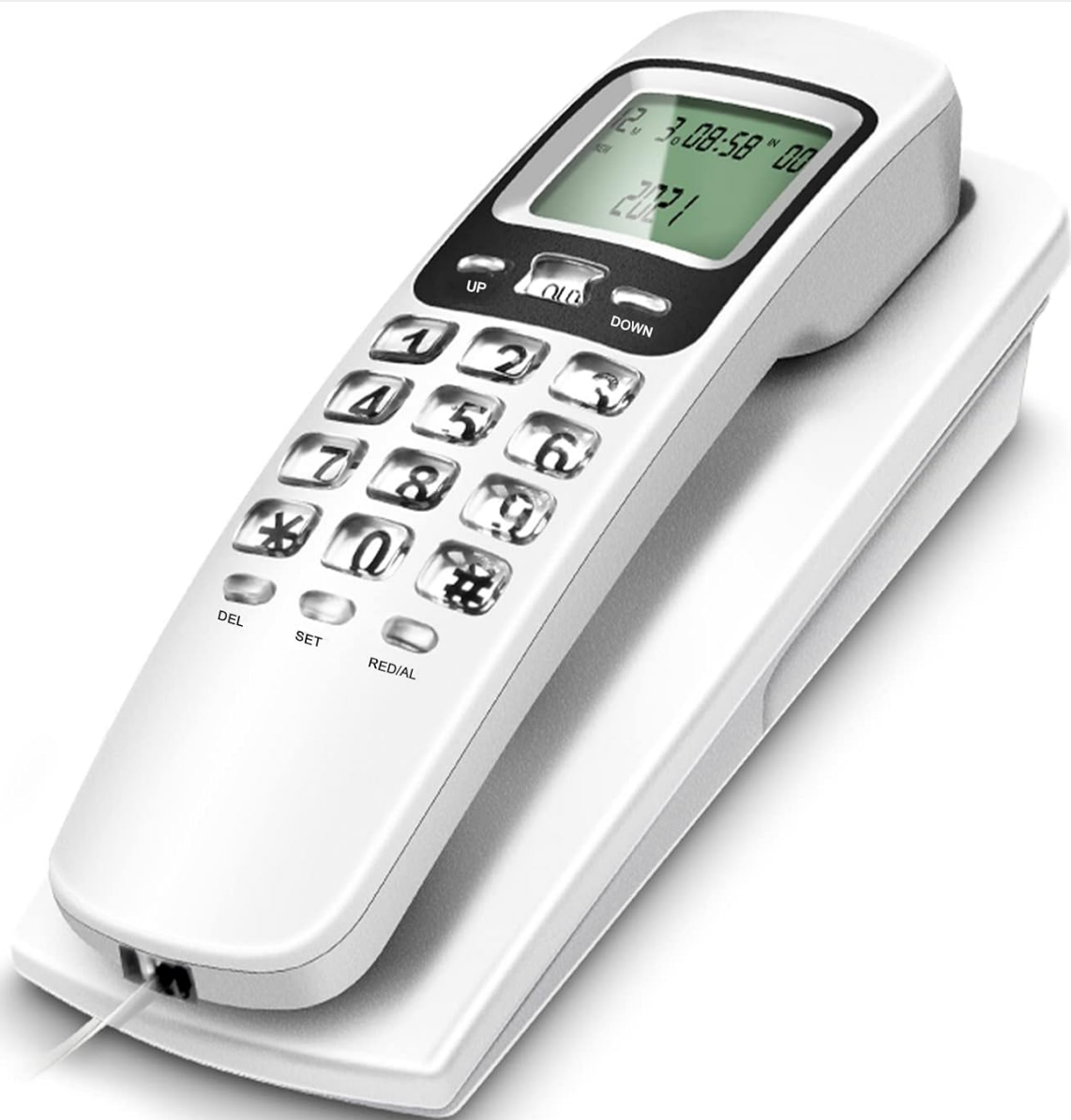
The Sanpyl KX-T777CID landline telephone in white, showcasing its compact design and LCD display.