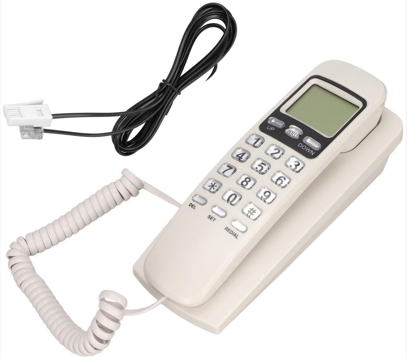
The Sanpyl KX-T777CID telephone is displayed with both its coiled cord connecting the handset to the base and the straight line cord for connecting to the wall jack, showing all included cables.