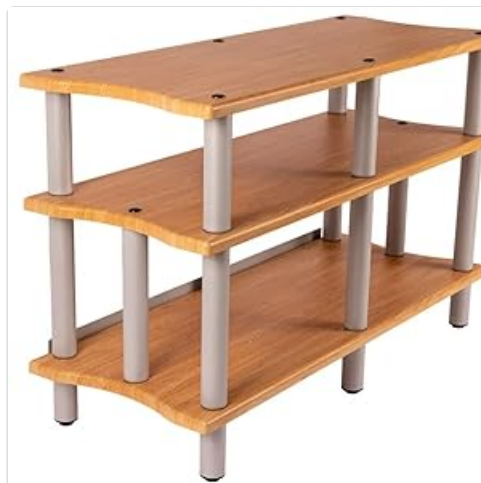
Figure 4: Illustration of the open-air design promoting airflow for component cooling.