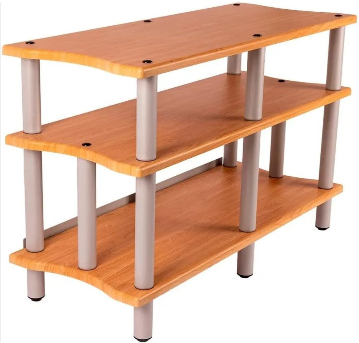
Figure 1: Overall view of the Monolith Heavy Duty Double-Wide 3-Tier AV Stand in Maple finish.