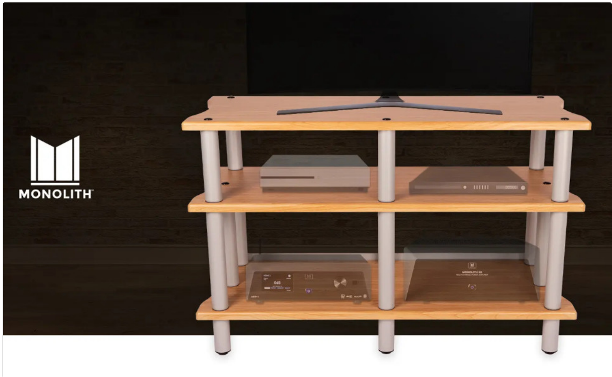
Figure 3: The AV stand in a typical setup, showcasing its capacity for multiple components.