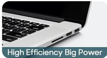
High Efficiency Big Power