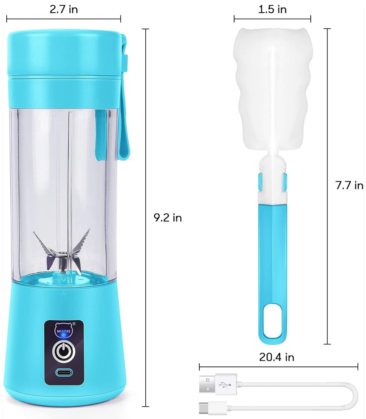
Figure 5: Product dimensions and included USB charging cable.