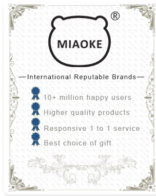
Figure 2: MIAOKE Brand Logo.