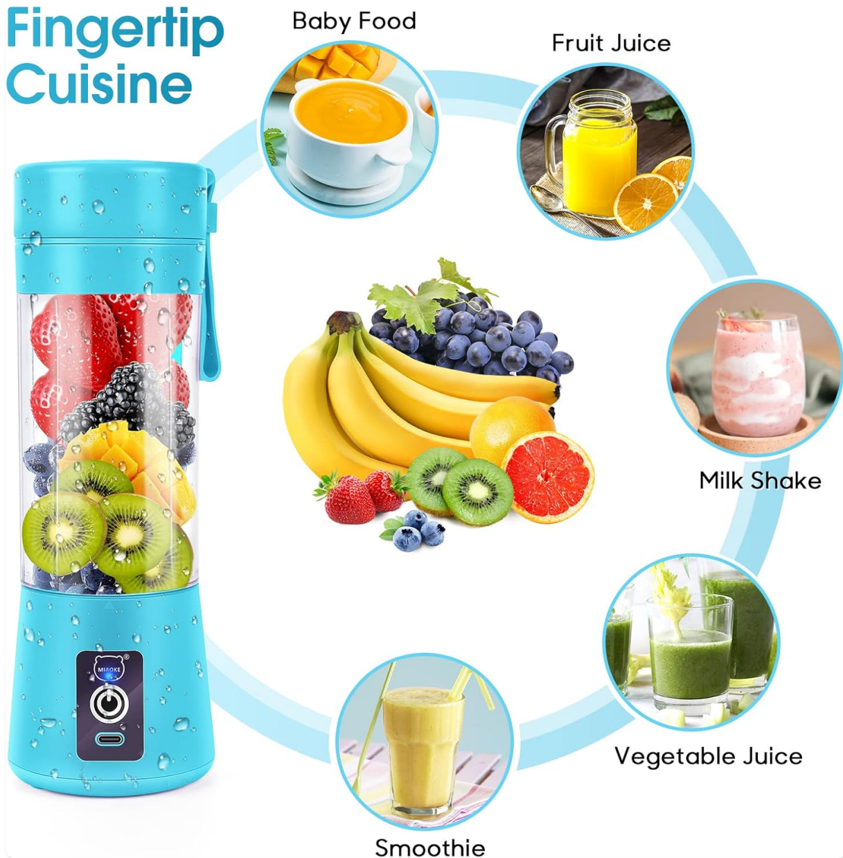
Figure 3: The blender can be used to make various beverages such as baby food, fruit juice, milkshakes, smoothies, and vegetable juice.

Your browser does not support the video tag.