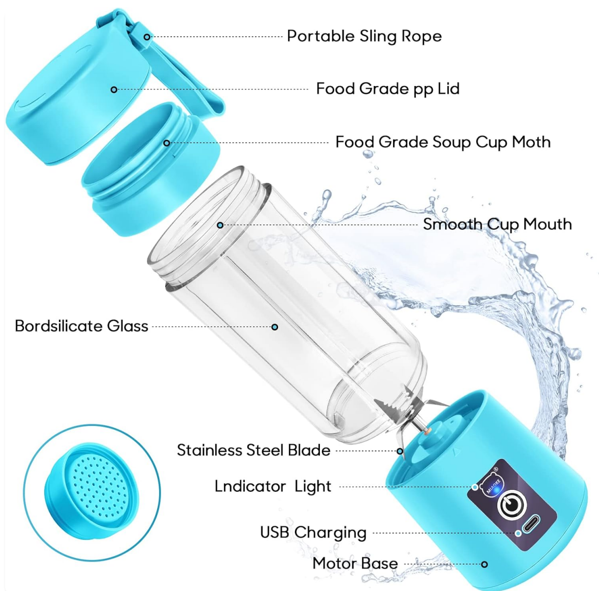
Figure 1: Exploded view of the MIAOKE Portable Smoothie Blender, showing the Portable Sling Rope, Food Grade PP Lid, Smooth Cup Mouth, Borosilicate Glass cup, Stainless Steel Blade, Indicator Light, USB Charging port, and Motor Base.