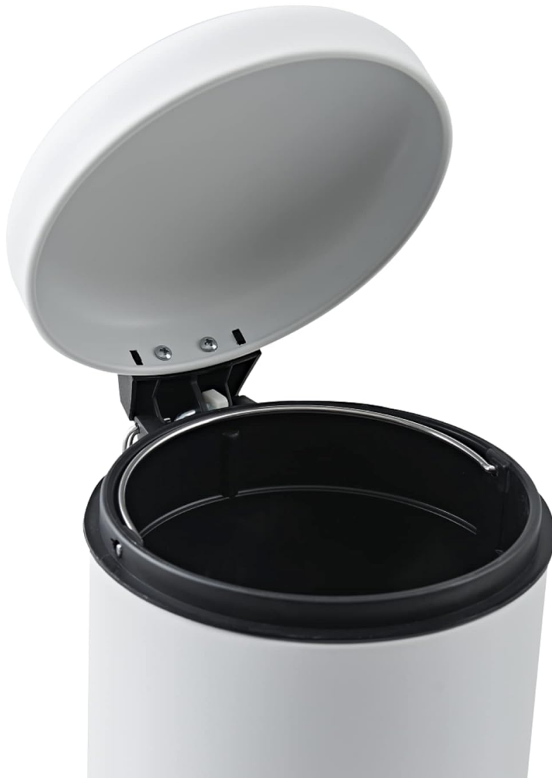
Image 2.2: The bin with its lid open, revealing the internal structure and the soft-close mechanism.