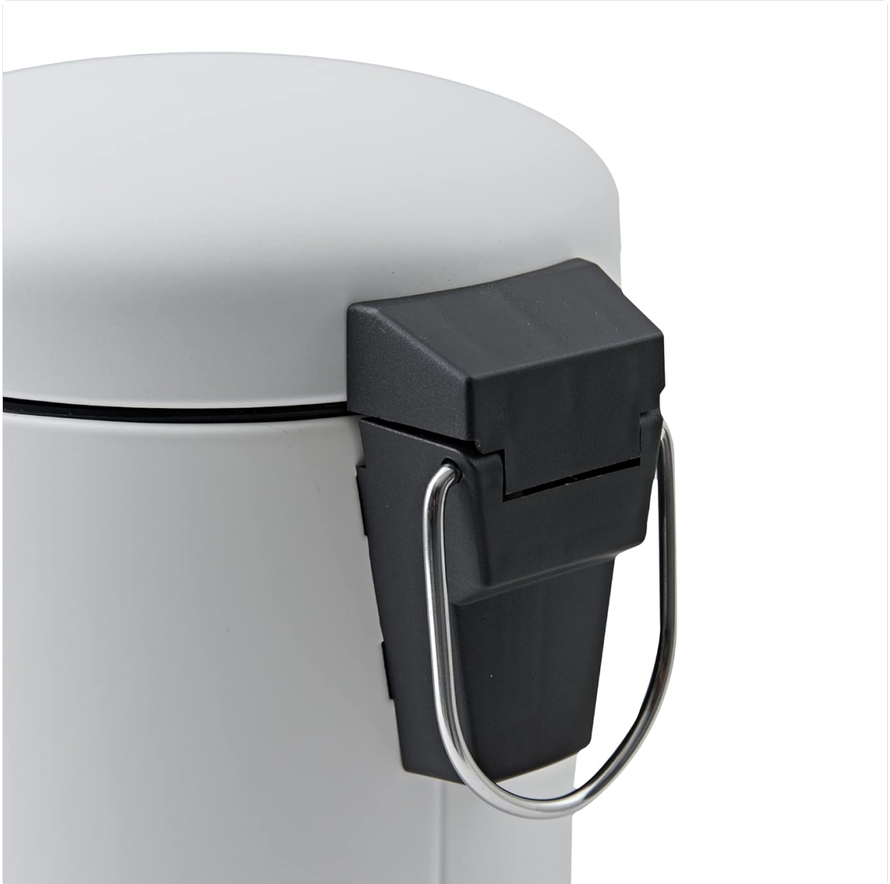
Image 4.1: A close-up view of the integrated handle located at the rear of the bin, designed for convenient transport.