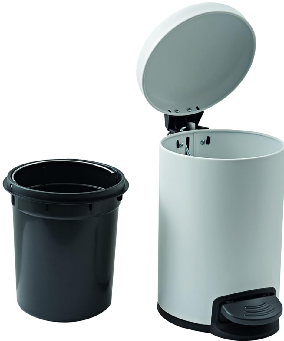
Image 3.1: The outer bin and the removable inner plastic bucket, illustrating how the inner bucket can be taken out for setup or emptying.