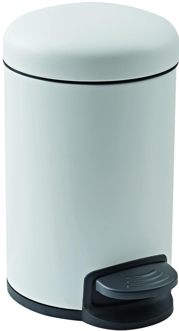
Image 2.1: The SENSEA Easy 3L Round Metal Bathroom Bin in its closed position, showcasing its matte white finish and pedal mechanism.