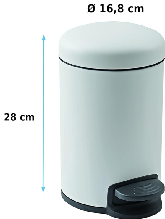
Image 7.1: A diagram illustrating the key dimensions (height, diameter) and capacity of the 3L SENSEA Easy Bathroom Bin.