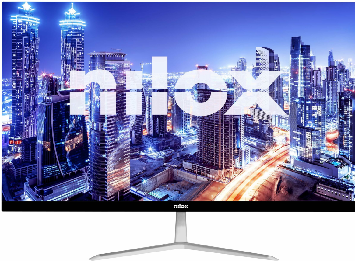
Figure 1: Nilox NXM24FHD01 Monitor - Front View

The image displays the Nilox NXM24FHD01 monitor from the front, showcasing its frameless design and sleek appearance. The Nilox logo is visible at the bottom center of the bezel.