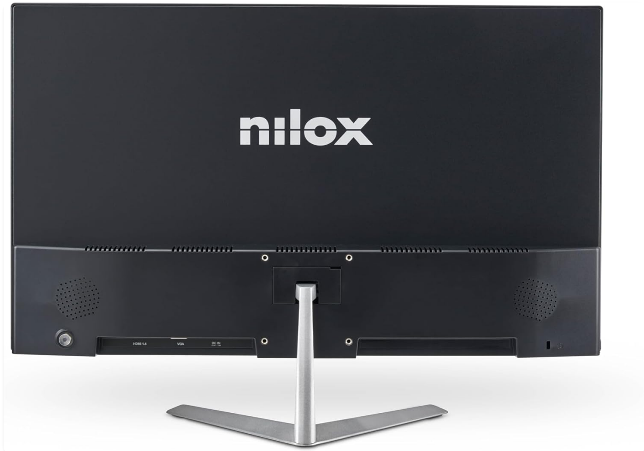
Figure 2: Monitor Rear View with Stand Assembly

This image shows the rear of the Nilox NXM24FHD01 monitor with its stand attached. The stand features a minimalist design with a sturdy base, providing stable support for the display.