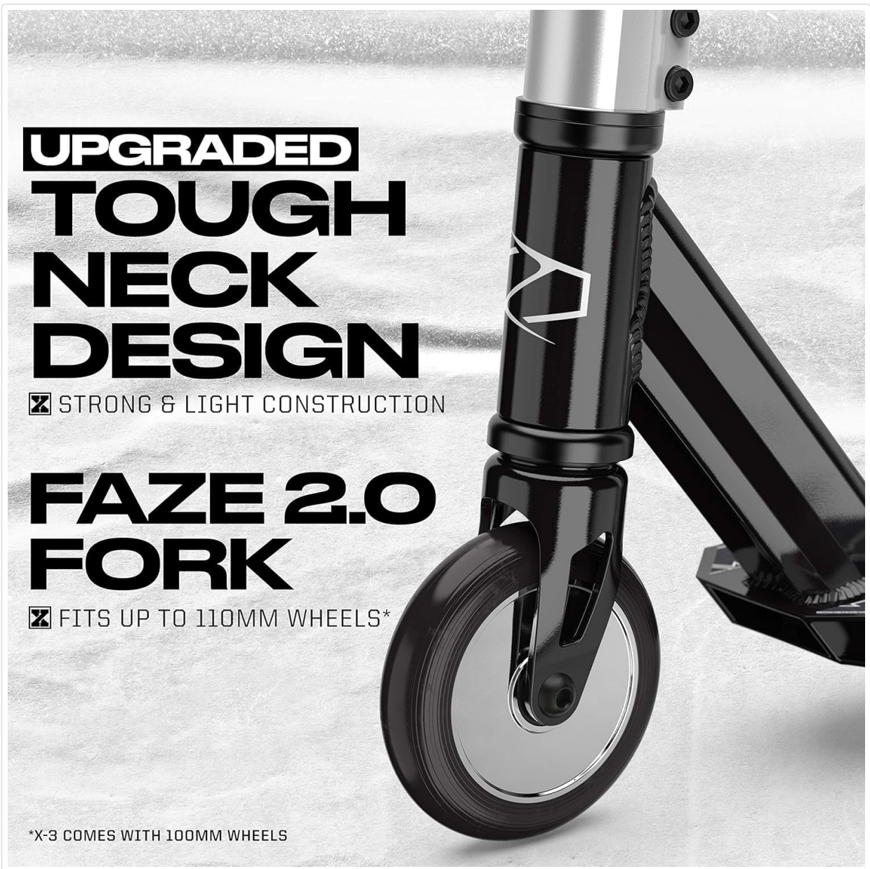
Figure 4: The upgraded neck design and Faze 2.0 fork.