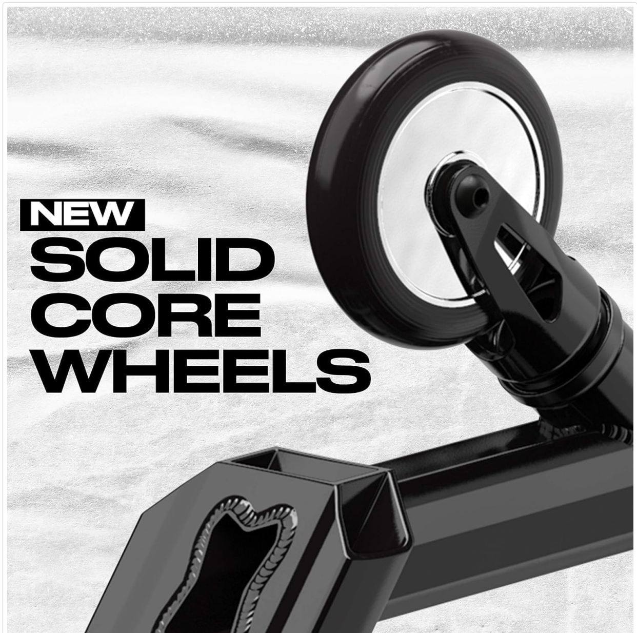
Figure 3: The solid core 100mm wheels are designed for durability.