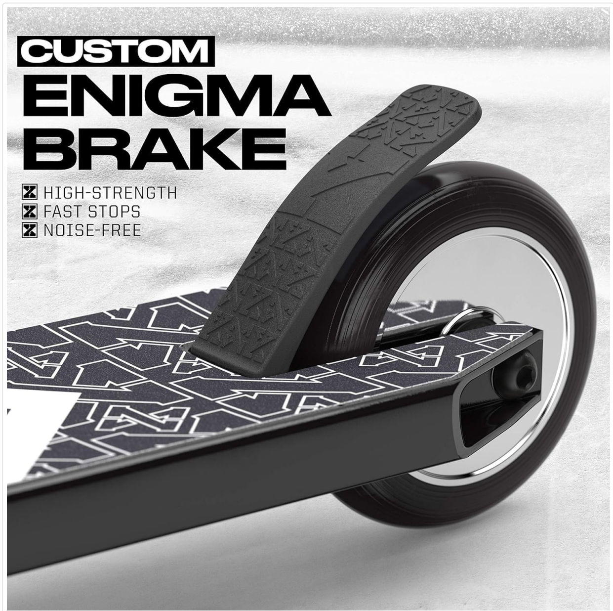
Figure 2: Detail of the custom Enigma brake system.