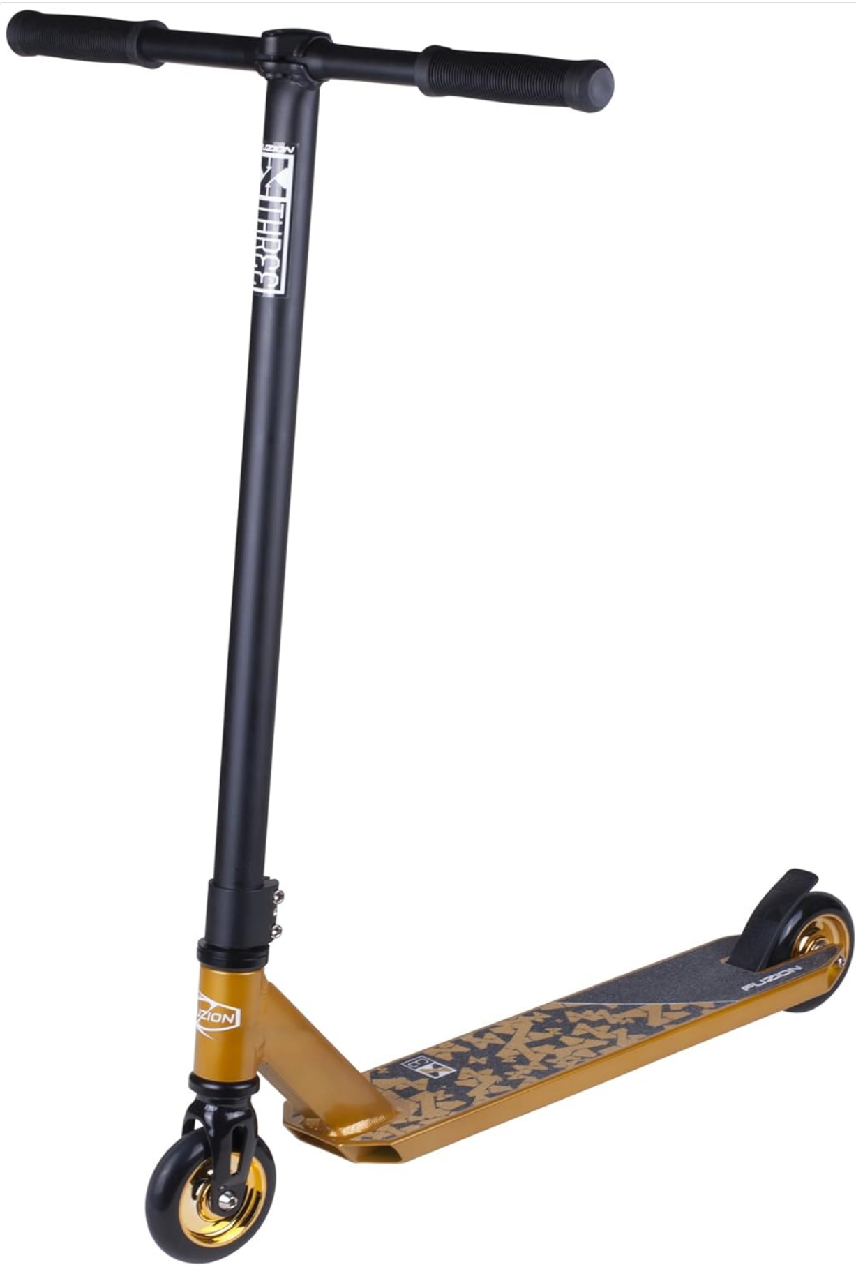
Figure 1: Fully assembled Fuzion X-3 Pro Stunt Scooter.