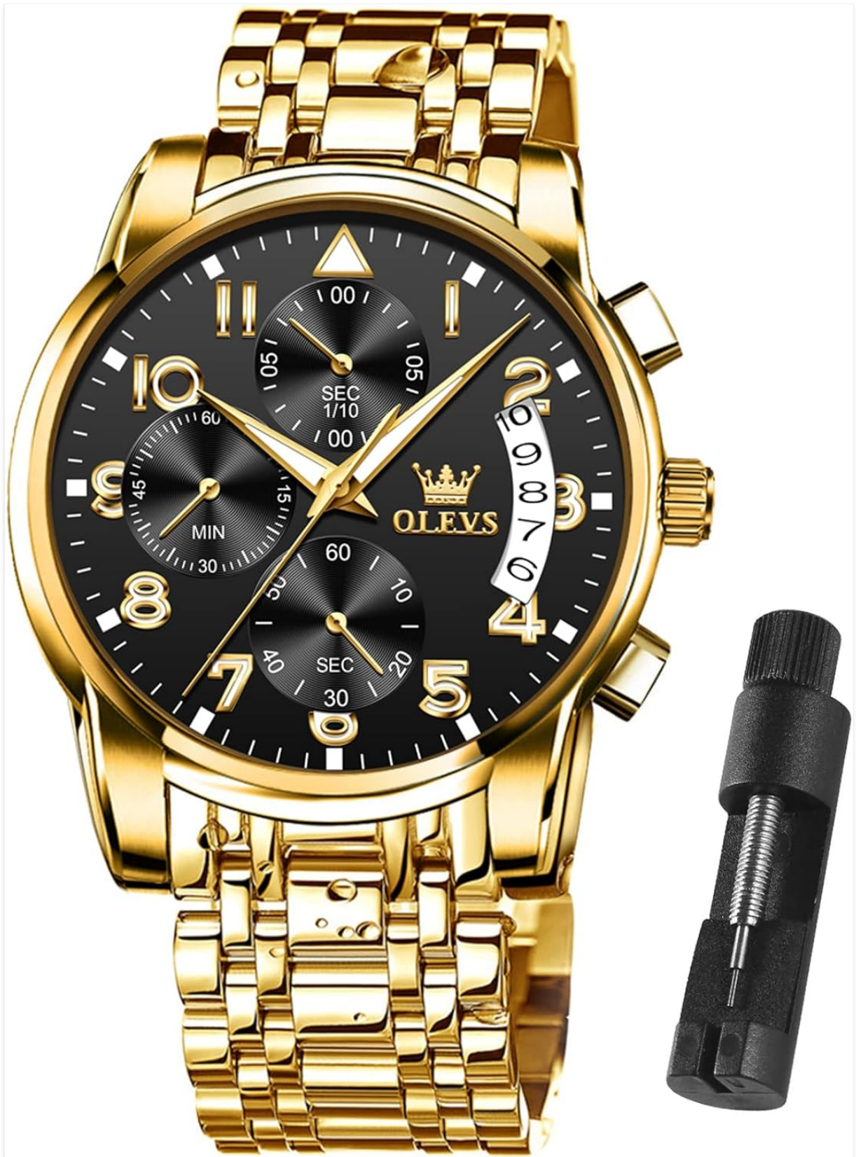
Figure 3: The watch includes a tool for adjusting bracelet links.