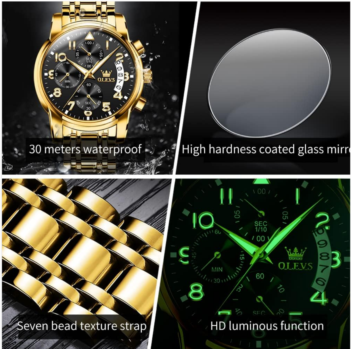
Figure 4: The watch is water resistant up to 30 meters.