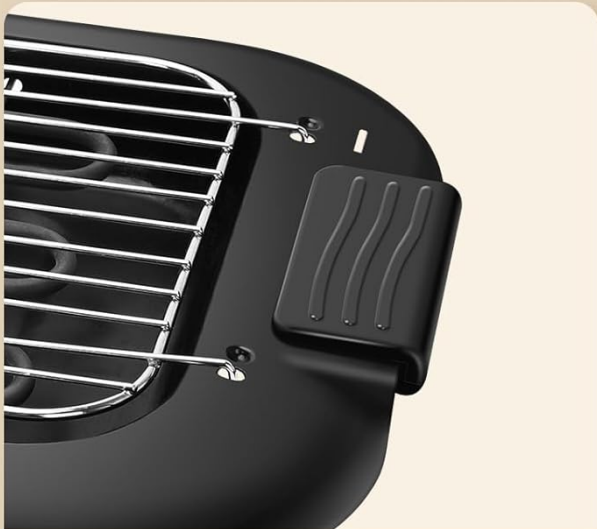
Cool Touch Handles