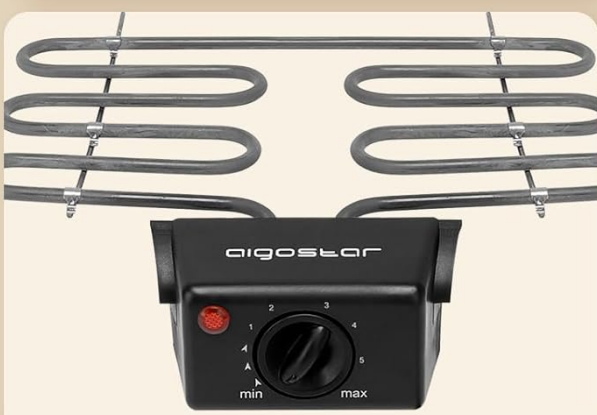
Detachable Heating Element