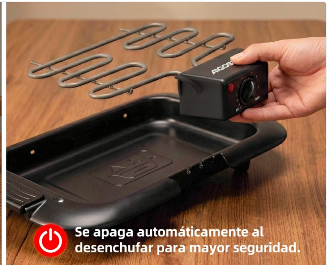
The detachable heating element and automatic shut-off feature for safe cleaning.