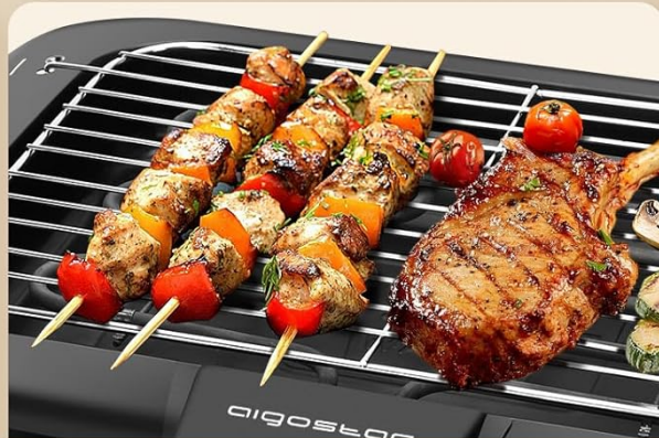
Non-stick grill Grid