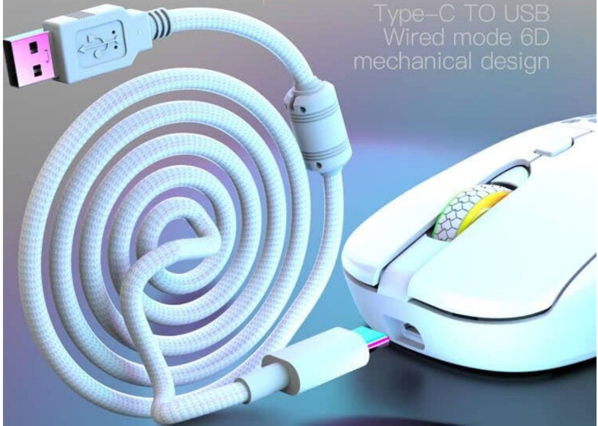
Figure 4: The light, flexible, and durable USB-C paracord cable for wired connection and charging.

Type-C TO USB Wired mode 6D mechanical design