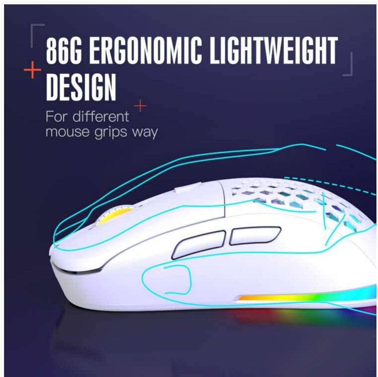
Figure 5: The ergonomic and lightweight design (86g) of the mouse, suitable for various grip styles.