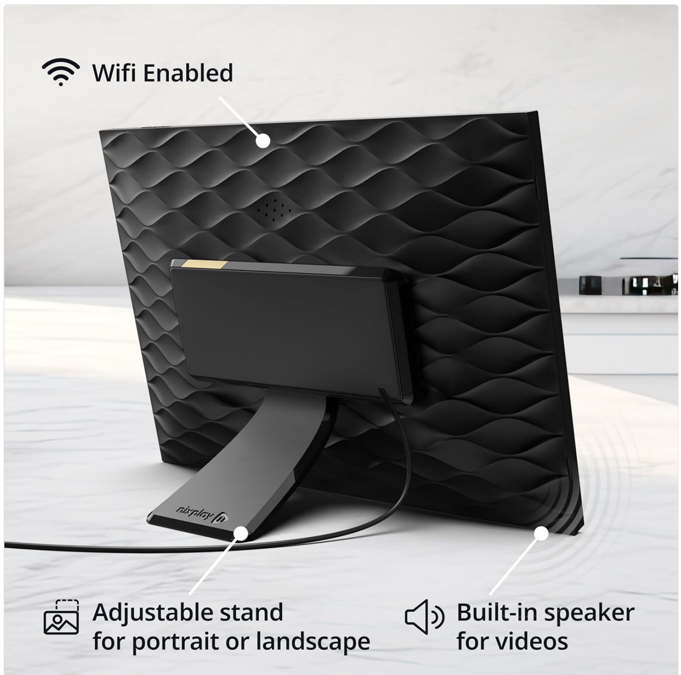
Figure 4.1: Back of the frame with adjustable stand and Wi-Fi indicator.