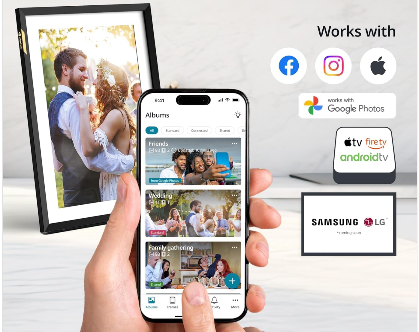
Figure 5.1: Using the Nixplay App to add photos and videos.