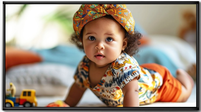
Figure 5.2: AI Face Framing for perfectly centered images.

Enjoy your favorite Nixplay content on your smart TV with NixCast