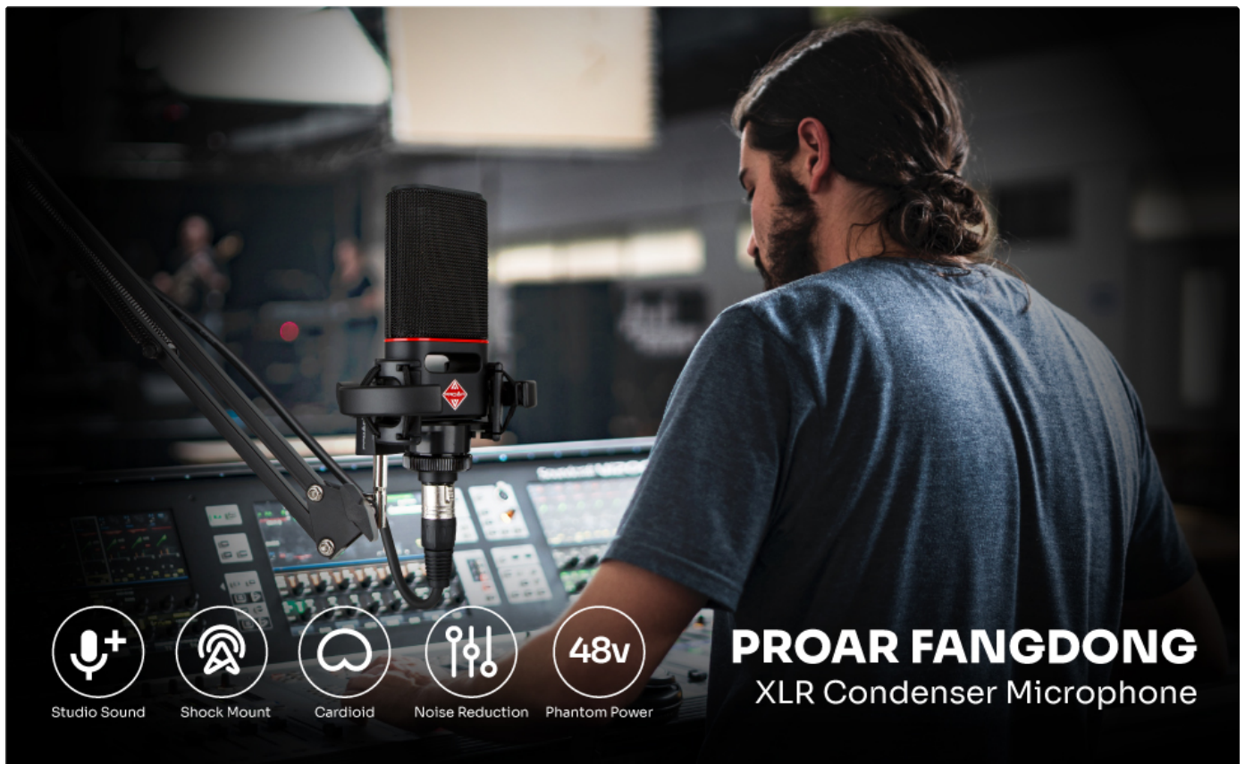
Image: The PROAR XLR Condenser Microphone, showcasing its design and components.

The PROAR XLR Condenser Microphone is a studio-grade microphone designed for high-quality audio capture. It features a gold-plated 25mm large-diaphragm capsule and a cardioid pickup pattern, making it suitable for various applications including streaming, recording, gaming, podcasting, vocals, voice-overs, and acoustic instruments. This manual provides essential information for setting up, operating, and maintaining your microphone.