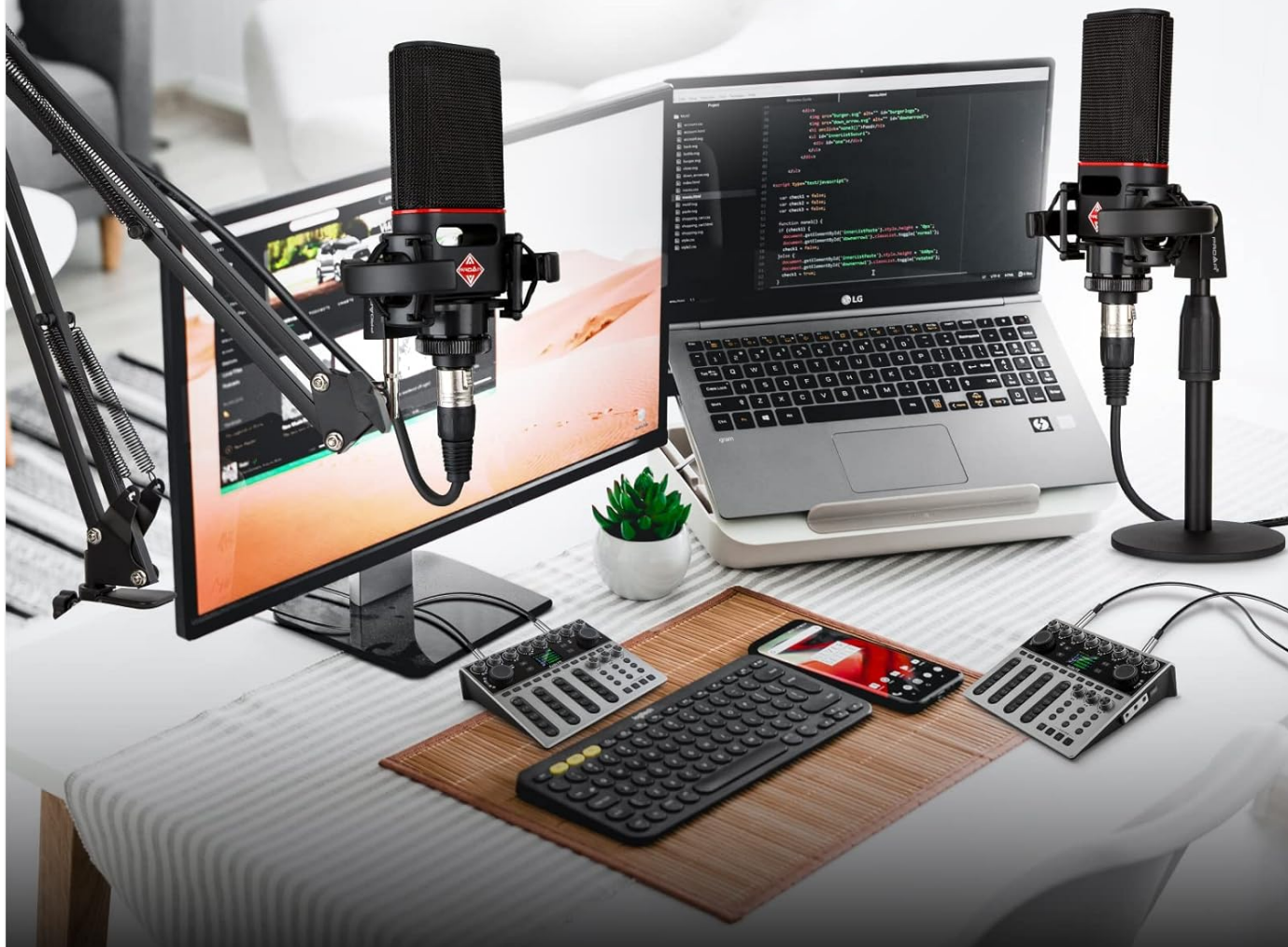
Image: Examples of flexible microphone installation, showing the microphone mounted on both a boom arm and a desktop stand.