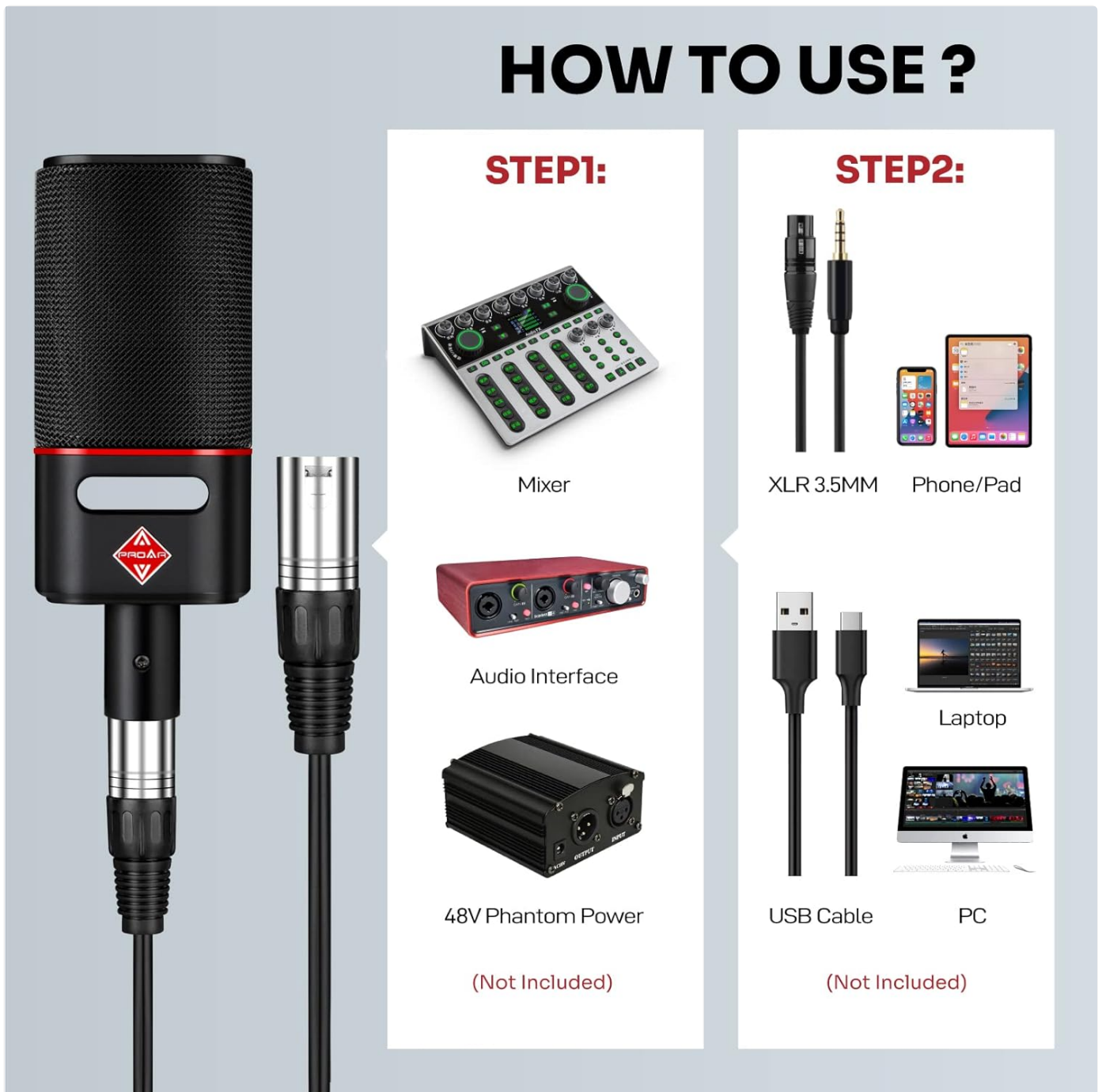
Image: Diagram illustrating how to connect the XLR microphone to a mixer, audio interface, or 48V phantom power, and then to a PC or phone. Note that phantom power and connection cables to PC/phone are not included.