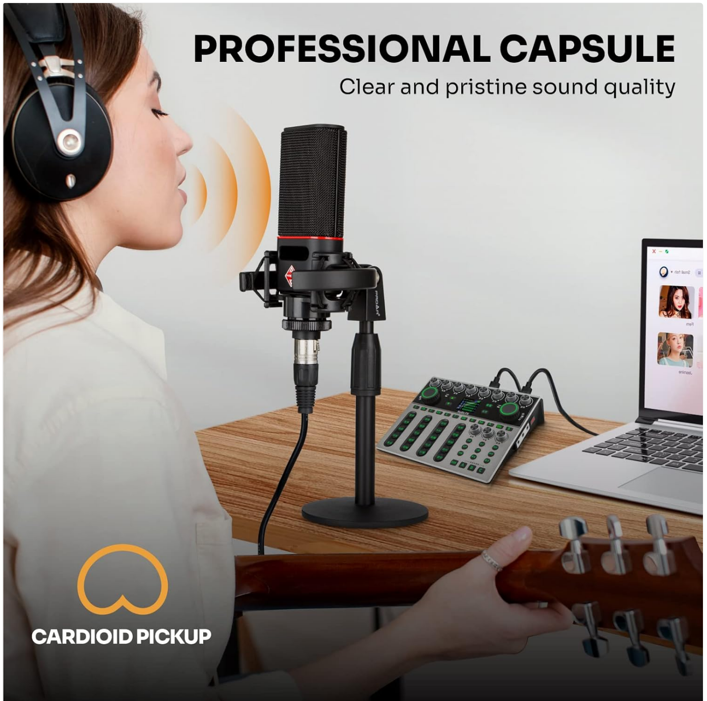
Image: A person using the PROAR XLR Condenser Microphone, illustrating its professional capsule and cardioid pickup pattern for clear sound quality.