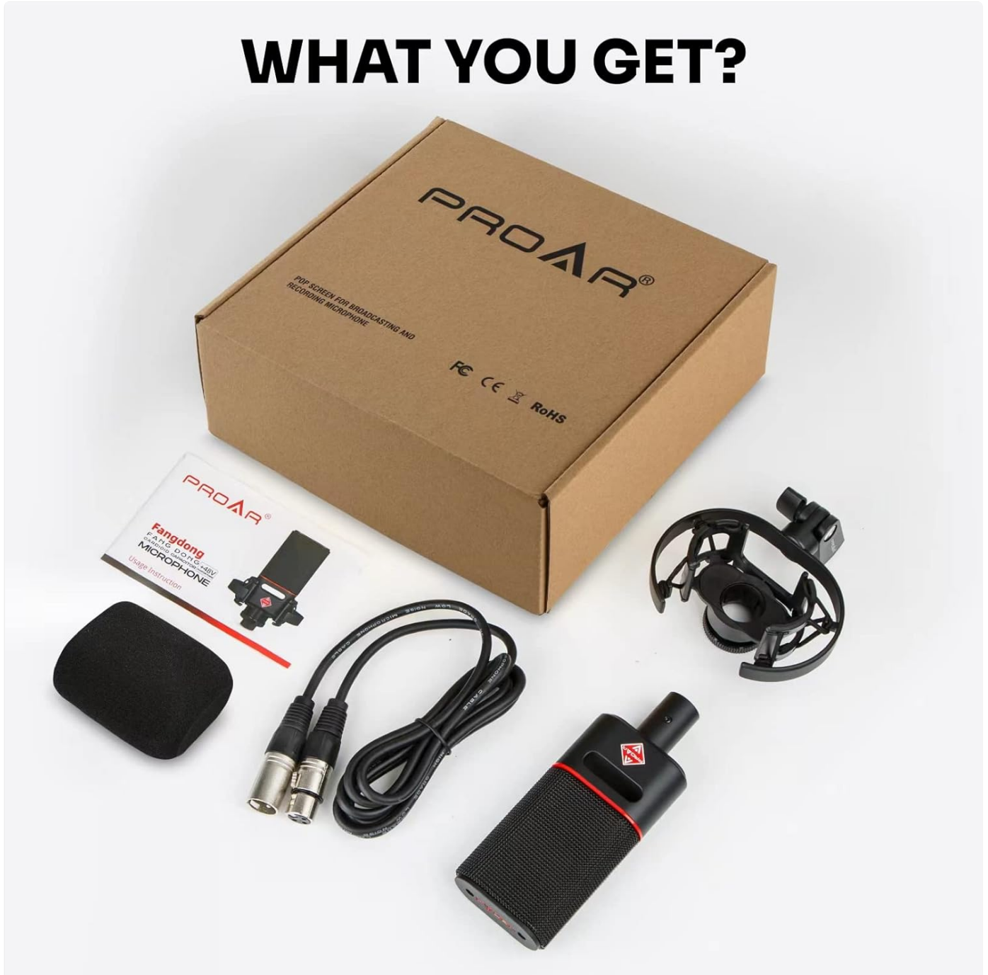
Image: All components included in the PROAR XLR Condenser Microphone package, including the microphone, shock mount, foam windscreen, XLR cable, and manual.