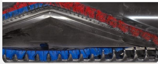
Figure 3.1: Tineco iLoop Smart Sensor in action, indicating dirt levels.