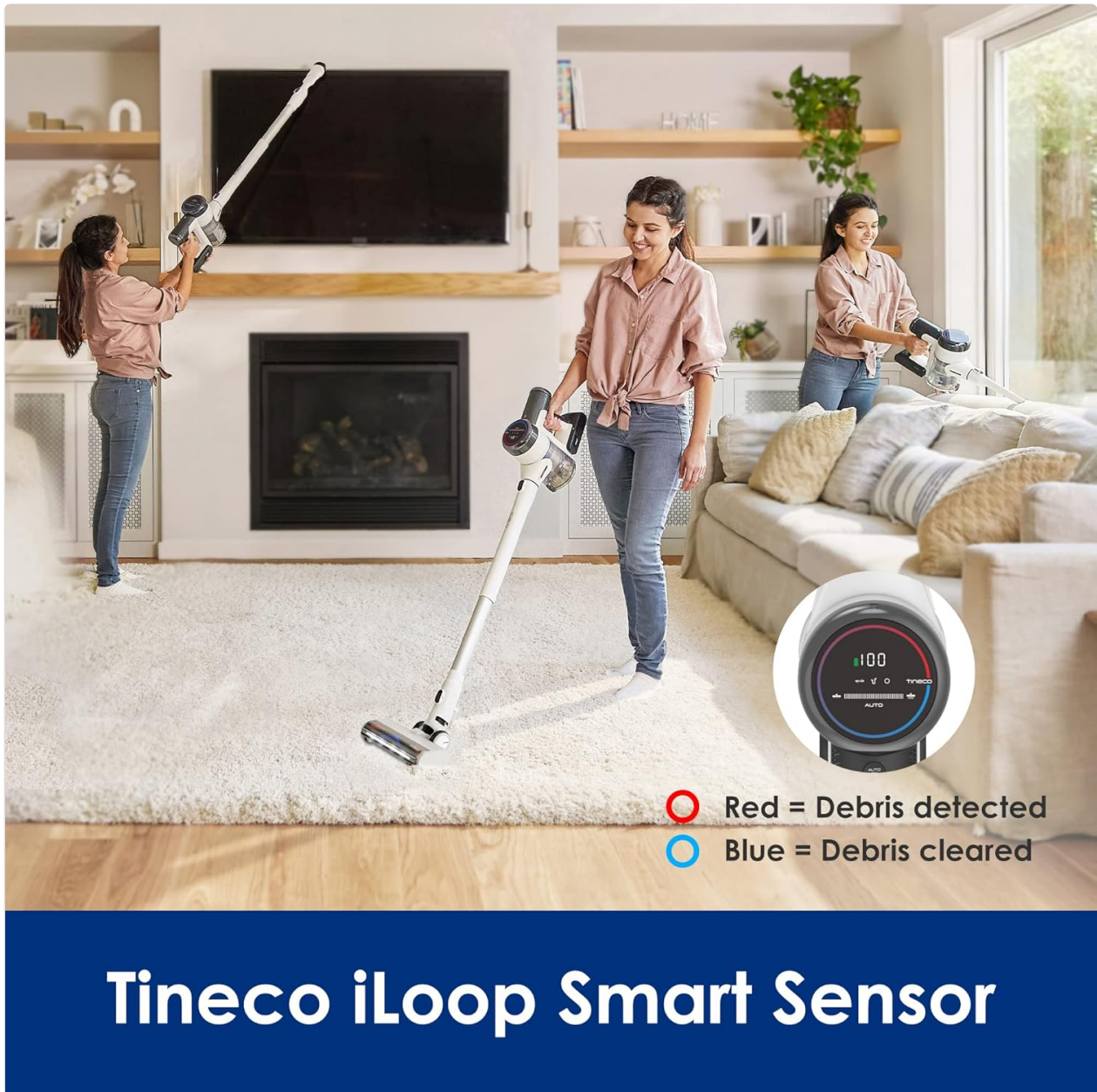
Figure 5.1: Versatile cleaning with stick and handheld modes.

Your browser does not support the video tag.