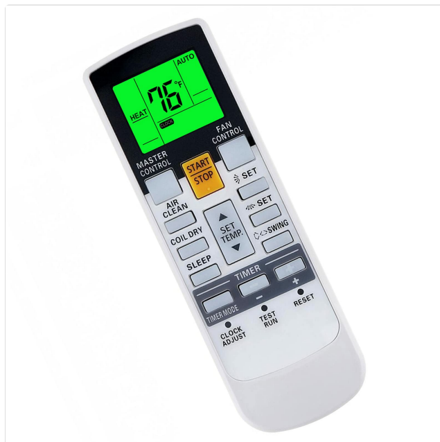
Image: Overview of the remote control's buttons and display.

Familiarize yourself with the buttons and their functions: