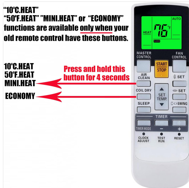
Image: Instructions for activating advanced heating and economy functions by holding a button.