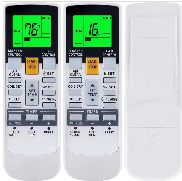
Image: Front and back views of the remote, showing how to open the battery cover.