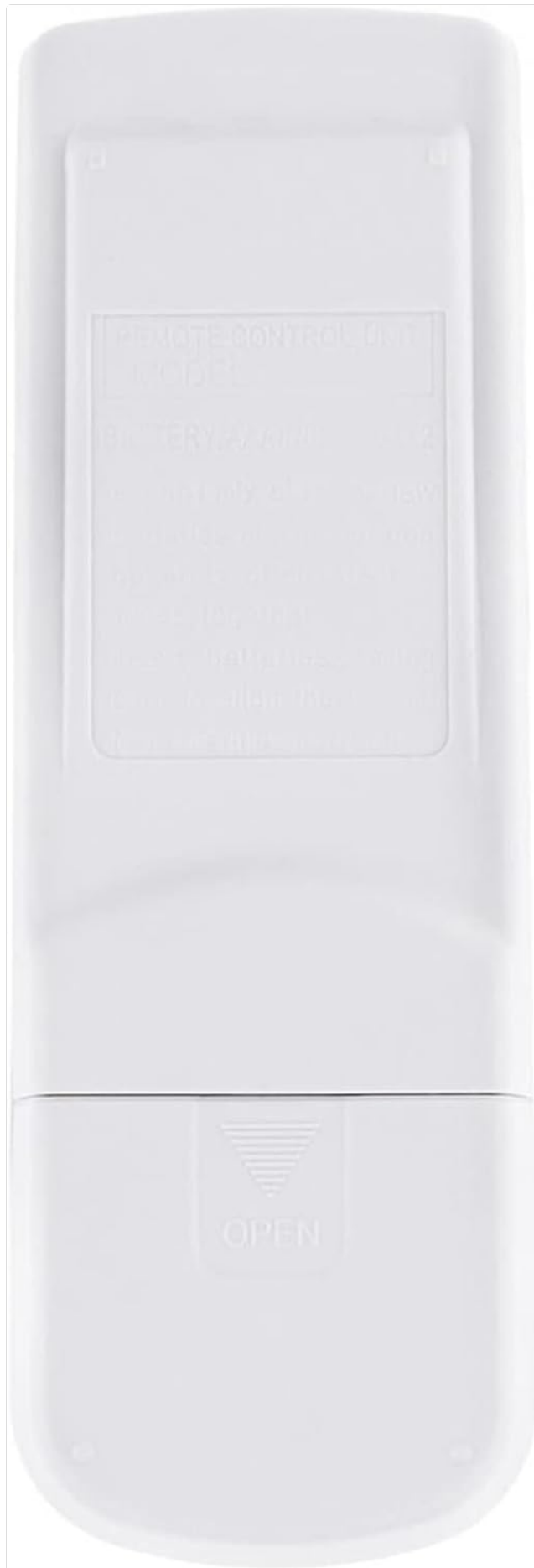
Image: Back of the remote control with the battery compartment indicated.