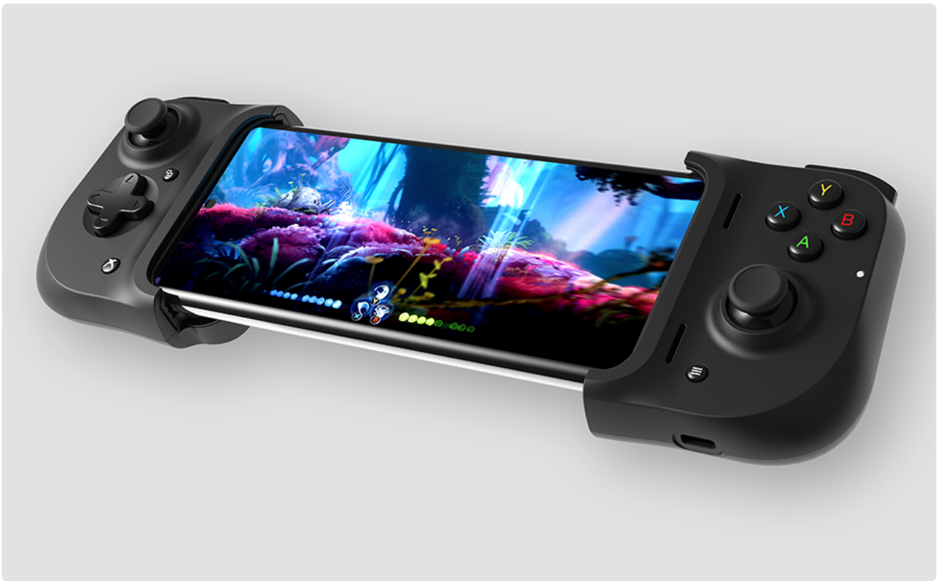
Image: The Gamevice controller with an Android smartphone securely inserted, displaying a game. This demonstrates the form-fitting design and how the phone integrates with the controller.