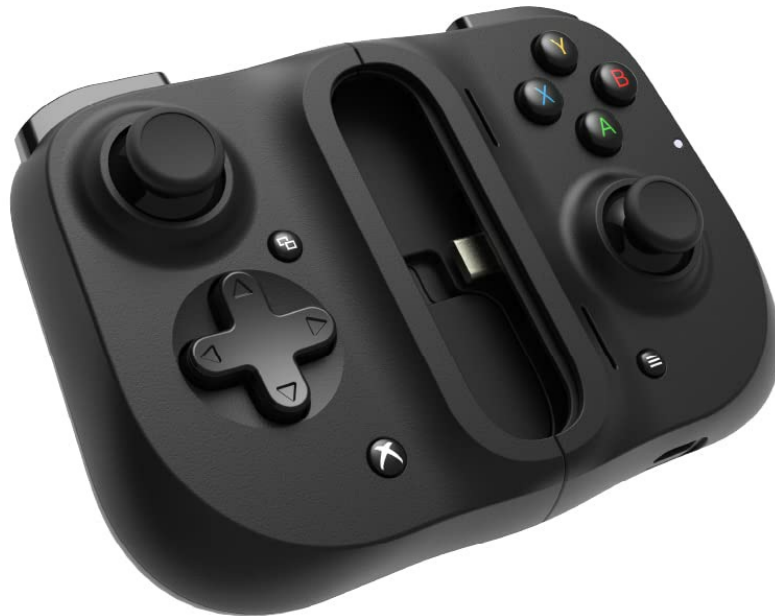
Image: The Gamevice controller shown in its collapsed, compact state, illustrating its portability and ease of storage when not in use.