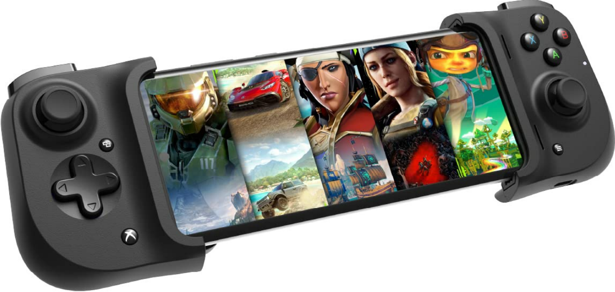
Image: The Gamevice controller with a smartphone displaying multiple game titles, accompanied by a prominent banner advertising "ONE MONTH FREE XBOX GAME PASS ULTIMATE." This highlights a key bundled offer and the gaming capabilities.