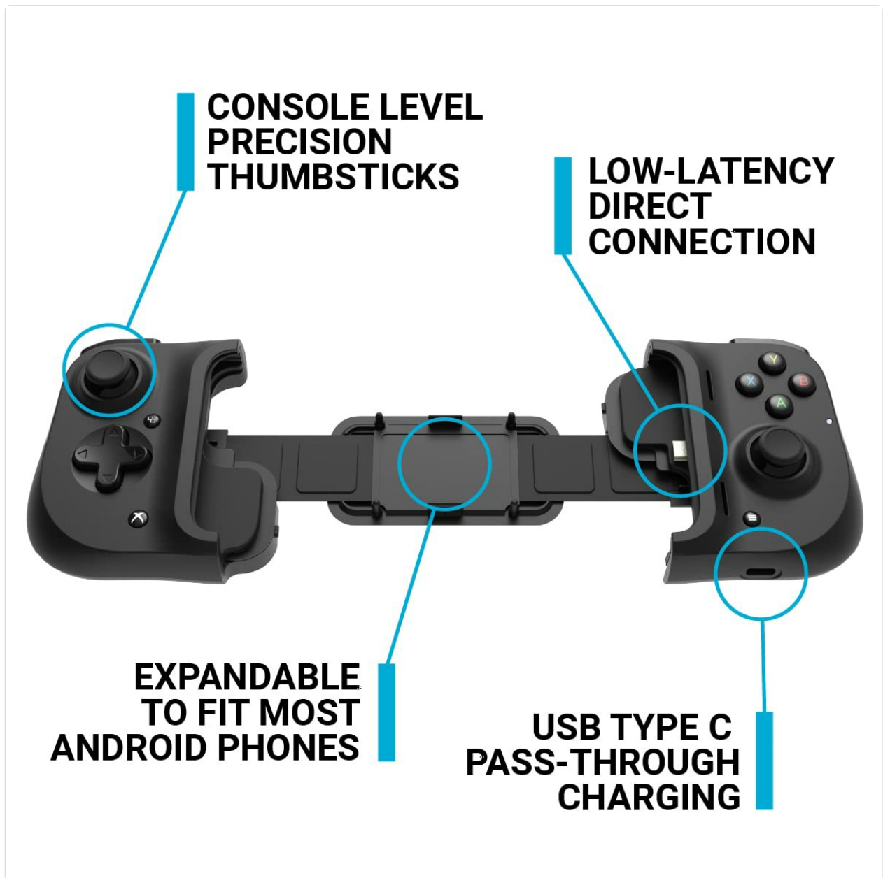
Image: A detailed diagram of the Gamevice controller, pointing out key features such as the console-level precision thumbsticks, the low-latency direct USB-C connection, its expandable design to fit various phones, and the USB Type-C pass-through charging port.