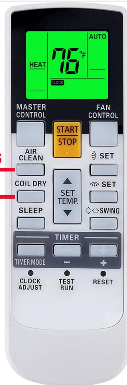
Image: A remote control with text overlay indicating that "10°C.HEAT", "50°F.HEAT", "MINI.HEAT", or "ECONOMY" functions are available only if the old remote had these buttons. A red arrow points to the 'START/STOP' button with the instruction "Press and hold this button for 4 seconds" to activate these functions.

Press and hold this button for 4 seconds