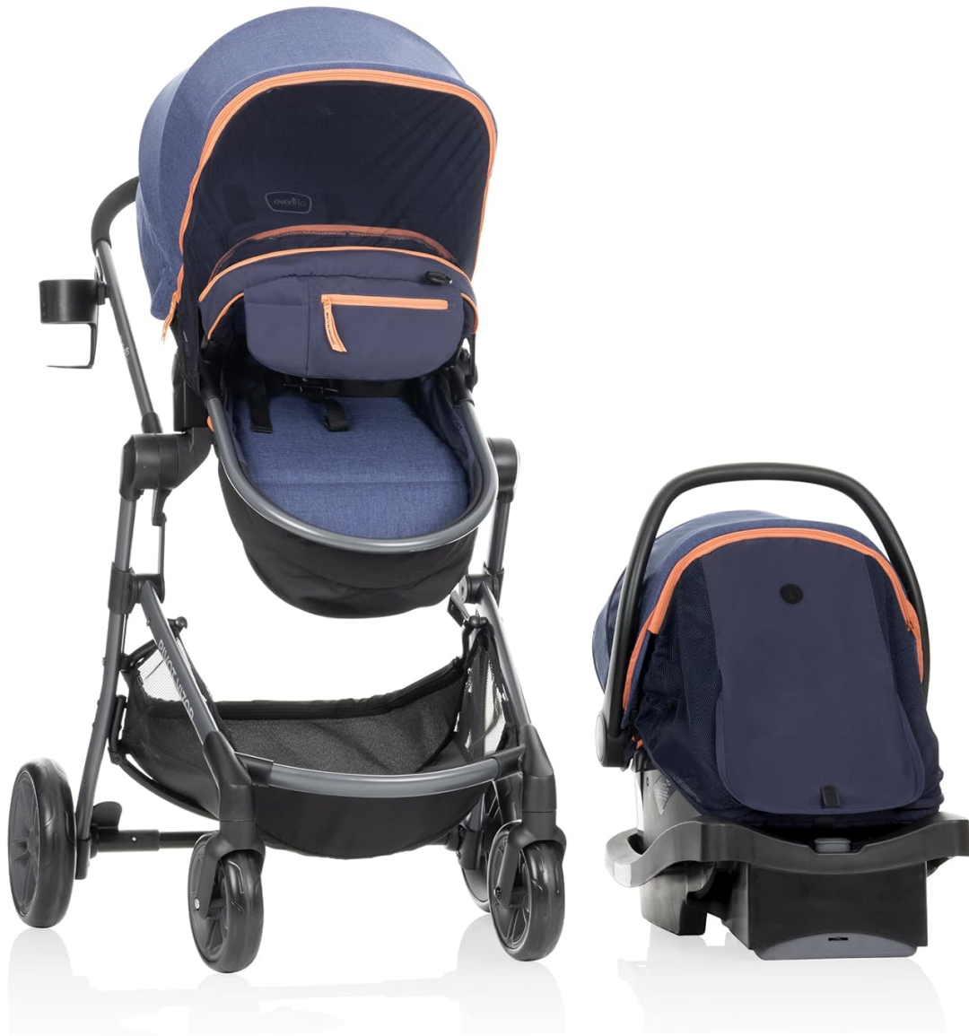
Image: The Evenflo Pivot Vizor Travel System, showcasing the stroller and the LiteMax Infant Car Seat.