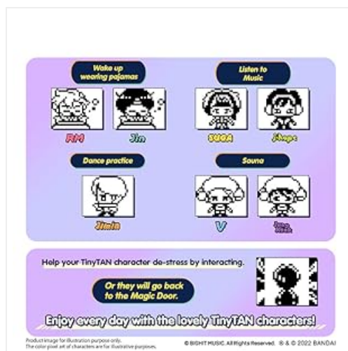
Image: Illustrations depicting various TinyTAN character activities such as waking up in pajamas, listening to music, dance practice, and sauna, emphasizing interaction to de-stress characters.

The way you care for your TinyTAN will influence their appearance and activities. Different interactions can lead to changes in their outfits and hairstyles. Ensure consistent care to see various styles and prevent your character from leaving.