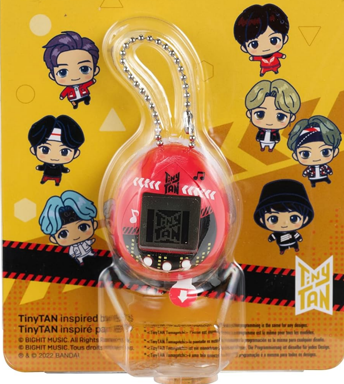
Image: Front view of the TinyTAN Tamagotchi packaging, showing the red device and various TinyTAN character illustrations.