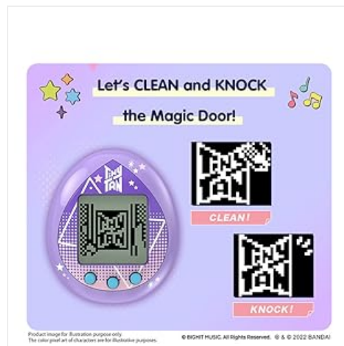
Image: Illustration showing the Tamagotchi screen with options to 'Clean' and 'Knock' the Magic Door to reveal a TinyTAN character.