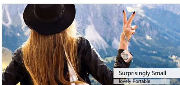
Image: A person holding a pink Divoom Beetles speaker,

Image: A red Divoom Beetles speaker conveniently attached to a backpack, illustrating its portability for music on the go.