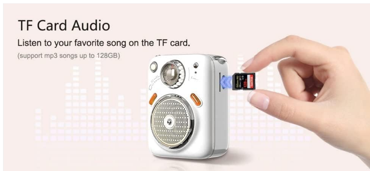
Image: A white Divoom Beetles speaker with a hand inserting a TF card, demonstrating TF card audio playback.