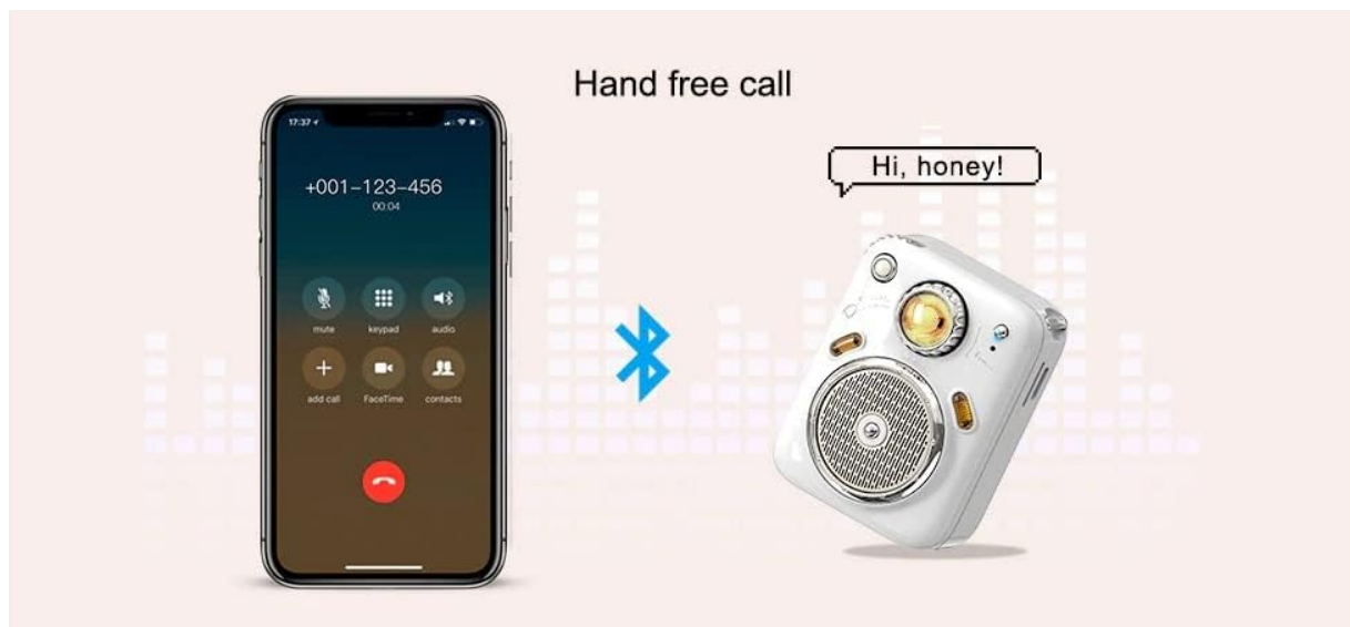
Image: A smartphone displaying an active call screen next to a white Divoom Beetles speaker, illustrating the hands-free call feature.