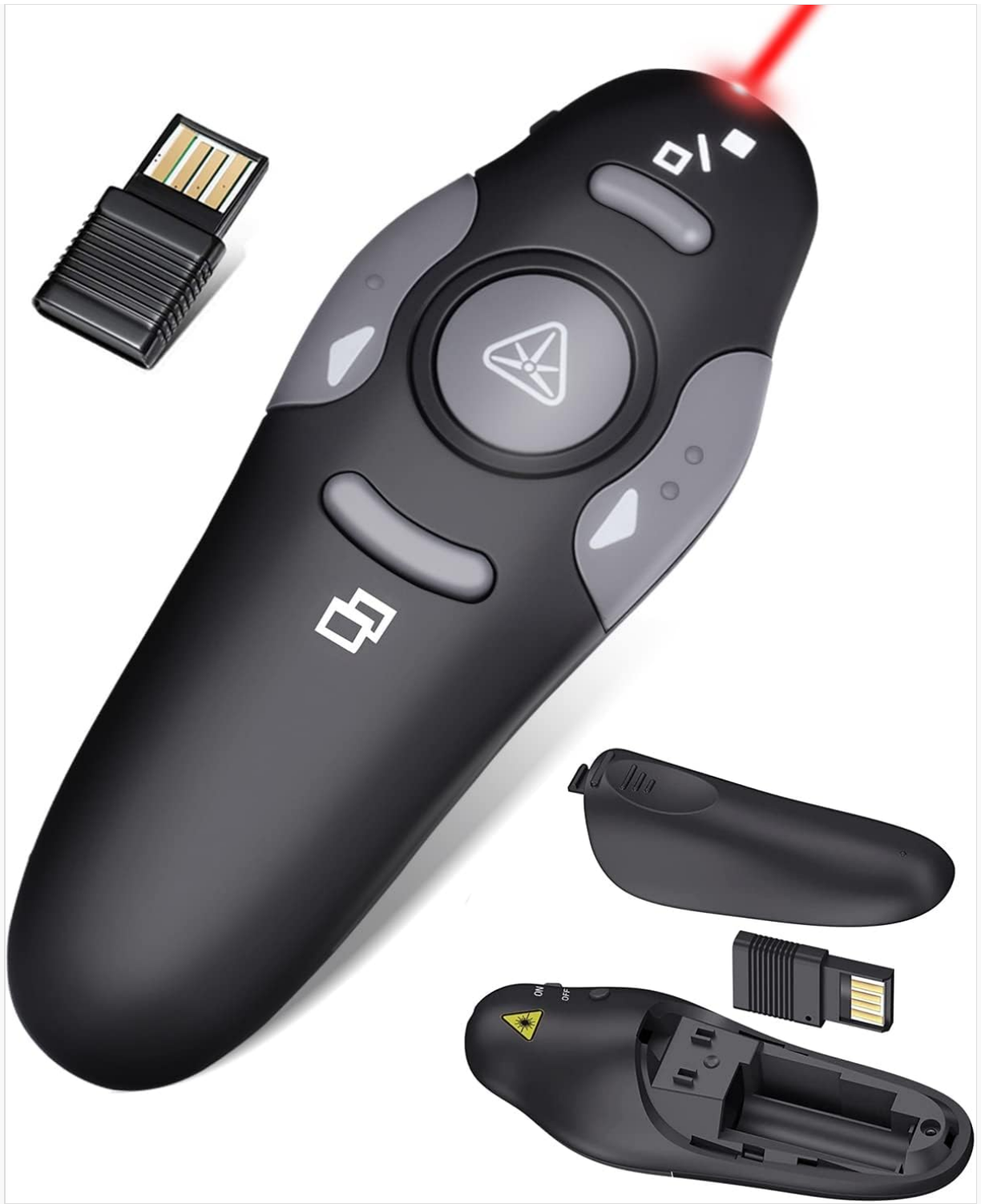
Image: The CLIKBUTM Wireless Presentation Clicker, showing the main unit, the removable USB dongle, and the open battery compartment for AAA battery insertion.