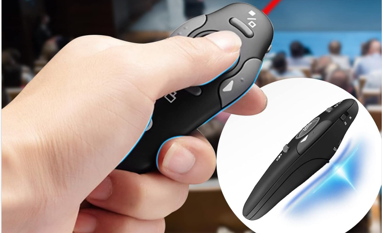
Image: A hand demonstrating the use of the CLIKBUTM presentation clicker, with the red laser beam visible on a large projection screen.