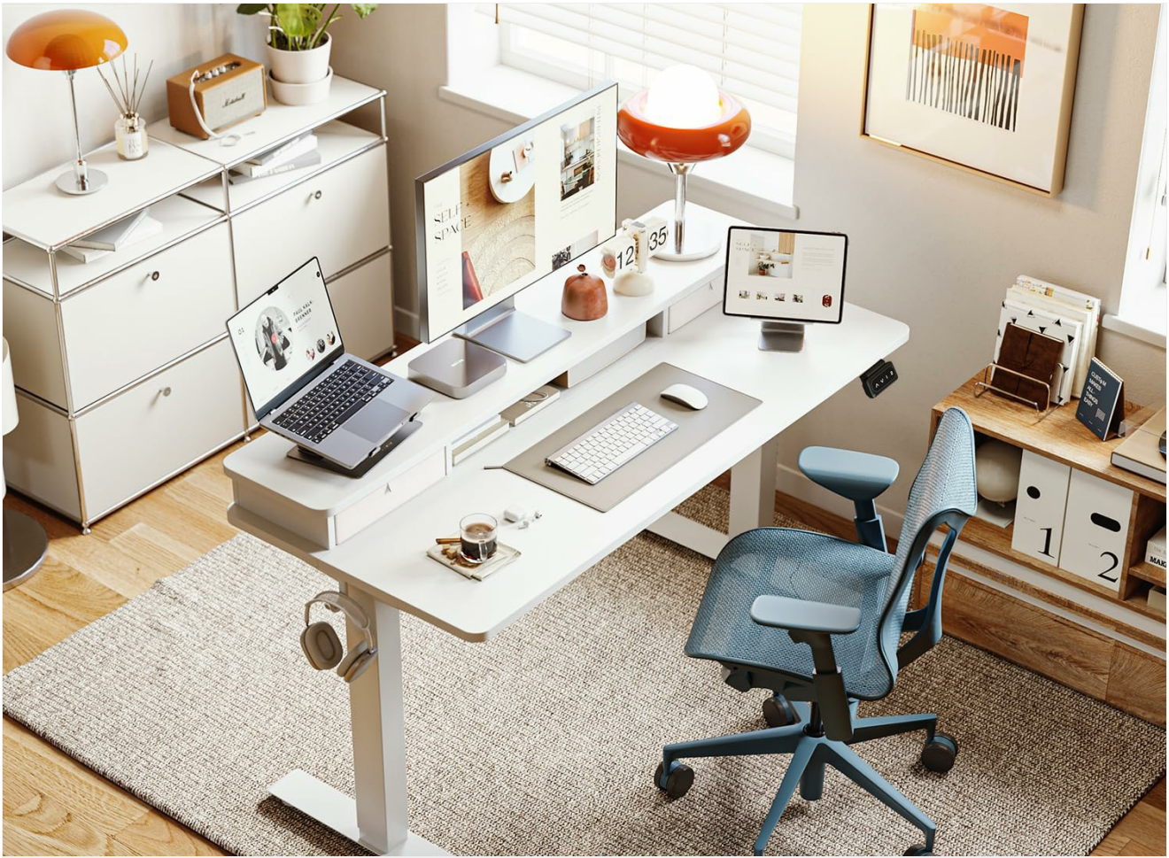
Image: Fully assembled BANTI Electric Standing Desk, showcasing its design and functionality in a home office setting.