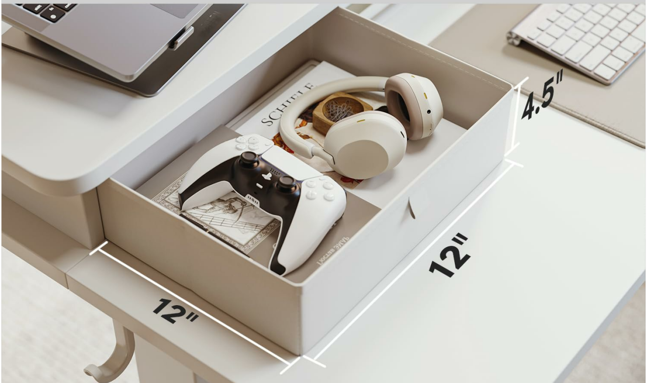
Image: View of the dual-drawer organization, showing internal dimensions and examples of items that can be stored.