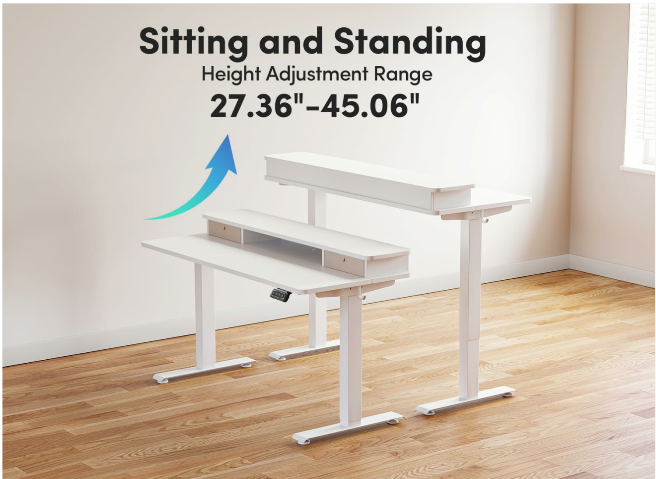
Image: Visual representation of the desk's height adjustment capabilities, illustrating both sitting and standing positions.