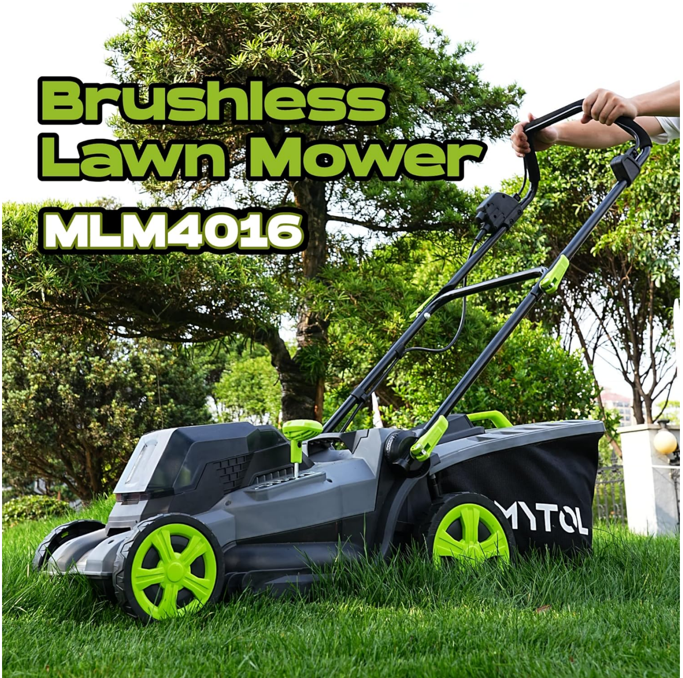
Image: A person operating the MYTOL lawn mower on a lawn.