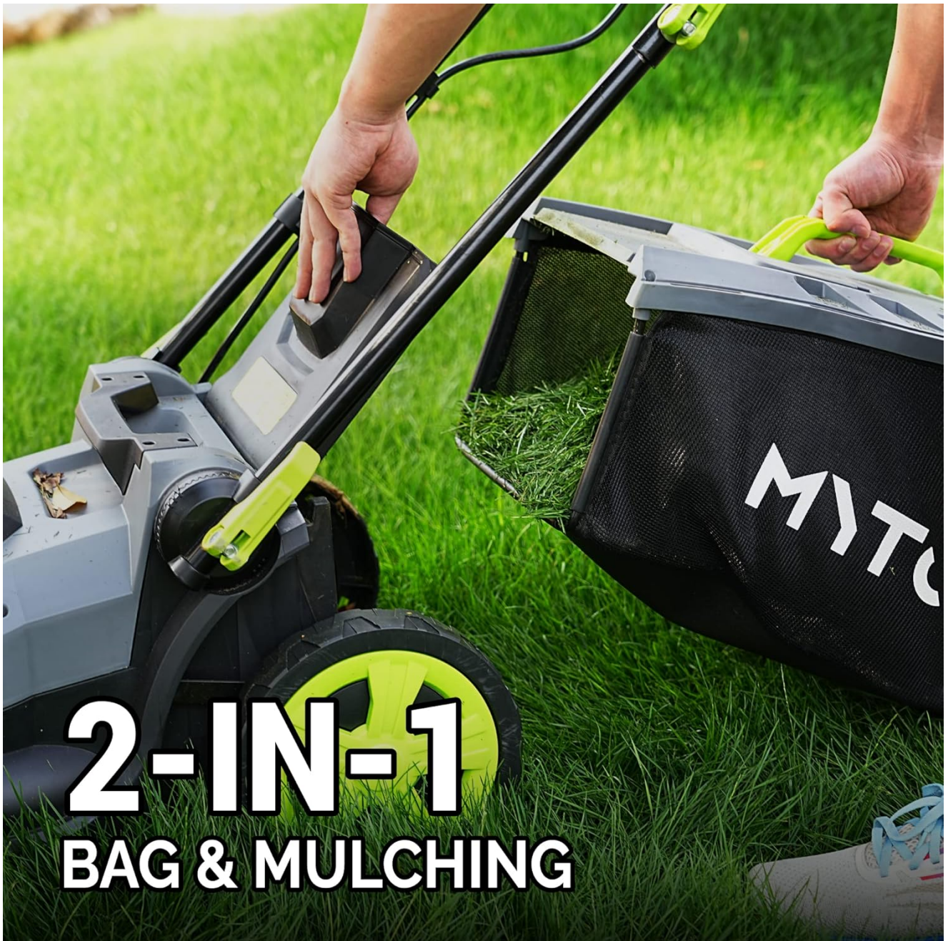
Image: A person attaching the grass collection bag to the lawn mower.