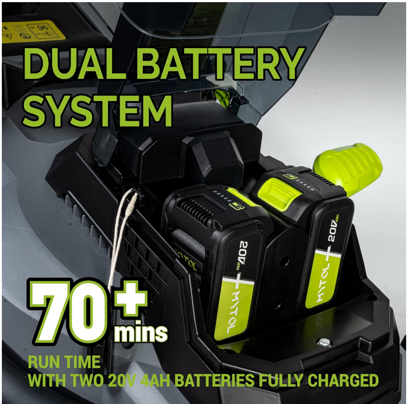
Image: Two 20V batteries being inserted into the mower's battery compartment.