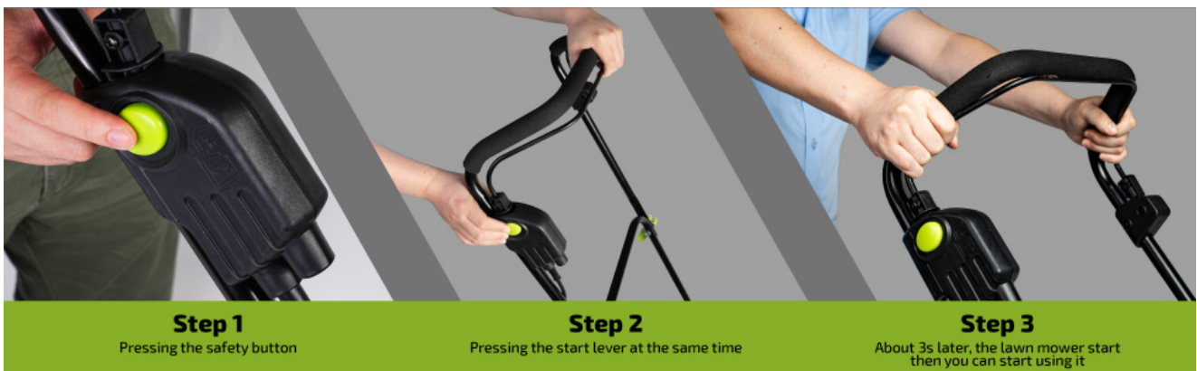
Image: Visual guide for starting the lawn mower, showing the safety button and start lever.

To start the MYTOL Cordless Lawn Mower, first ensure the safety key is inserted and the batteries are charged. Then, press and hold the safety button on the handle, and simultaneously pull the start lever towards the handle. Release the safety button once the mower starts.