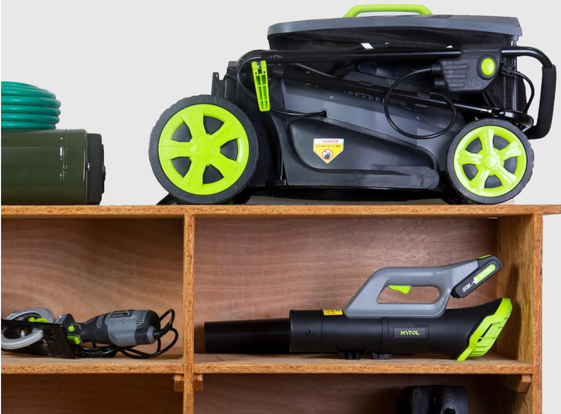
Image: The lawn mower with its handles folded for easy storage.