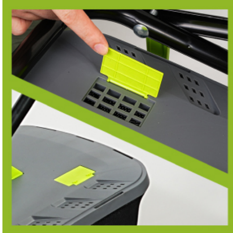
Image: The full bag indicator flap on the grass catcher.

The grass collection bag is equipped with a full bag indicator. When the indicator flap is closed, it signifies that the bag is full and needs to be emptied. Empty the bag regularly to maintain optimal cutting performance.