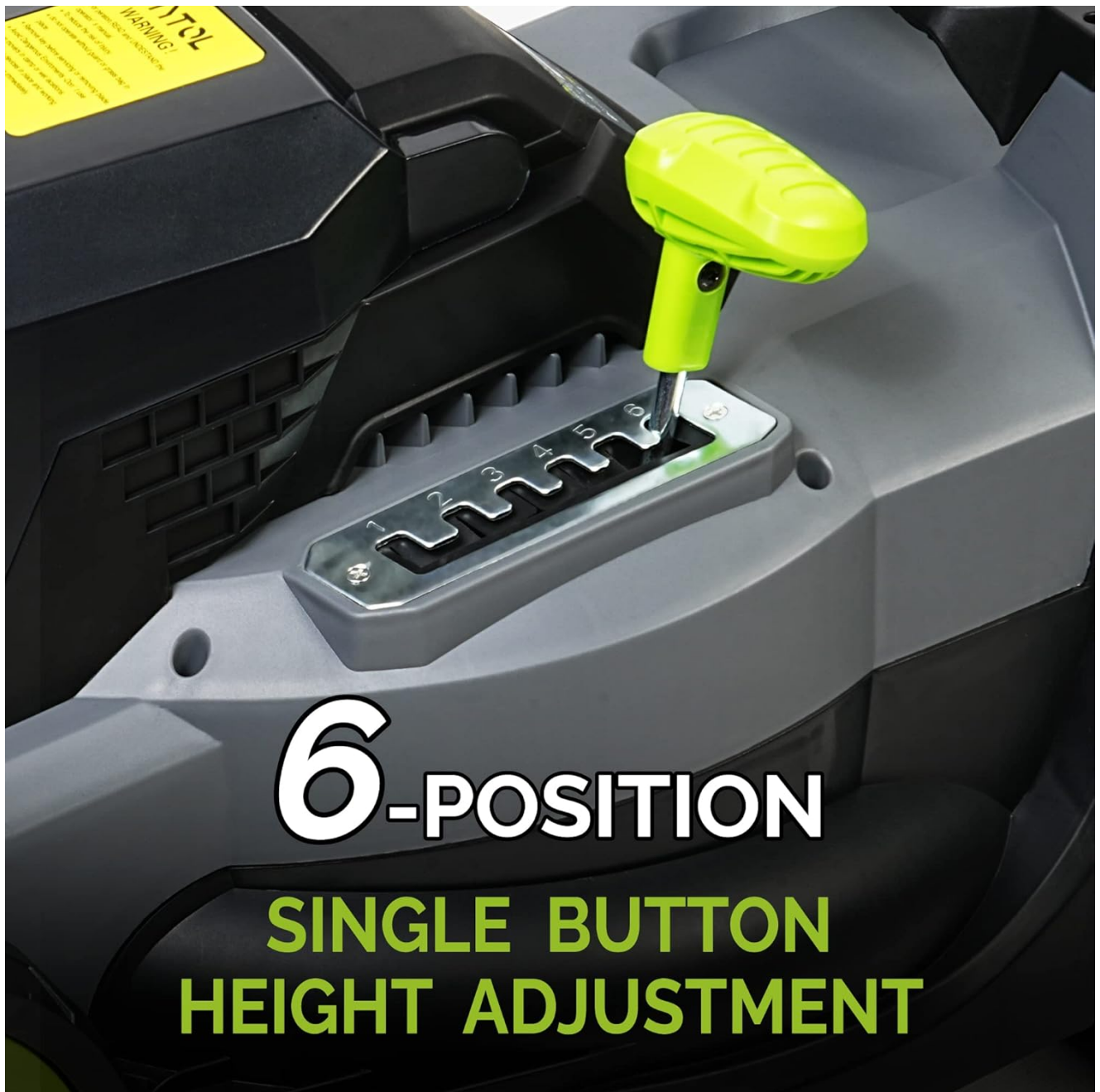
Image: Detail of the height adjustment lever with numbered settings.