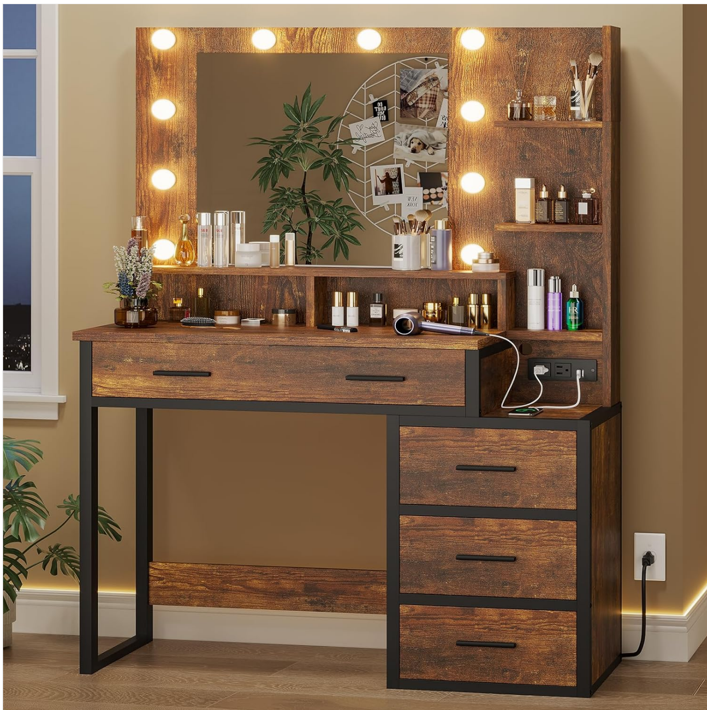
Image: The Tiptiper Vintage Vanity Desk, showcasing its mirror, lights, and overall design.