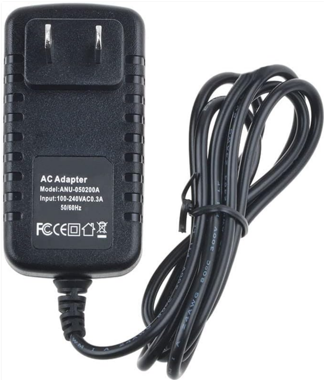
Figure 3.1: Rear view of the kybate AC Adapter, displaying the product label with model number (ANU-050200A), input voltage (100-240VAC 0.3A), and various certification marks (FC, CE, RoHS).