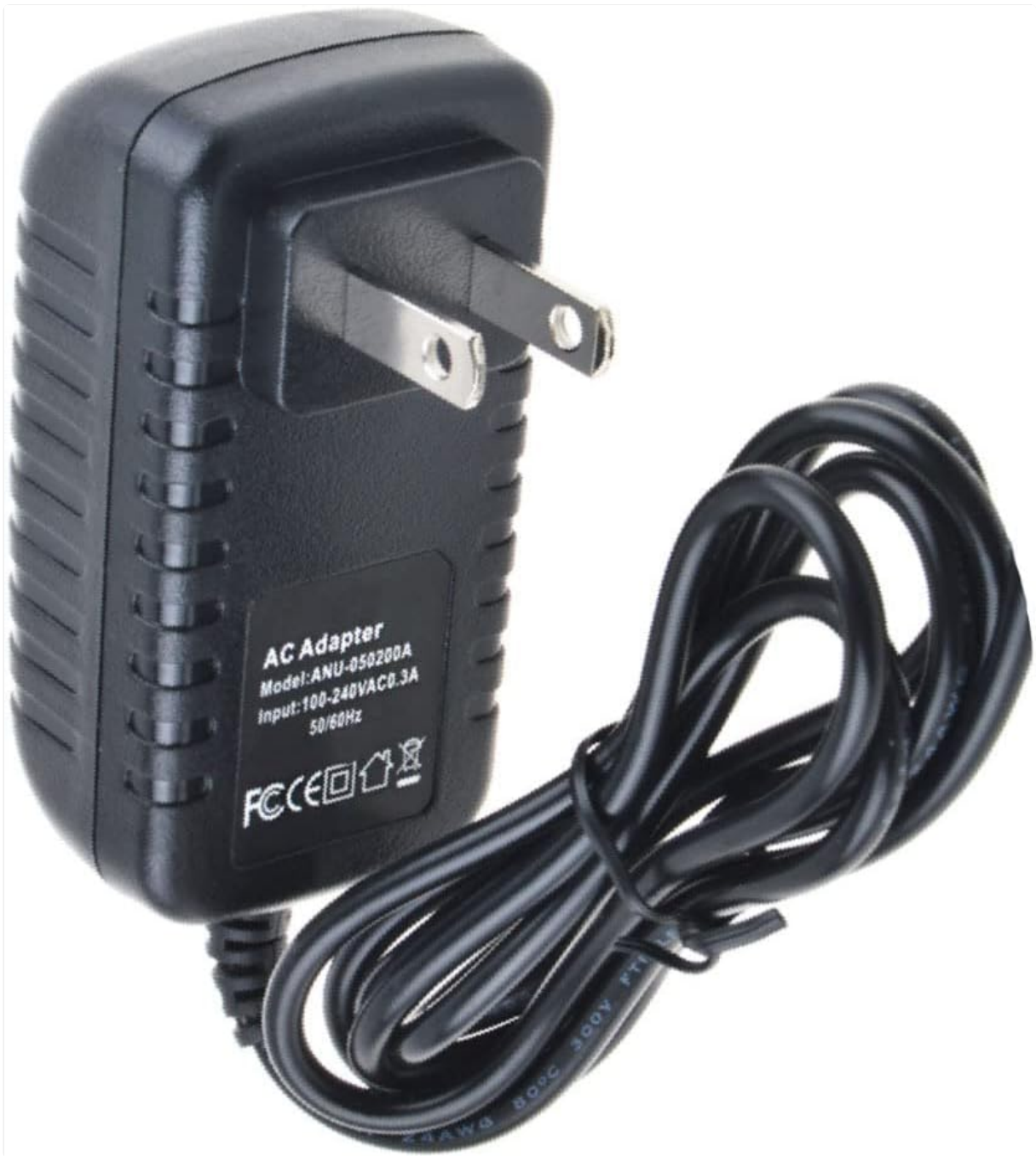
Figure 1.1: Front view of the kybate AC Adapter, showing the US standard two-prong plug and the attached output cable. The adapter casing is black with ventilation grooves on the sides.