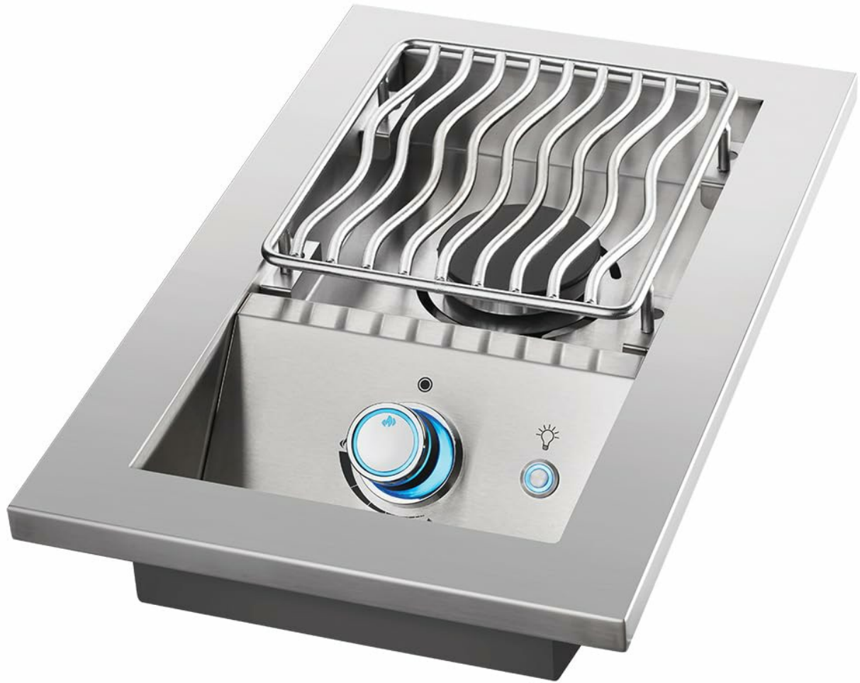
Figure 5.1: JETFIRE™ Ignition in action