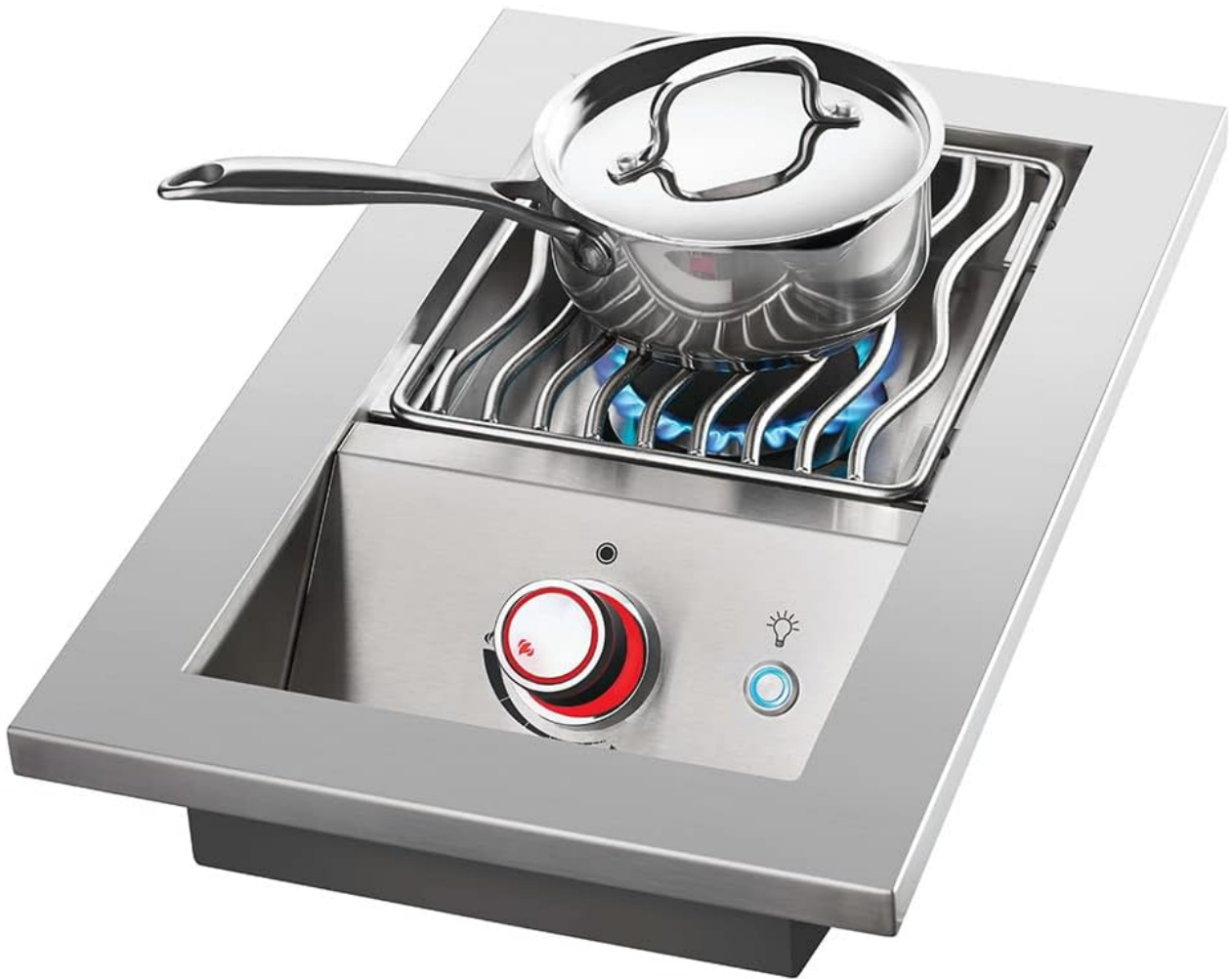
Figure 5.3: Control knob with red SafetyGlow (burner in use)