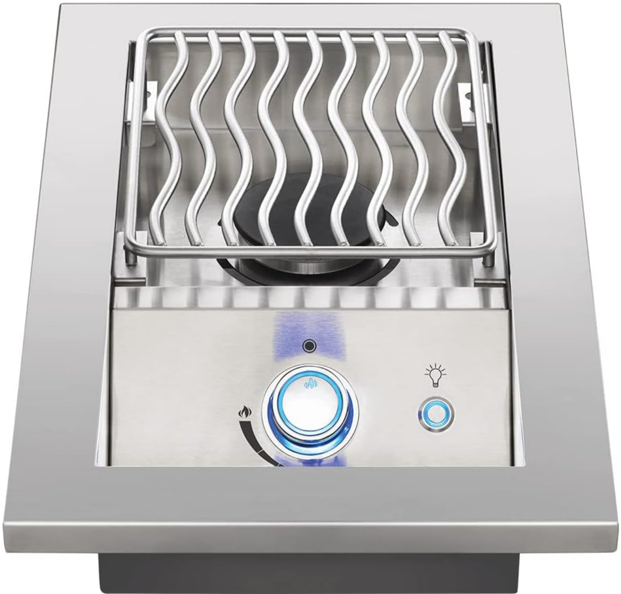
Figure 5.2: Control knob with blue SafetyGlow (off/standby)