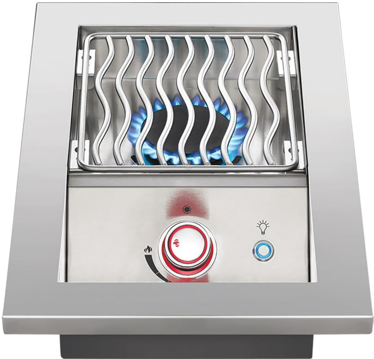
Figure 5.4: Pot on the range burner

Adjust the flame intensity using the control knob to suit your cooking needs. The burner provides consistent heat for various culinary tasks.