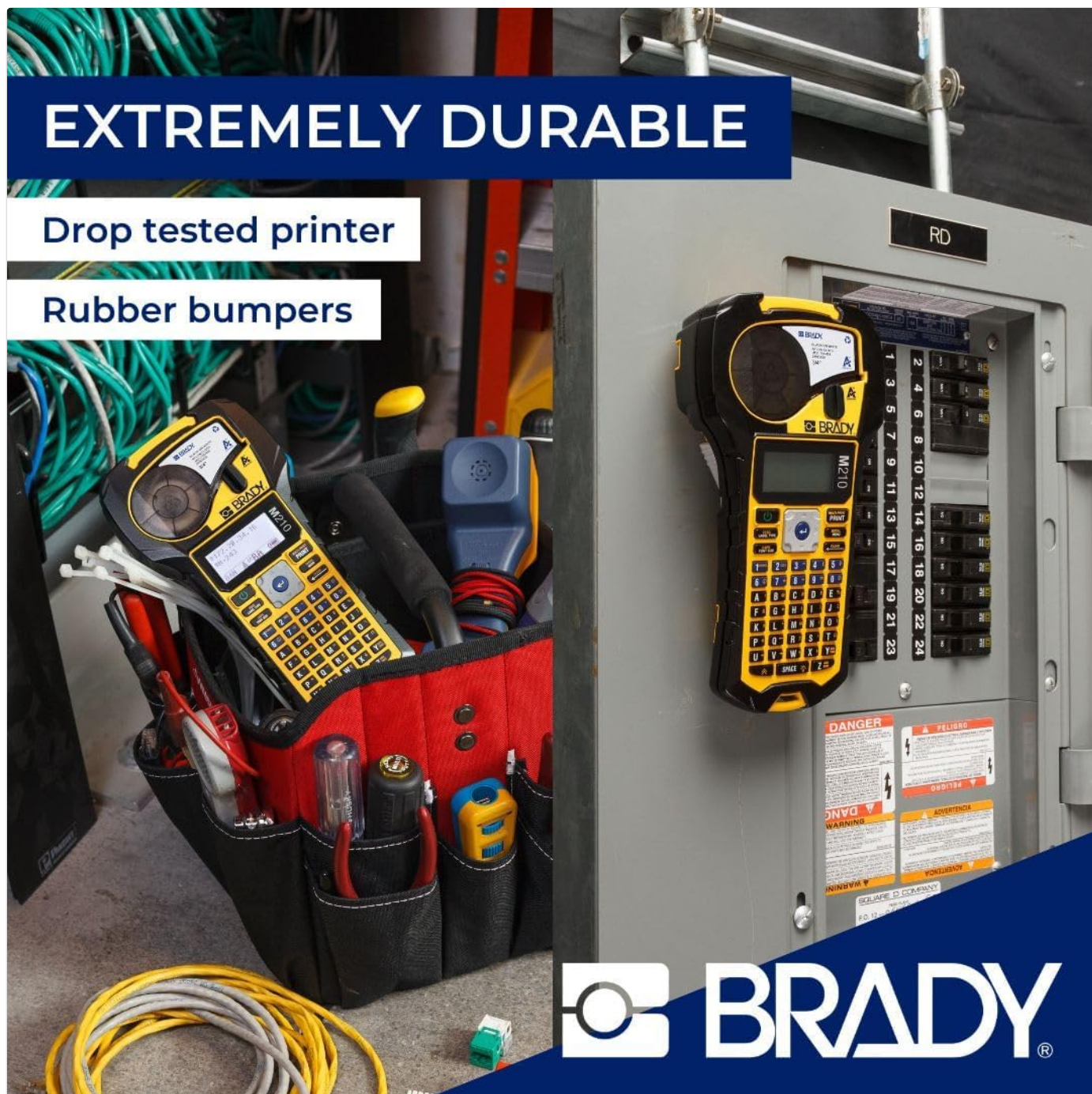
Figure 6: Examples of diverse labeling applications possible with the M210, including electrical, wire, and general identification.