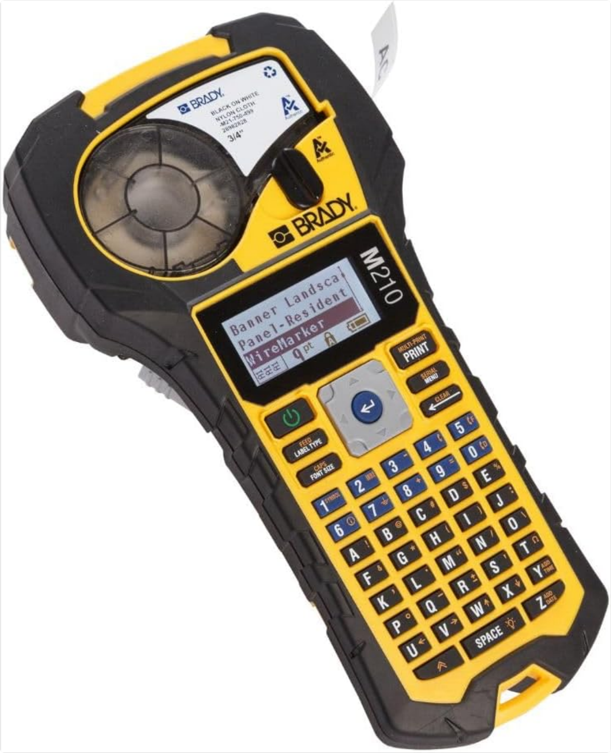
Figure 7: The Brady M210 printer, emphasizing compatibility with authentic Brady cartridges.

Note: The M210 is designed for use with Brady authentic cartridges to ensure compatibility and performance. Look for the authentic logo on the packaging.