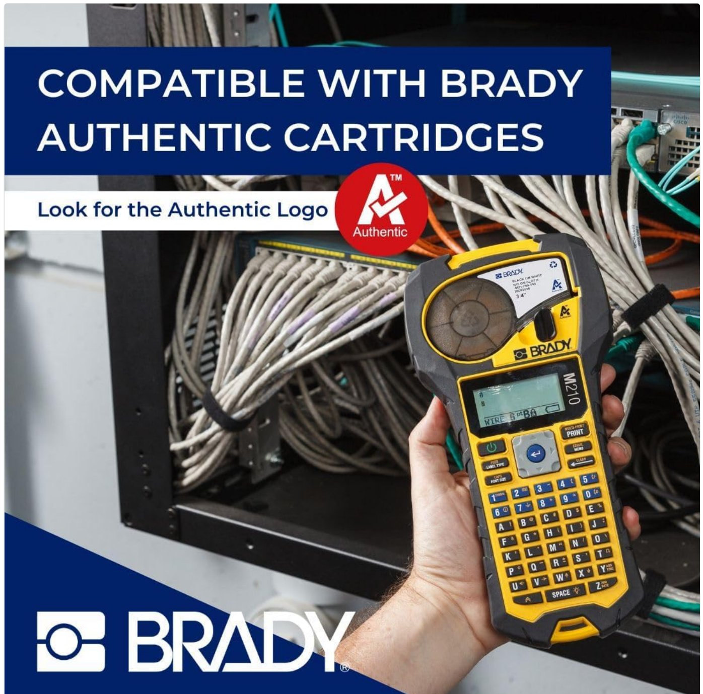
Figure 5: The M210's user-friendly interface, including the ABC keypad and display for easy label design.

After entering your text and selecting desired options, press the PRINT button to generate the label. The ergonomic cutter holds onto the label after cutting for easy retrieval.