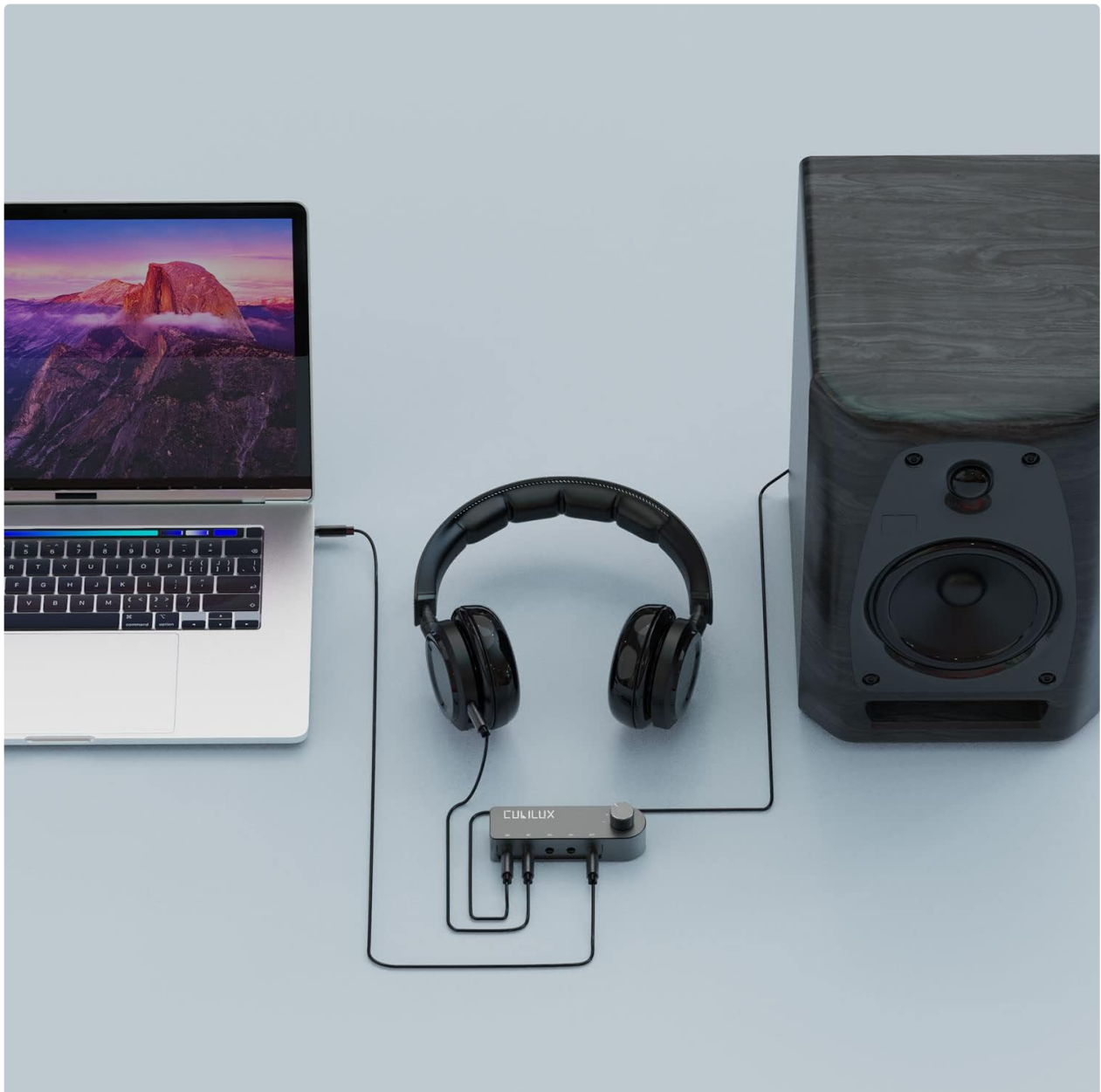
Image 4: Example setup. This image shows the audio switcher connected to a laptop, with headphones and a speaker also connected, demonstrating a typical use case.