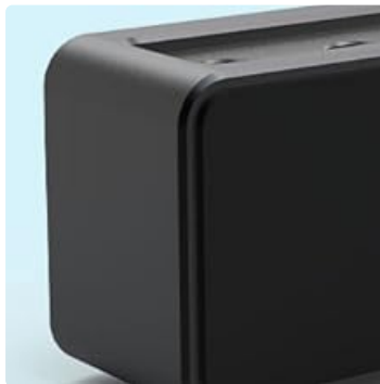
Image 3: Bottom view of the audio switcher. This image highlights the anti-skid silicone pad on the underside of the device, designed to prevent it from sliding on surfaces.