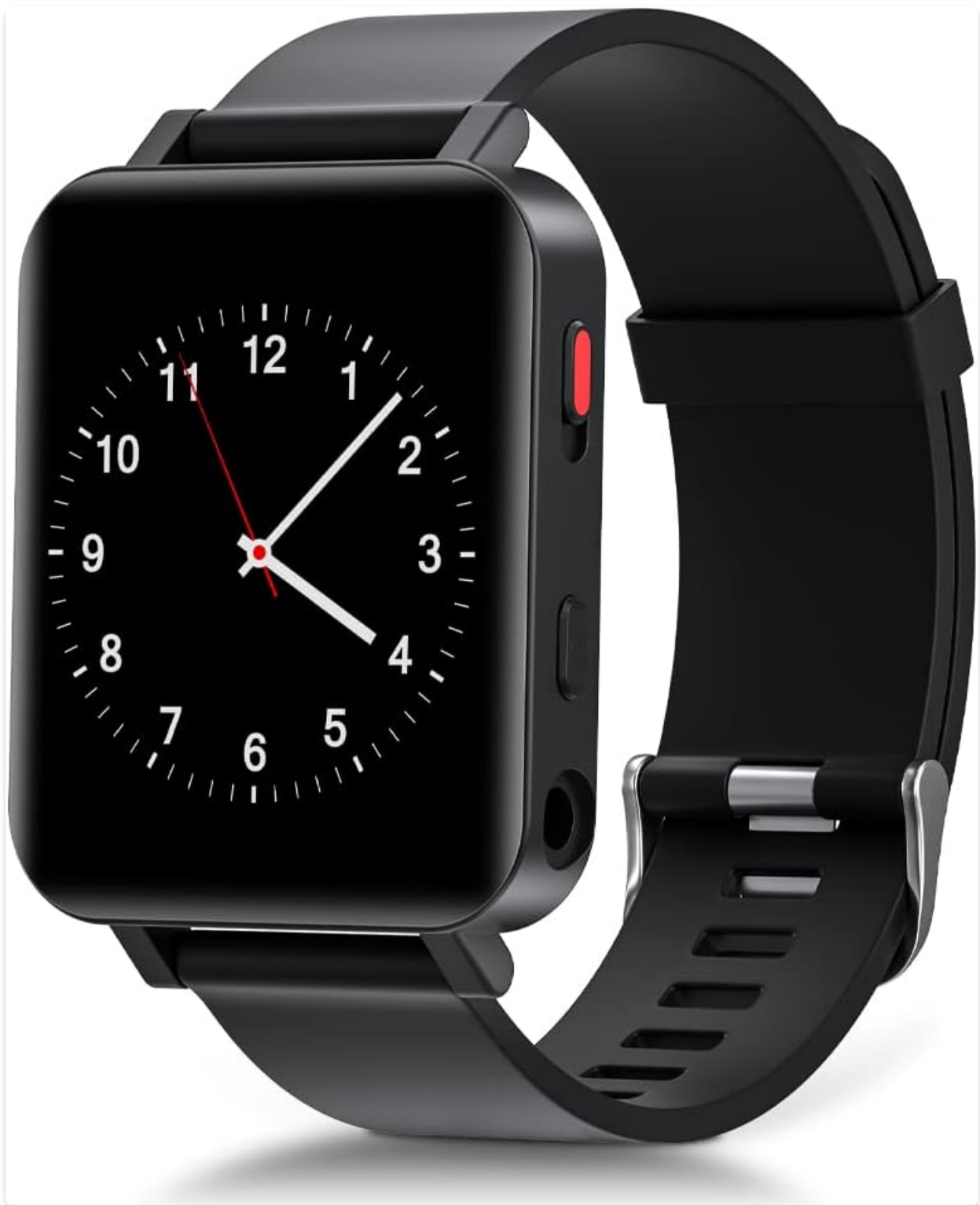
Image: The JOLIKE M1 MP3 Player, showcasing its wearable design and digital display.