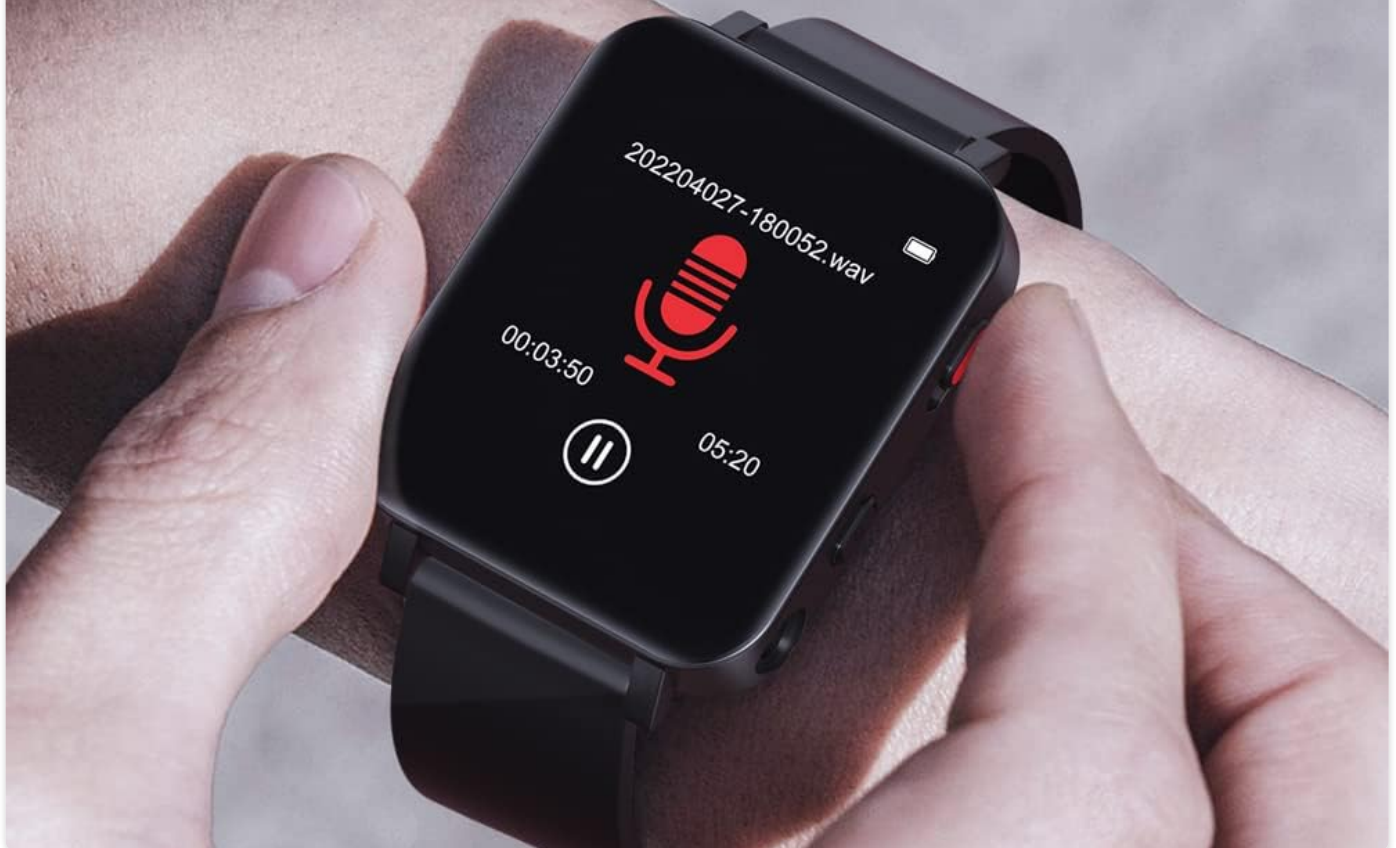
Image: The one-button recording feature in action, showing the recording interface.