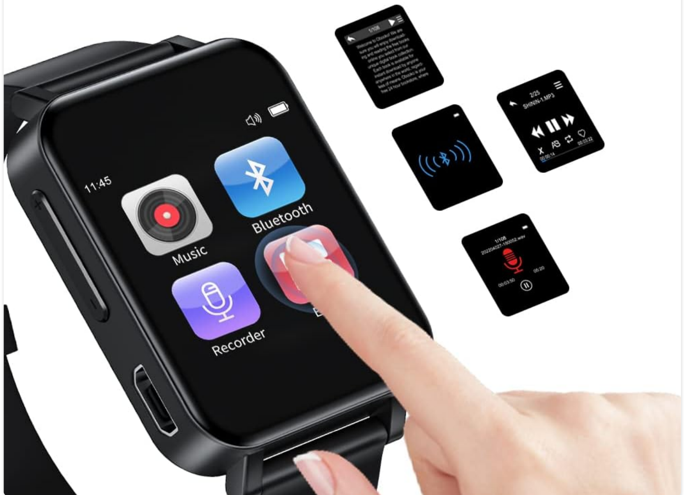
Image: Multi-functional interface of the JOLIKE M1 MP3 Player, highlighting its touch screen capabilities.