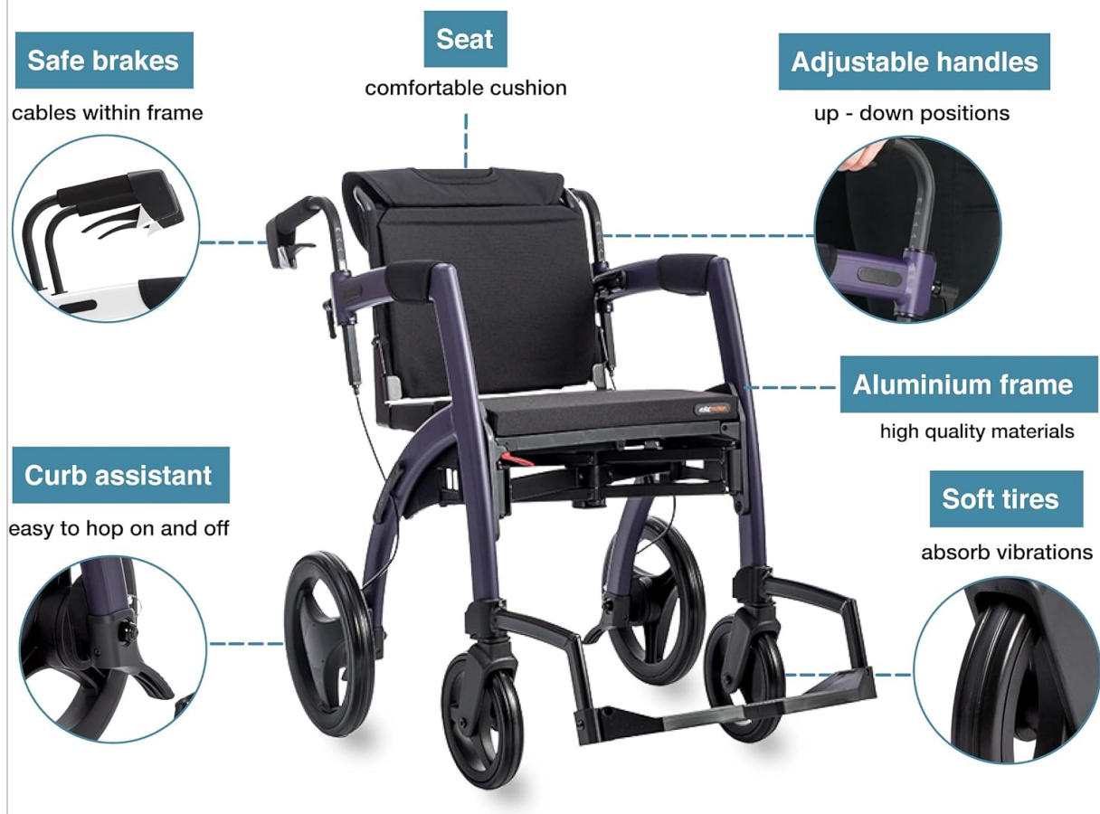
Image: An annotated image of the Rollz Motion 2.1, pointing out the curb assistant and other key features.