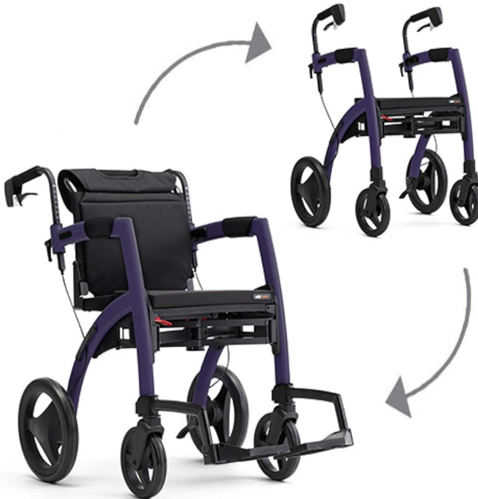
Image: Visual representation of the Rollz Motion 2.1's transformation capability between rollator and wheelchair modes.