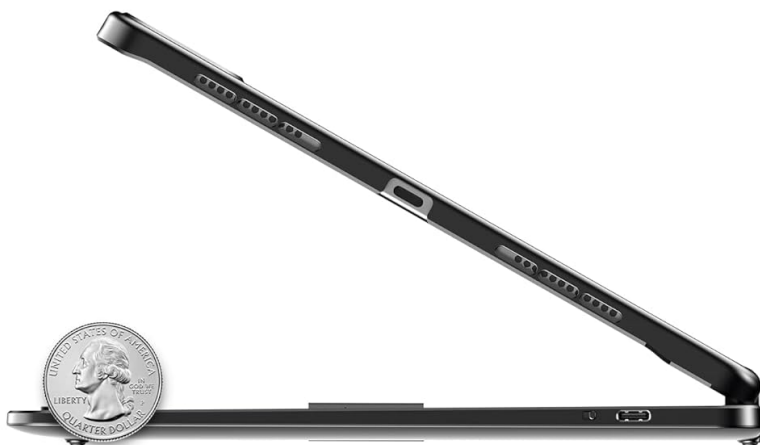
Keys protected in tablet mode