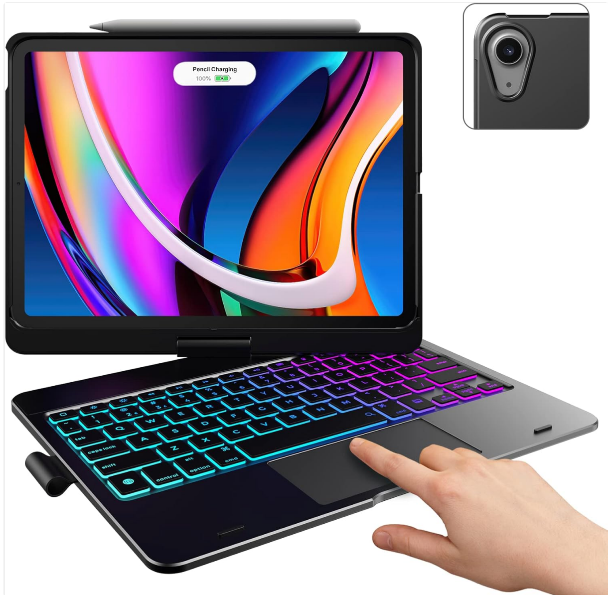
Image: The typecase keyboard case with an iPad securely inserted, ready for use. Note the integrated trackpad and backlit keys.

Carefully align your iPad with the protective shell of the keyboard case. Gently press the iPad into place, ensuring all corners are securely seated. The case is designed to protect all sides of your iPad.