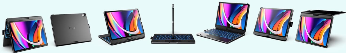
Image: Visual representation of the 7 versatile modes supported by the 360° rotatable hinge, including Laptop, Stand, and Tablet modes.