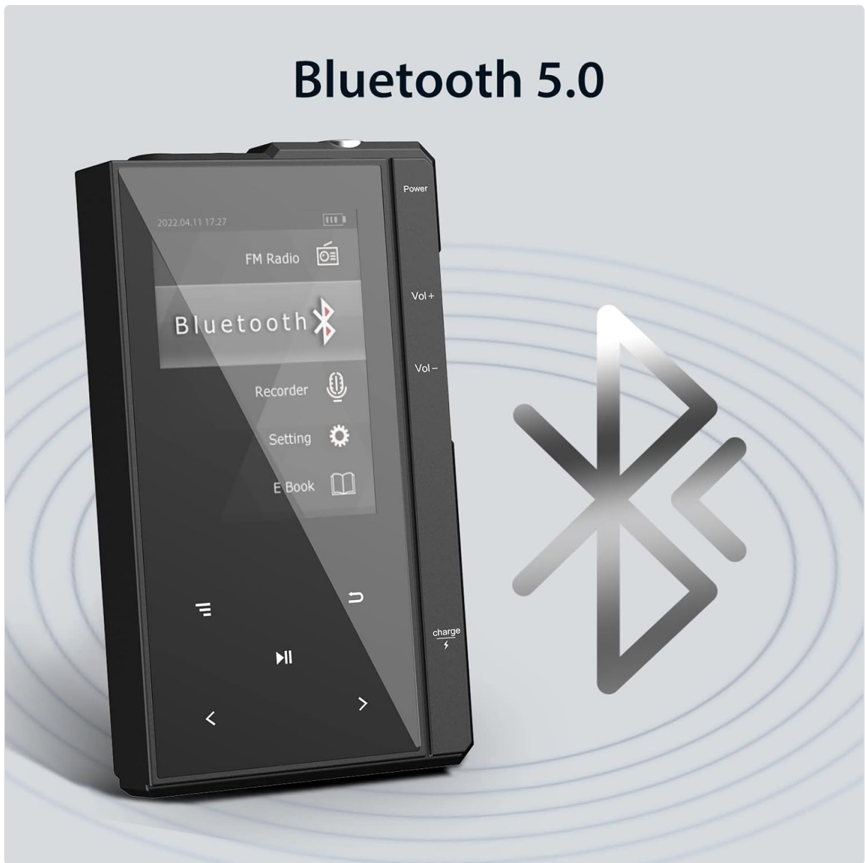
Figure 3.2: Bluetooth 5.0 Feature