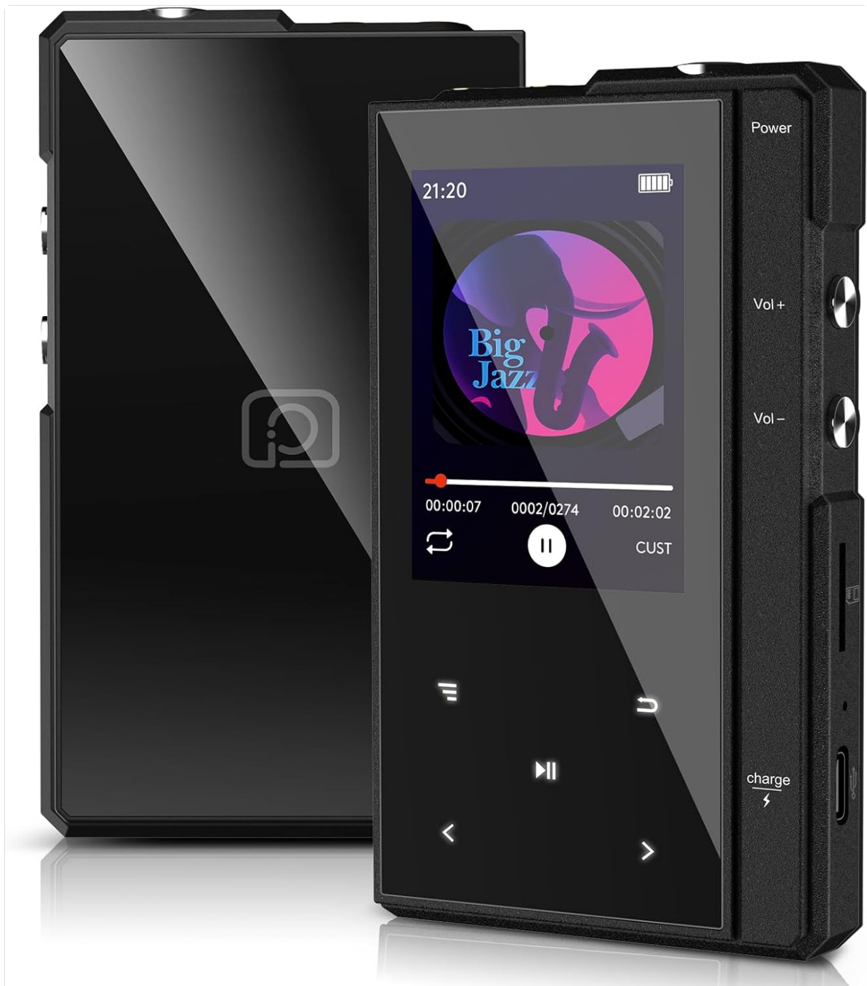
Figure 1.1: Phinistec Z6 Digital Audio Player