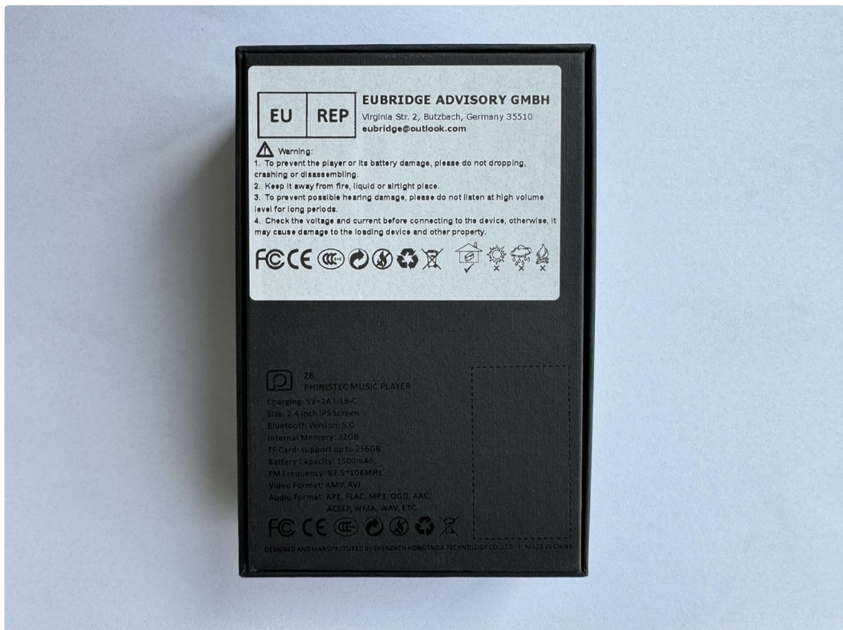
Figure 3.5: Multifunctionality Overview

Video 3.1: Official Product Overview of the Phinistec Z6 MP3 Player with Bluetooth and Speaker.