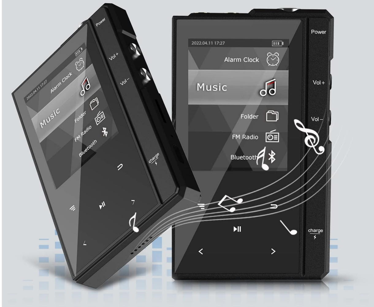
Figure 3.3: Built-in Loud Speaker