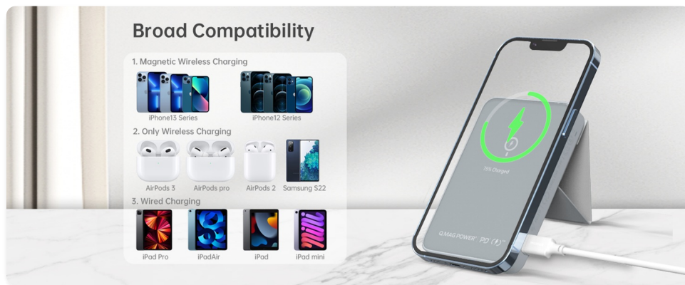
Image: A visual representation of the power bank's broad compatibility, showing various iPhone models for magnetic wireless charging, AirPods and Samsung S22 for standard wireless charging, and iPads for wired charging.