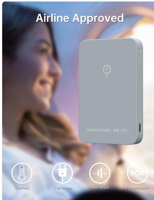
Image: The MOMAX power bank with icons representing its safety features: protection against overheat, over-charge, short-circuit, and Foreign Object Detection (FOD).