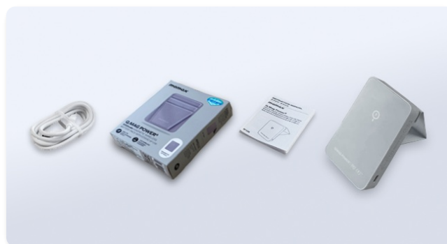
Image: The complete package contents, including the MOMAX power bank, USB-C to USB-C cable, and the instruction manual.