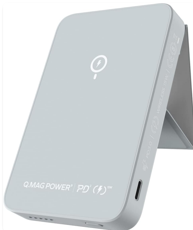
Image: The MOMAX Q.Mag Power Magnetic Wireless Power Bank, showcasing its sleek grey design and

Thank you for choosing the MOMAX Q.Mag Power Magnetic Wireless Power Bank. This compact and versatile device is designed to provide convenient charging for your mobile devices on the go, featuring magnetic attachment, a foldable stand, and both wireless and wired charging capabilities. Please read this manual carefully to ensure proper use and optimal performance.