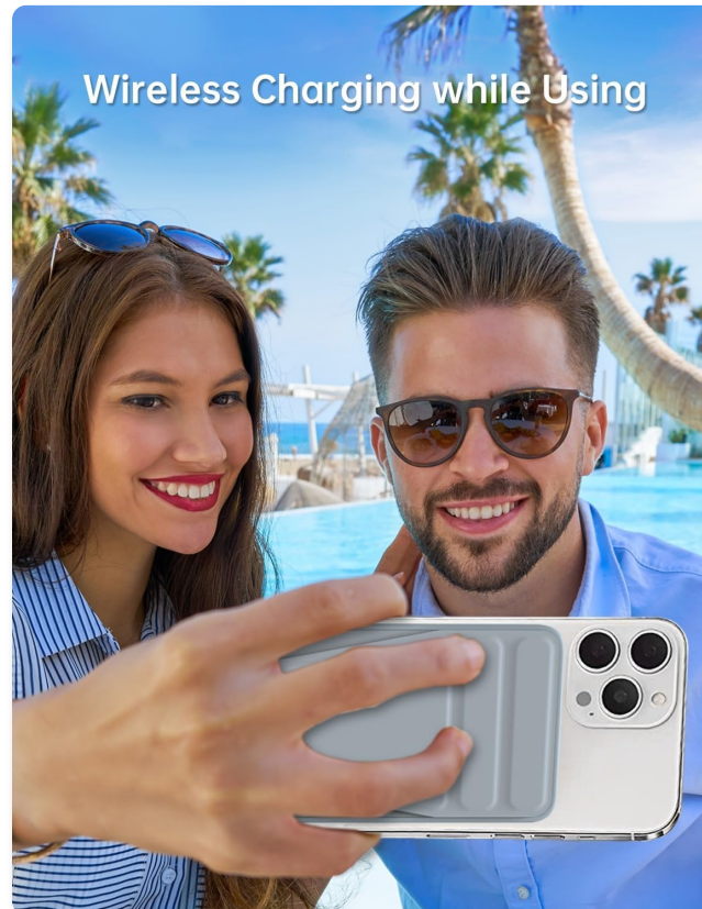
Image: A person holding an iPhone with the MOMAX power bank attached to its back, demonstrating the convenience of wireless charging while actively using the phone.