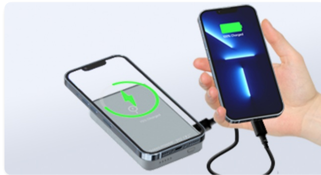
Image: An iPhone displaying a charging animation while resting on the MOMAX power bank, indicating active wireless charging.