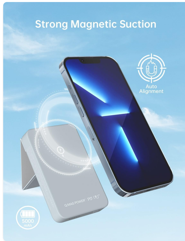
Image: An iPhone floating above the MOMAX power bank, illustrating the strong magnetic suction and auto-alignment feature for wireless charging.