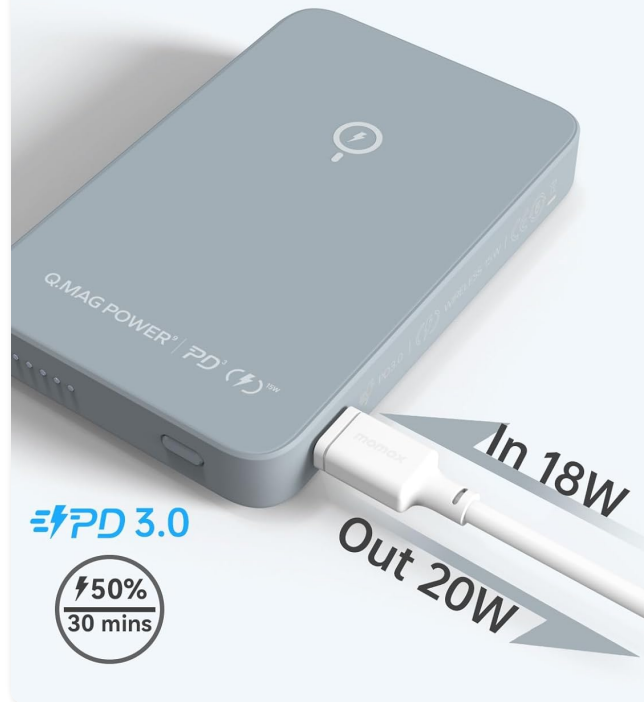
Image: The MOMAX power bank with a USB-C cable plugged in, highlighting its PD 3.0 fast charging capabilities with 18W input and 20W output.